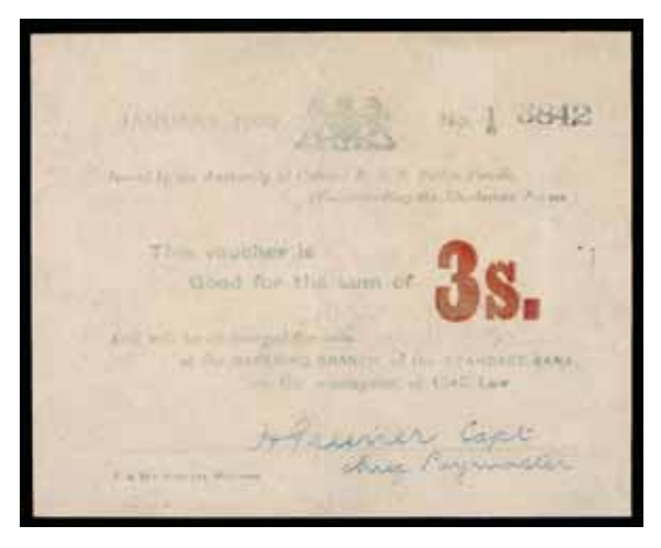
lot 4039 (next page)

South Africa, Anglo-Boer War, Siege of Mafeking, two shillings, issued by the authority of Colonel R.S.S. Baden-Powell, No.B9308, February 1900 (P.S652b), embossed Bechuanaland Protectorate one penny. Flattened of folds, pin holes, 7mm tear top left edge two old tape marks on back, some ink fading, very good.