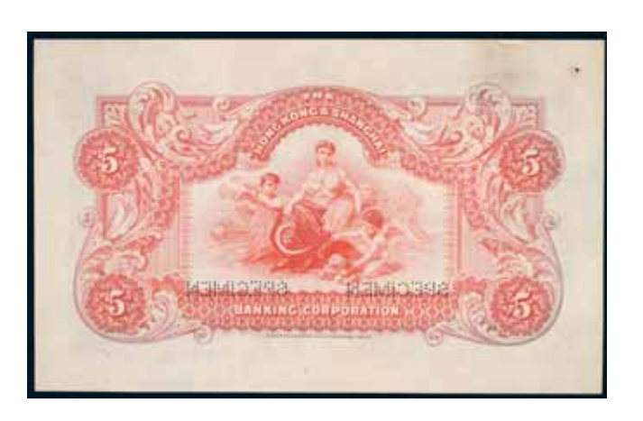
lot 3850 back

Ex W.J.Baker Collection from Spink Australia Sale 34 (lot 2679).