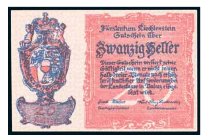
lot 4074 part