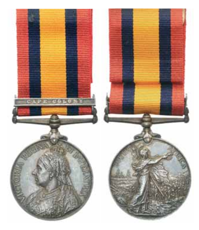
3652* Queen's South Africa Medal 1899, - clasp - Cape Colony. 206 Pte C.L. Maddox Tasmanian I.B. Impressed. Very fine. $950