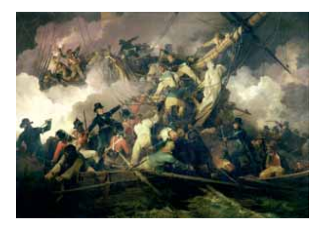
The Cutting-Out of the French Corvette 'La Chevrette' 21st July 1801, painting by Philip James de Loutherbourg in British Museum & Art Gallery (Wikimedia Commons)