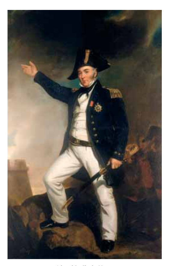
Admiral Sir Charles Napier an 1847 painting by Thomas Musgrave Joy in Royal Museum Greenwich (Wikimedia Commons)