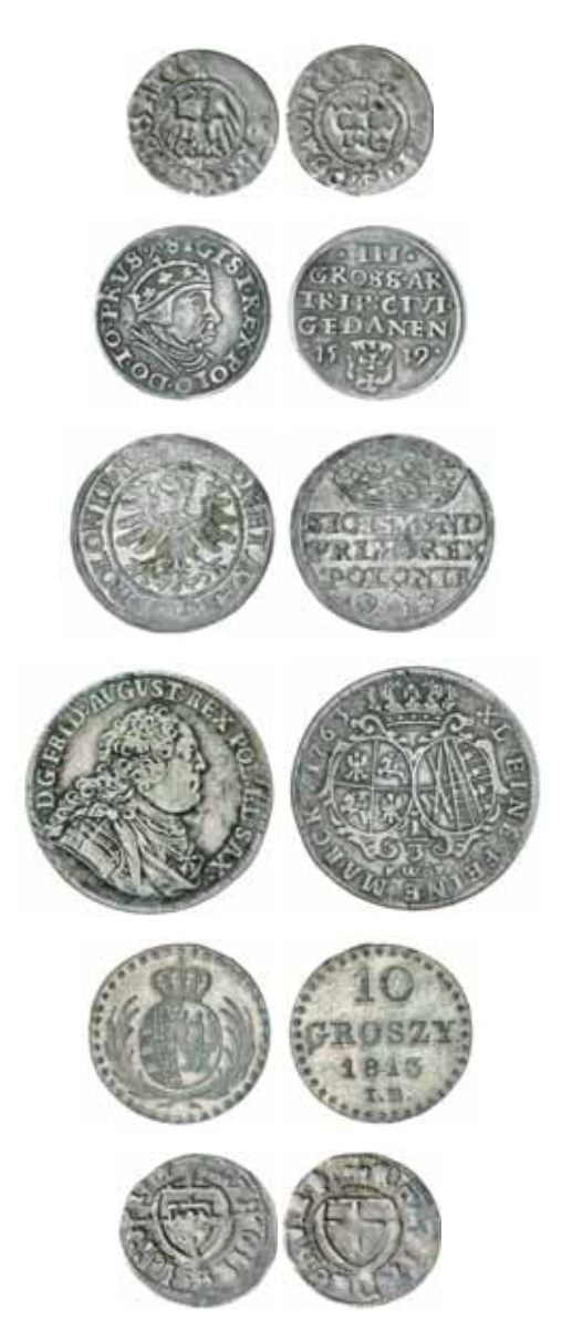
lot 2623 part