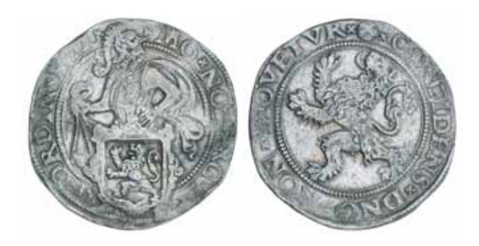
Netherlands, Holland, lion daalder, 15(?) (KM.11). Good fine .