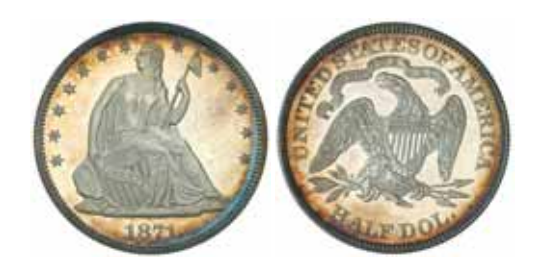
2556* USA , proof seated Liberty half dollar 1871. Attractive golden blue iridescent peripheral frosty highlights and brilliant fields, FDC.