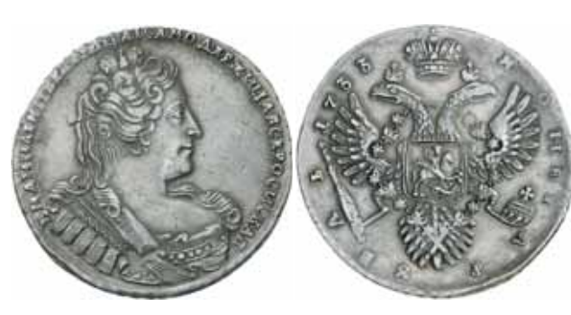
2458^{\ast} Russia, Anna, rouble, 1733 (KM.192.1). Attractive good very fine and scarce thus. $750