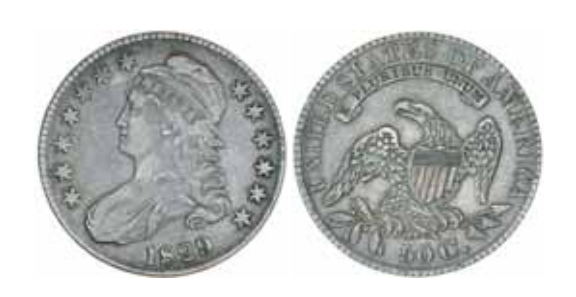
USA , capped bust half dollar, 1829 small letters. Very fine . $150