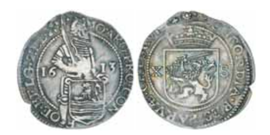
2401* Netherlands, Zeeland, ten stuivers, 1613 (KM,.26). Uneven edges, toned, very fine and scarce.