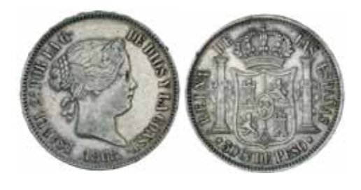
2431* Philippines, Isabel II, fifty centimes, 1868 (KM.147). Peripheral tone, good extremely fine. $100