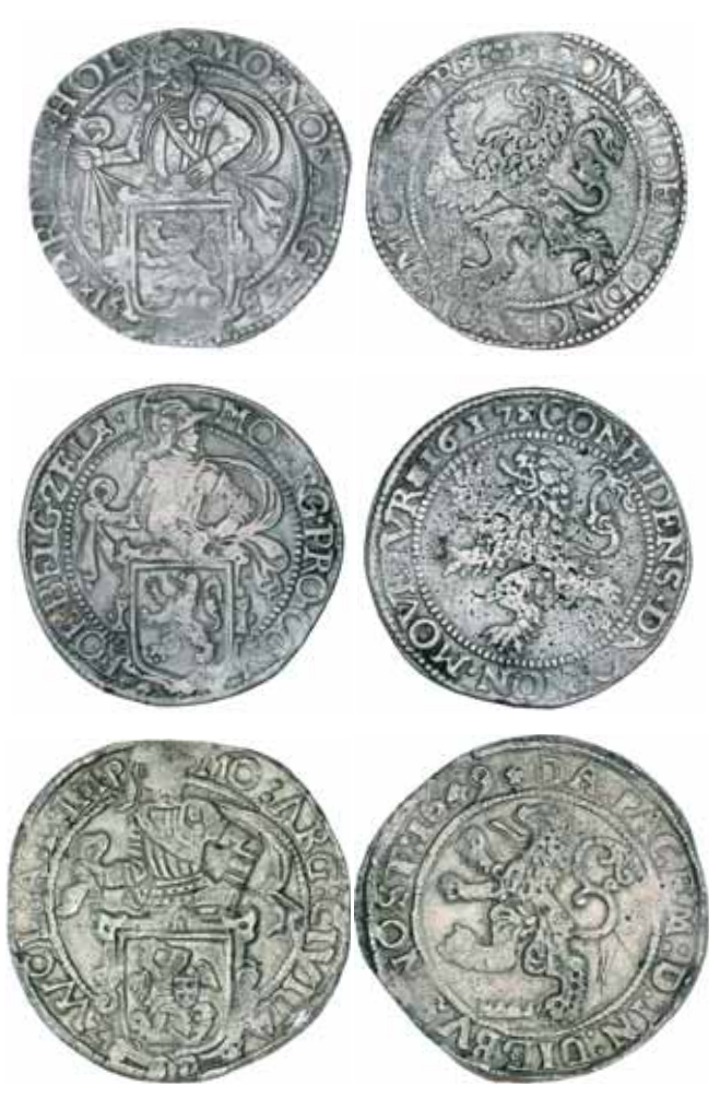
lot 2391 part