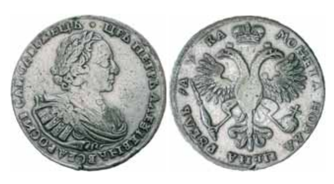
2454^{\ast} Russia, Peter I, (the Great), rouble, 1721 (KM.157.5). Good fine. $400