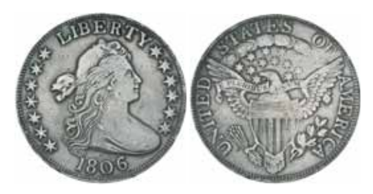
2554* USA , draped bust half dollar, heraldic eagle reverse, 1806, knobbed 6, small stars, double entered T in Liberty. Scratchy tooling below left wing, rubbed somewhat, otherwise good fine.