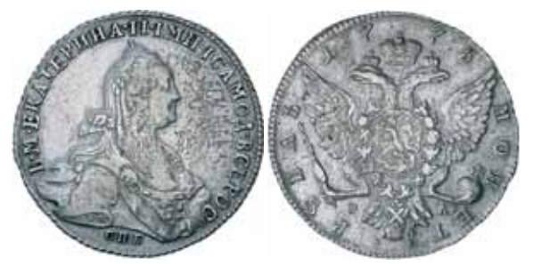
2464* Russia , Catherine II, rouble, 1775 CHB OA (KM.C67a.2). Very fine.

Ex Noble Numismatics Sale 66 (lot 2293).