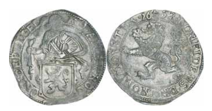
2389^{\ast} Netherlands, Gelderland, lion daalder, 1652 (KM.15.3). Good very fine.