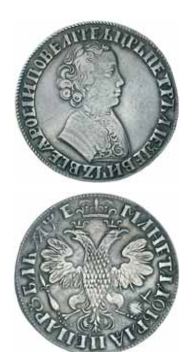
2453* Russia, Peter I, (the Great), rouble, 1705MA, plain edge (Diakov 7) (KM.122.1). Toned, good fine and rare. $7,000