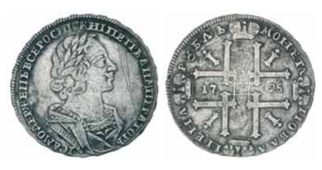
2455\,^* Russia , Peter I, (the Great), rouble, 1725 (KM.162.5). Scratched, otherwise good fine. $200