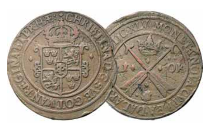
lot 2530 part