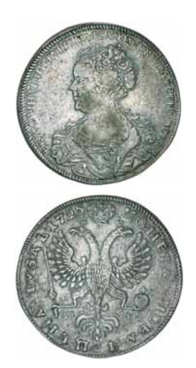
2456\,^* Russia, Catherine I, rouble, 1725 CHB (KM.169). Nearly fine. $$300