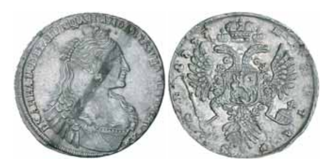
2459^{*} Russia , Anna, rouble, 1737 (KM.197). Good very fine . $400