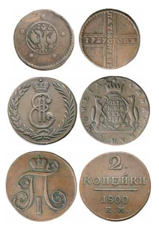
lot 2461 part