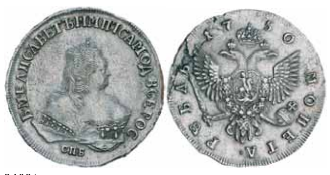
2460^{\ast} Russia , Elizabeth, rouble, 1750 (KM.196.4). Reverse flan flaw otherwise good very fine. $350