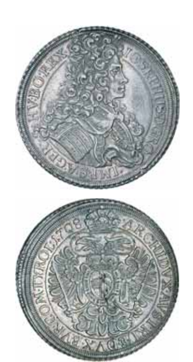
1939* Austria , Joseph I, thaler, 1708 IMH, Vienna Mint (KM.1444). Good extremely fine. $300