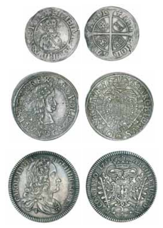
lot 1954 part