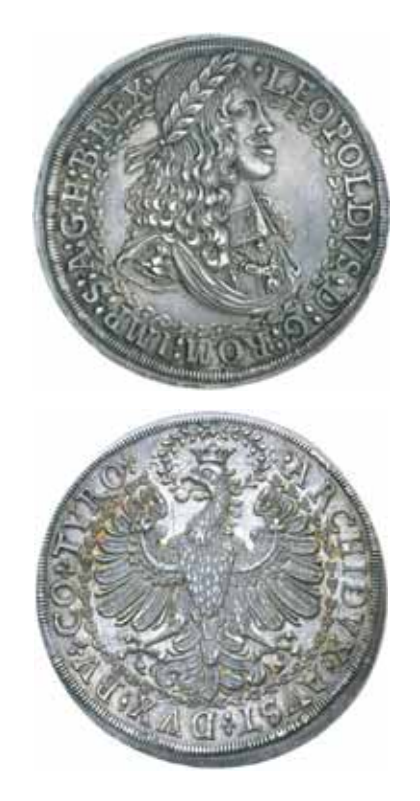
1936* Austria, Leopold I, two thalers, undated (1670), Hall Mint (KM.1119.1)(Dav.3247). Toned, nearly extremely fine.