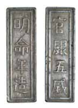
1918* Annam, Minh Mang, silver five tien bullion bar (19.32g), undated (1820-41) (KM.202). Very fine.