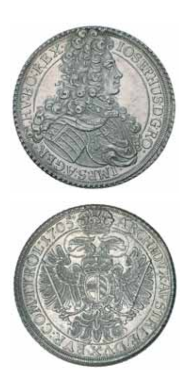
1938* Austria , Joseph I, thaler, 1705 (KM.1444). Extremely fine . $400