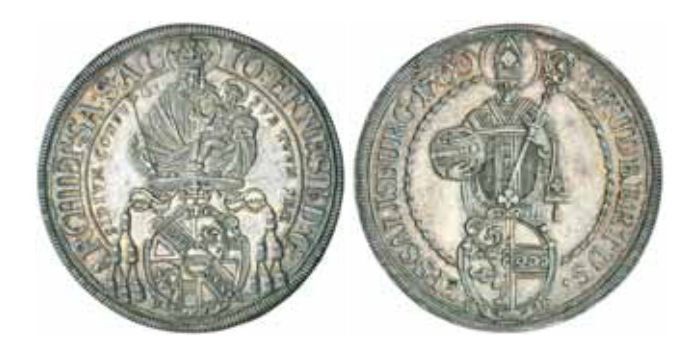
1952* Austria, Salzburg, Johan Ernst, thaler, 1700 (KM.254). Good extremely fine.