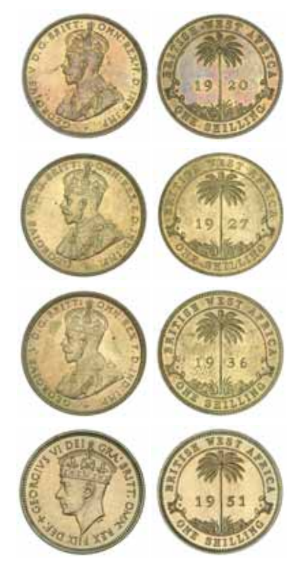
2027* British West Africa , George V, brass shillings, 1920KN, 1927, 1936; George VI, 1951KN (KM.12a, 28). The first like a specimen, uncirculated or better. (4)