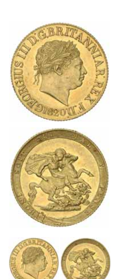
1823^{\ast} George III, new coinage, sovereign, 1820 (S.3785C). Nearly uncirculated. $2,000