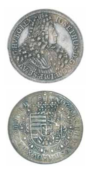
1937* Austria, Joseph I, thaler, 1706 Hall Mint (Dav.1018; KM.1438.1). Toned, nearly extremely fine. $200