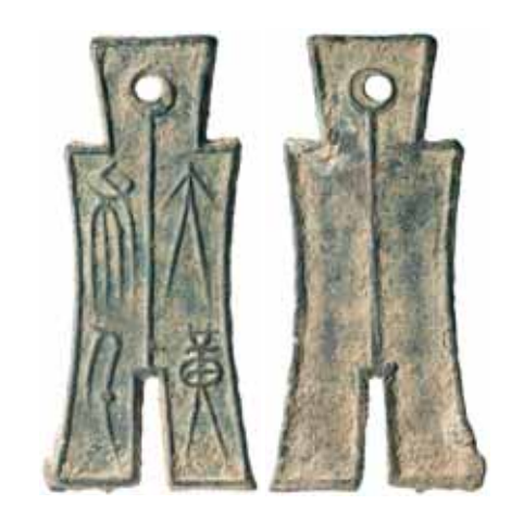
2047* China, Hsin Dynasty, Wang Mang, bronze bu money, (A.7-22). Very fine and scarce.

One of the earliest cash type coins, a type that continued until the 20th century.