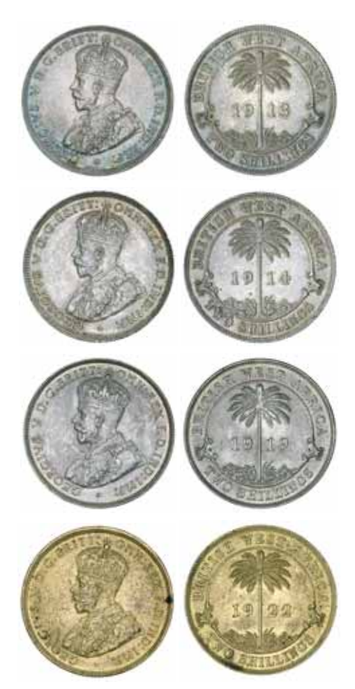
lot 2028 part

The last Ex Kings Norton Mint Archive from Status Sale October 2008 (lot 8698)($360).