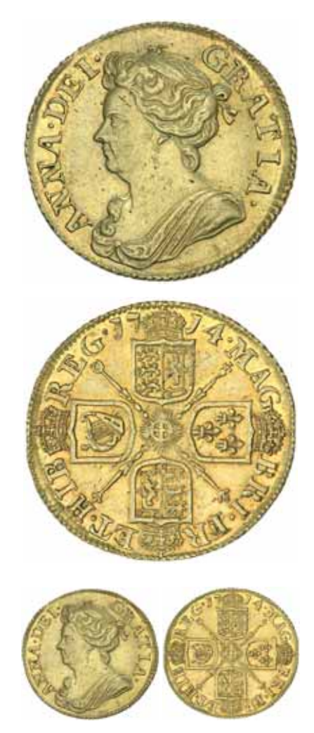
1819* Anne, after the Union, guinea, third bust, 1714 (S.3574). Considerable original mint bloom on the reverse, good extremely fine.