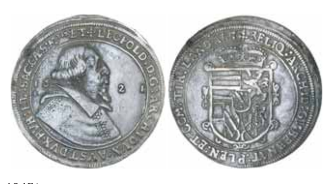
1947* Austria, Leopold, Alsace (Germany), thaler 1621, Geisensheim Mint (KM.257.1). Dark grey brown tone, very fine. $200