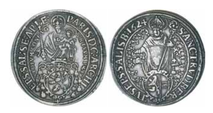
1950^{\ast} Austria, Salzburg, Paris v. Lodron, thaler 1624 (KM.87). Toned, very fine.