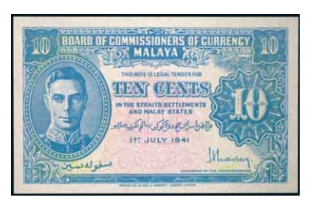
lot 4036 part