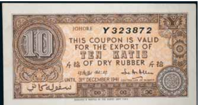
lot 3995 part