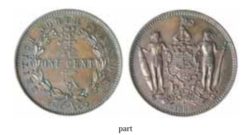
British North Borneo, one cent, 1886H (KM.2). Red and brown, uncirculated. $100