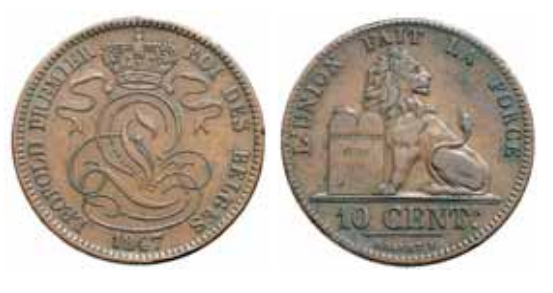
Belgium, Leopold I, ten centimes, 1847 (KM.2.1). Good very fine.