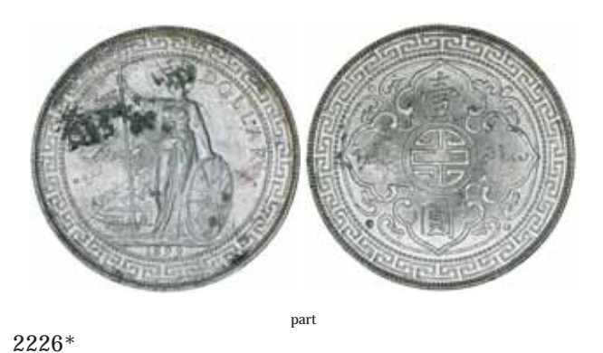
British Trade Dollars, 1899B, 1900B, 1902B, 1911B (KM. T5). Very fine - good extremely fine. (4) $200