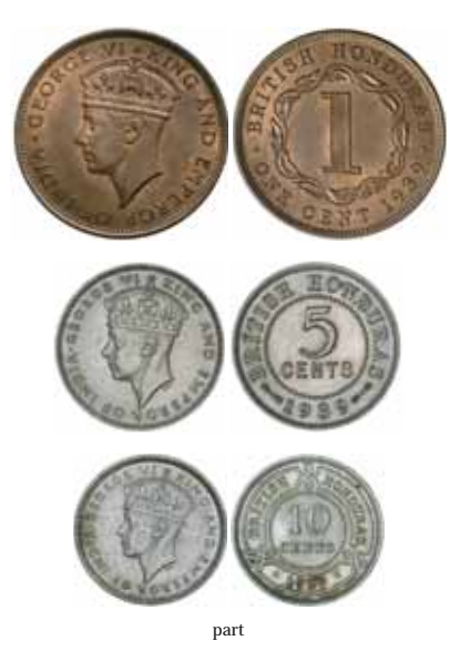
British Honduras, George VI, one cent, 1939 and 1949 (KM.21); five cents, 1939, 1942 and 1952 (KM.22, a, 25); ten cents, 1939 and 1944 (KM.23); twenty cents, 1952 (KM.26). Very fine - uncirculated. (8)