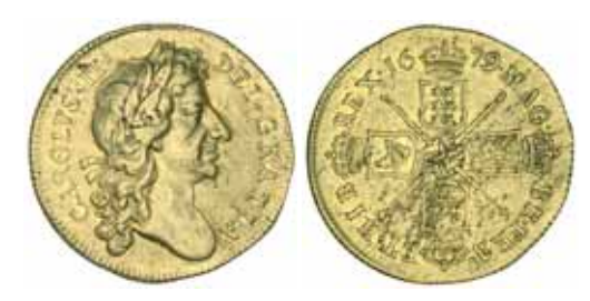
1760* Charles II, two guineas, second bust, 1679 (S.3335). Underlying mint bloom, good very fine.