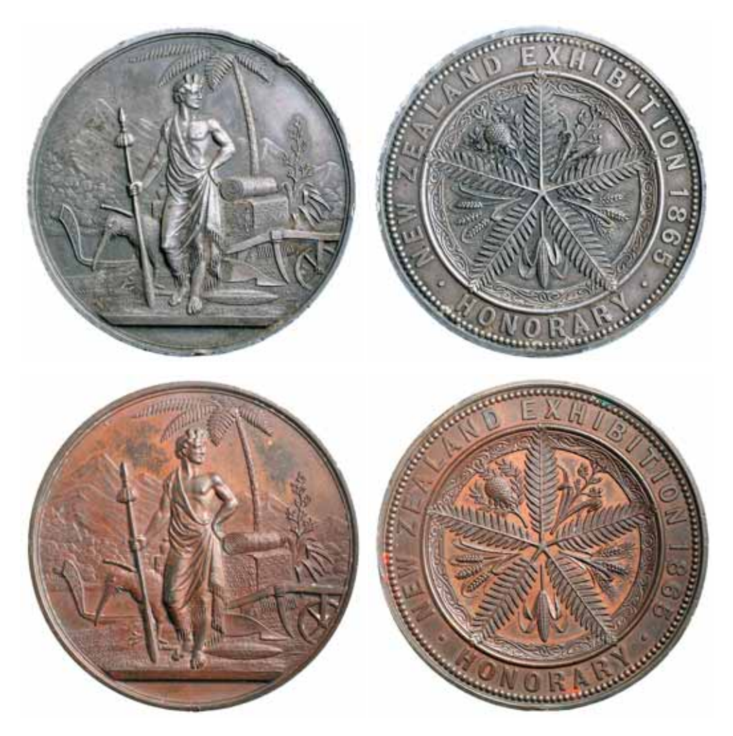
758* New Zealand Exhibition, 1865 (Dunedin) in silver and bronze (64.5mm) (M.1865/1). The silver badly edge damaged, two edge bumps on the bronze, otherwise very fine or better and rare. (2) $800

The first ex Robb Family Collection, Noble Numismatics, Sale 95 (lot 1007, realised $1,400).