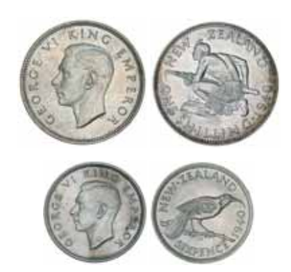
734* George VI, shilling and sixpence, 1940. Uncirculated. (2) $200