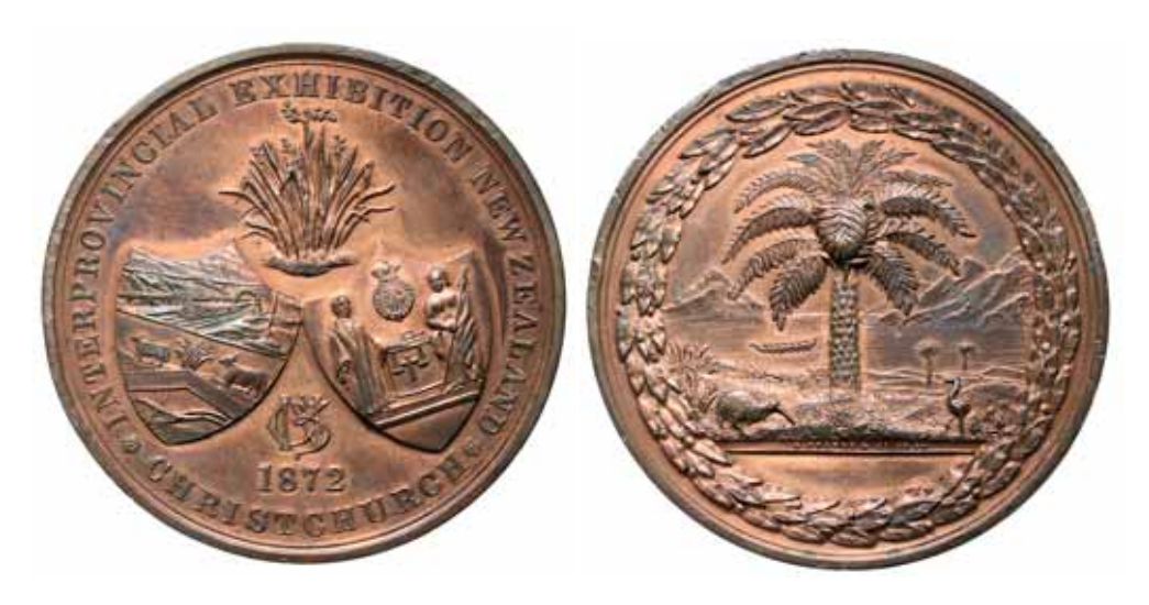
759* Interprovincial Exhibition New Zealand, Christchurch, 1872, in bronze (63mm) by G.Coates & Co, Ch. Ch. (M.1872/1). Cleaned, lightly polished, otherwise nearly extremely fine with minor edge bumps. $300

The first ex Robb Family Collection, Noble Numismatics, Sale 95 (lot 1007, realised $1,400).