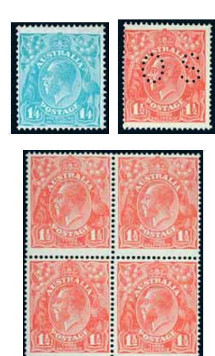
lot 3129 part