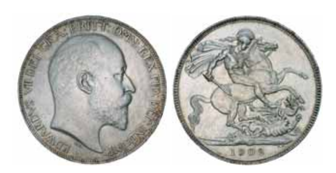
1435* Edward VII, crown, 1902 (S.3978). Uncirculated .