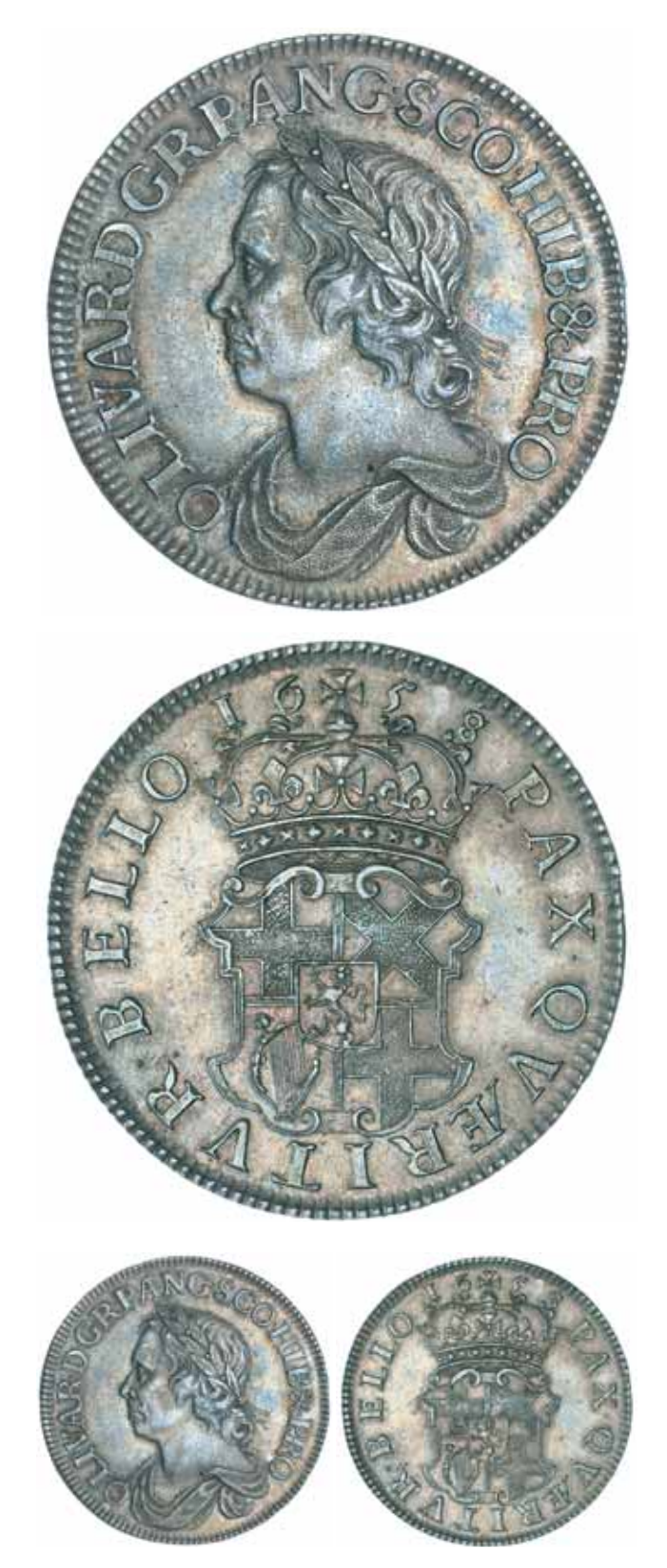
1352* Oliver Cromwell, crown, 1658 (S.3226). Early stage of die break, attractive dark blue and reddish grey toning, extremely fine or better, and rare. $10,000

Ex Spink Australia, Sale 4 (lot 72) and J.P.Melick Collection.