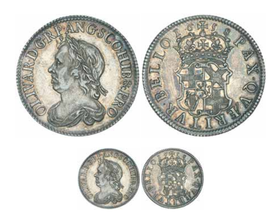
1356* Oliver Cromwell , shilling, 1658 (S.3228). Attractively toned with reflective fields, nearly extremely fine/extremely fine and rare. $4,000

Ex J.P.Melick Collection, private purchase from Spink Australia, 31st July, 1980 ($2,600).