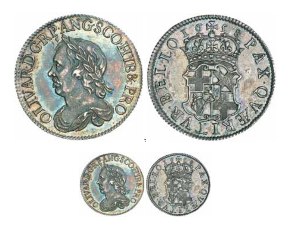
1355* Oliver Cromwell , shilling, 1658 (S.3228). Attractive blue grey and iridescent tone, extremely fine or better and rare. $4,000

Ex J.P.Melick Collection, private purchase from Spink Australia, 31st July, 1980 ($2,600).