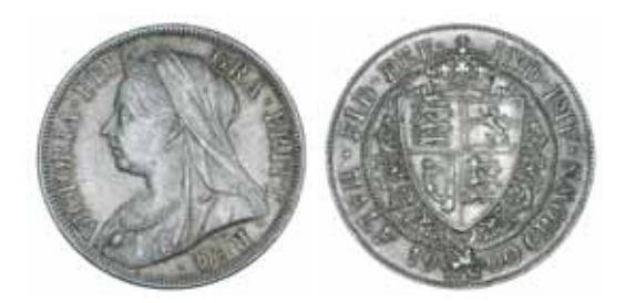
1426* Queen Victoria, old head, halfcrown, 1901 (S.3938). Slight grey tone, good extremely fine. $150