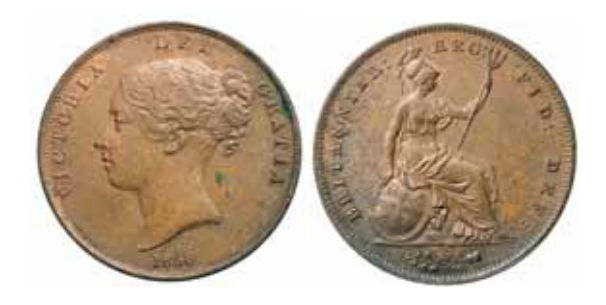
1429 Queen Victoria , young head, copper penny, 1856, ornamental trident (S.3948). Traces of original mint red, a little spotted, good extremely fine or better, and very rare thus.