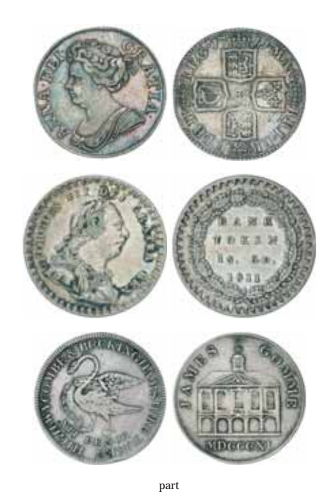
Anne - William IV , shillings, 1711 (S.3618), 1723 SSC (S.3647), 1758 (S.3704), 1834 (S.3835); sixpences, 1723 SSC (S.3652), 1787 (S.3749); bank token, eighteen pence, 1811 (S.3771), shilling token, 1811, James Gomme, High Wycombe and Buckinghamshire, (D.I.). Very good - good very fine. (8)