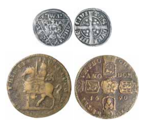
lot 1454 part

Struck by INA Ltd in 2008, the total mintage only 750 sets.