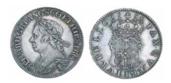
1354* Oliver Cromwell, halfcrown, 1658 (S.3227A). Attractively toned, extremely fine and rare.

Ex J.P.Melick Collection, private purchase from Spink Australia, 17th July, 1980 ($5,000).