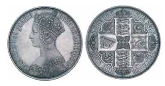
1410* Queen Victoria, Gothic crown, 1847, undecimo (S.3883).

Queen Victoria, Gothic crown, 1847, undecimo (S.3883). Obverse has been wiped, minute obverse field contact marks at 8 o'clock, otherwise nearly uncirculated.