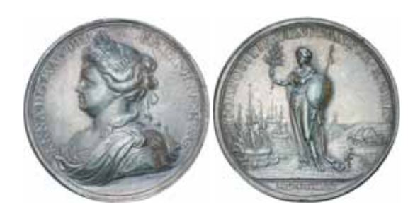
1480* Anne , Peace of Utrecht, 1713, in silver (35mm) by J.Croker, (Eimer 460; MI 400/257). Fine; nearly extremely fine. (2)