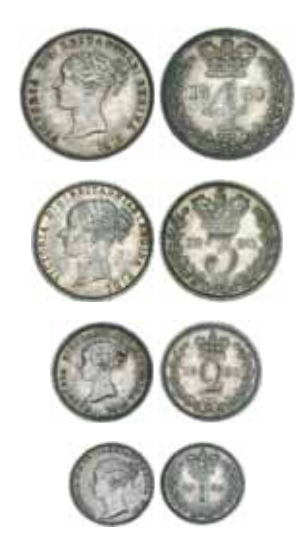
1419* Queen Victoria, young head, Maundy set, 1880 (S.3916). Toned, extremely fine or better. (4)