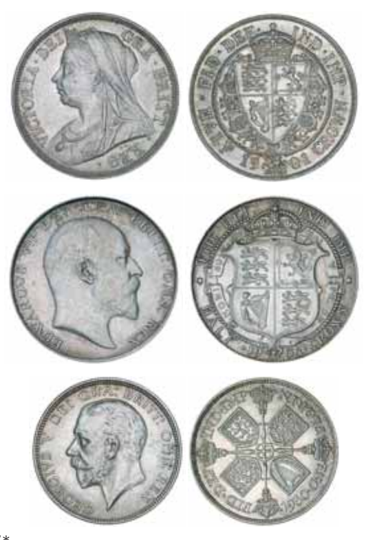
1427* Queen Victoria , old head halfcrown, 1901 (S.3938); Edward VII, halfcrown, 1906 (S.3980); George V, halfcrown, 1928 (S.4037), florin, 1930 (S.4038); George VI, halfcrown, 1941 (S.4080). Extremely fine - nearly uncirculated, the fourth scarce. (5)