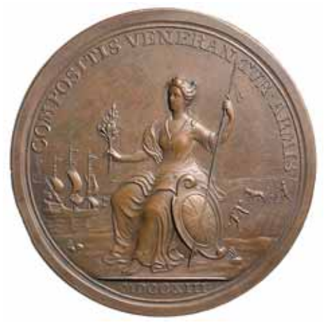
1481* Anne, Peace of Utrecht, 1713, in bronze (58mm) by J.Croker (Eimer 458; MI 399/216). Obverse hairline scratch, rim bruises and edge cut otherwise nearly extremely fine.