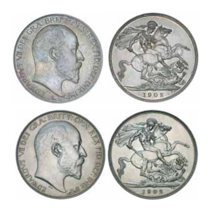
1434* Edward VII, matte proof crowns, 1902 (S.3979). One olive toned, both nearly FDC. (2) $600