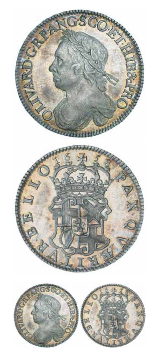
1353* Oliver Cromwell, halfcrown, 1658 (S.3227A). Light grey iridescent toning, proof-like virtually mint state, choice uncirculated and rare, one of the finest known. $6,000

Ex J.P.Melick Collection, private purchase from Spink Australia, 17th July, 1980 ($5,000).