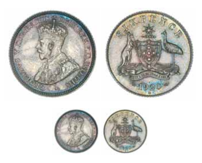
1176* George V, 1920M. Deep iridescent tone, unmarked, choice uncirculated and rare thus.