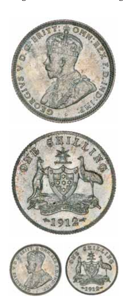
George V , 1912. Subdued full original mint bloom, light toning, well struck and very rare in this condition, choice uncirculated, one of the finest known, superior to the Fenton coin (lot 3060).