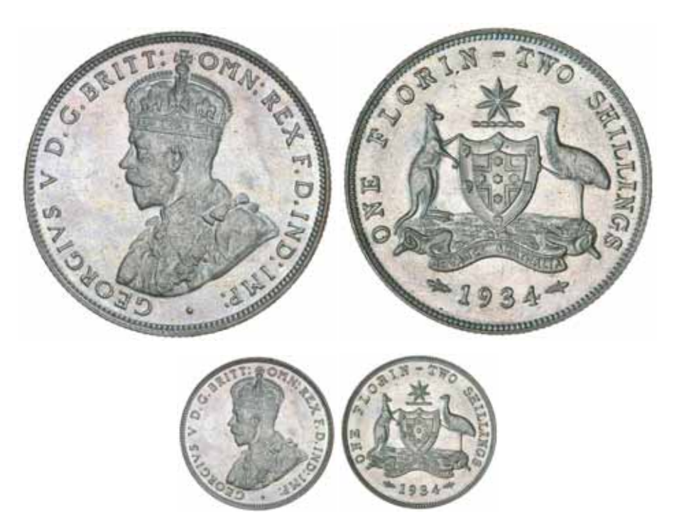
1139* George V, 1934. Sharply struck like a specimen, gem uncirculated.