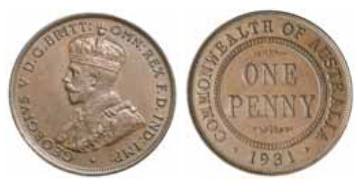
1285* George V, 1931 London die. Brown, hints of red, nearly uncirculated.