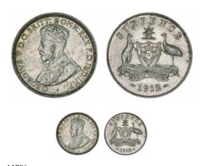
1170* George V , 1912. Full original mint bloom, lightly toned, choice uncirculated and very rare in this condition, one of the finest known.