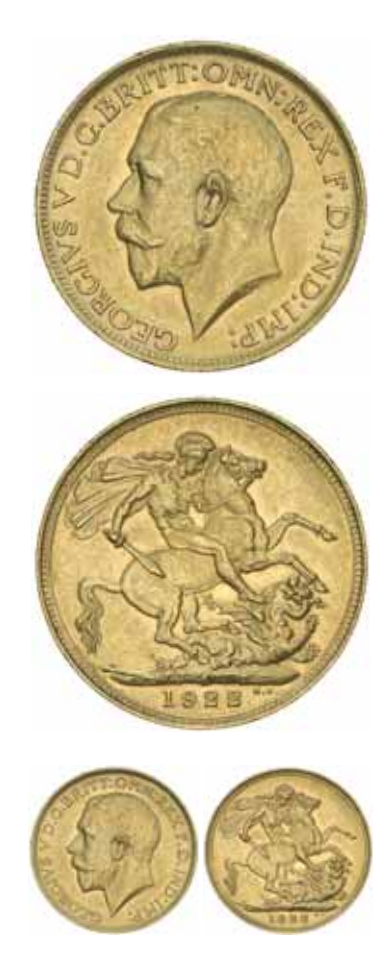
1073* George V, 1922 Sydney. Good extremely fine/nearly uncirculated and very rare.