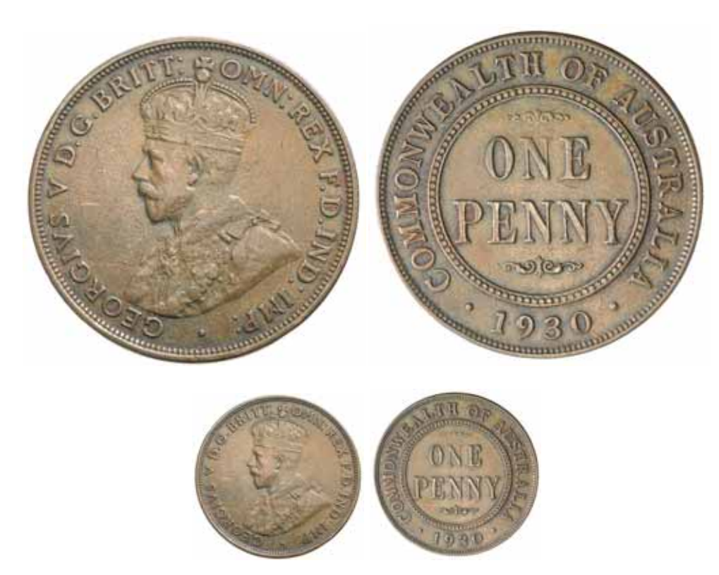
1283^{\ast} George V, 1930 Indian die. Six pearls, with part centre diamond, nearly very fine/very fine.