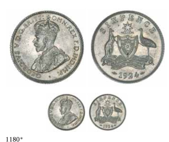
George V , 1924. Hairline die breaks on the reverse, lightly toned and unmarked, choice uncirculated and rare in this condition, one of the finest known.