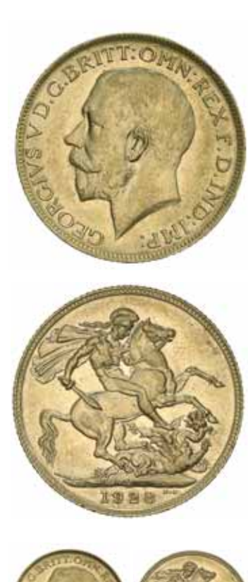
1074* George V, 1928 Melbourne. Good extremely fine and rare. $2,500