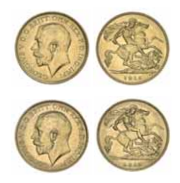
1085^{\ast} George V, 1915 Melbourne and Perth. Extremely fine. (2) $500