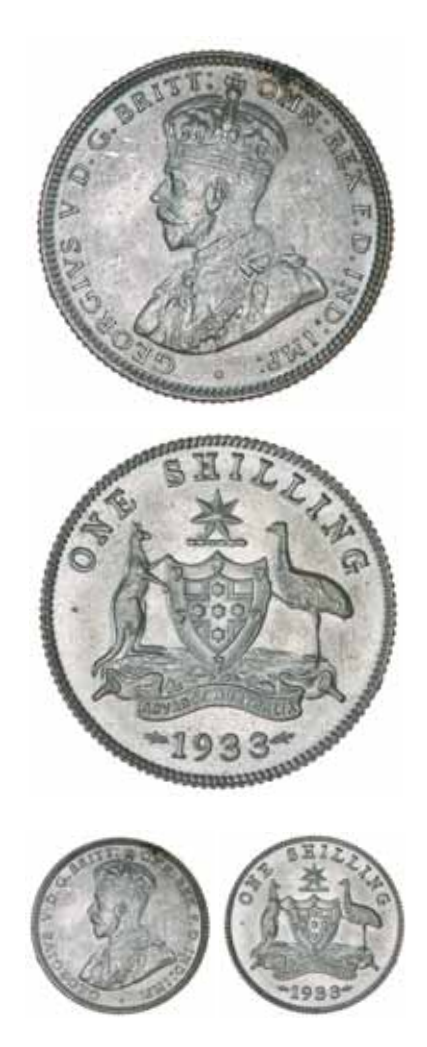
1162* George V , 1933. Full original satin-like mint bloom, choice uncirculated and very rare in this condition, one of the finest known, superior to the Fenton coin (lot 3077).