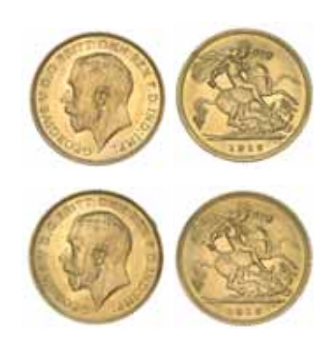
1087* George V, 1916 Sydney. Choice uncirculated. (2)