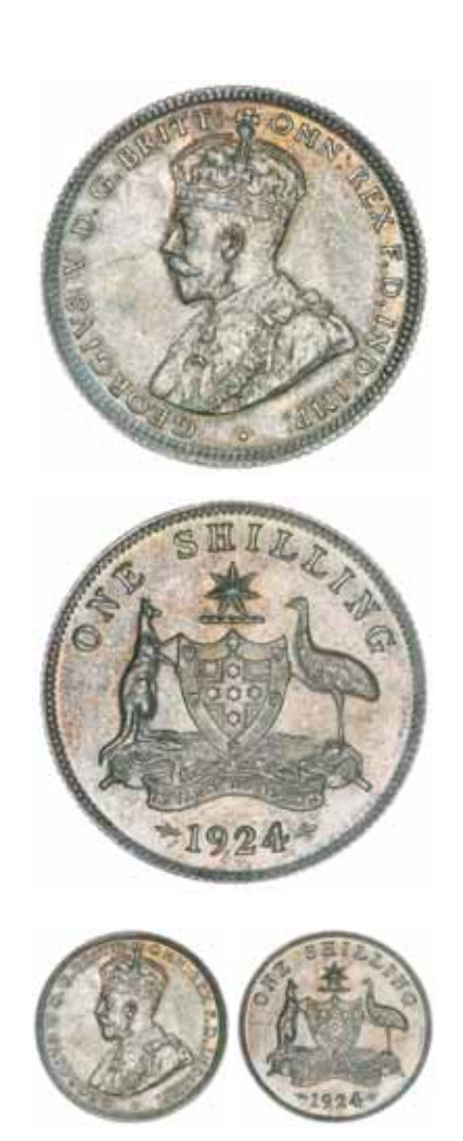
George V, 1924. Dull dusty obverse tone, olive red toned reverse with full original mint bloom underneath and unmarked, uncirculated/choice uncirculated and rare in this condition.