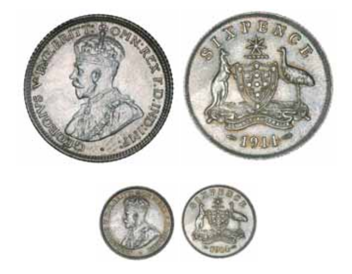
1171* George V, 1914. Deep crimson and iridescent tone, choice uncirculated and very rare in this condition, one of the finest known.