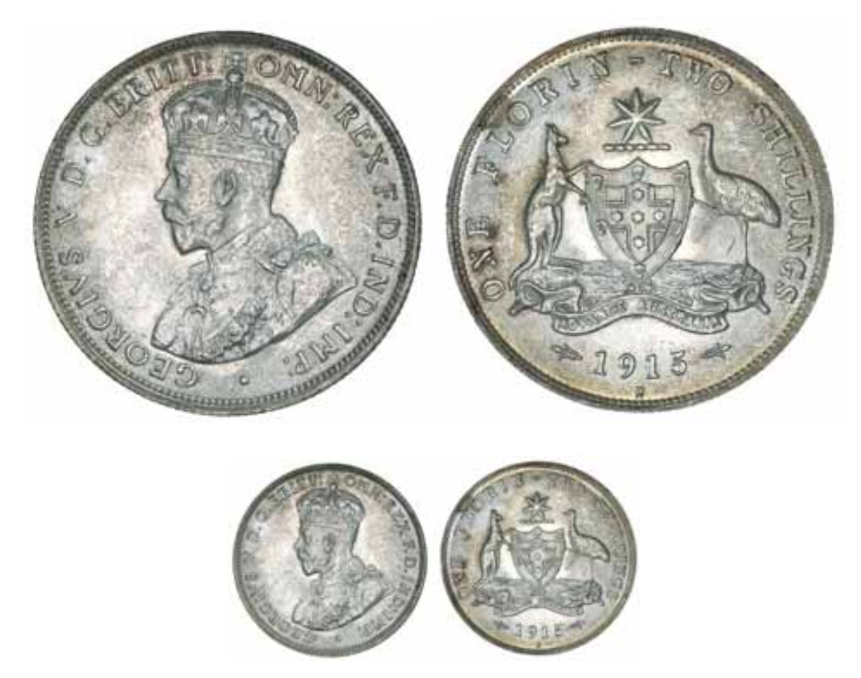
1123* George V, 1915H. Full original frosty mint bloom, touches of golden highlights, uncirculated/choice uncirculated and rare in this condition.