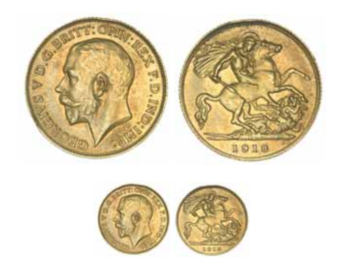
1088* George V, 1918 Perth. Minor obverse rim bruise at 9 o'clock, otherwise good extremely fine and rare. $4,000