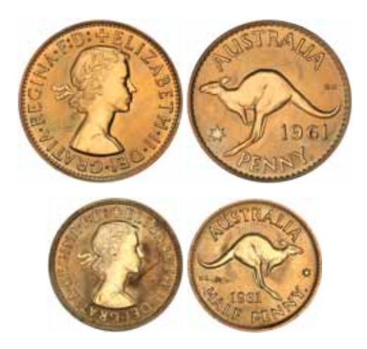
1109* Elizabeth II, Perth Mint proof set, 1961. FDC . (2)