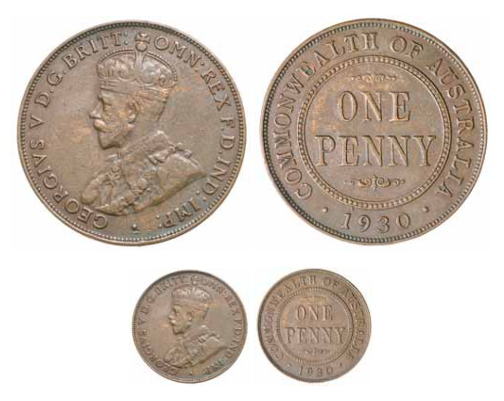
1282* George V, 1930, Indian die. Six pearls and nearly full centre diamond in the crown band, very fine and rare.