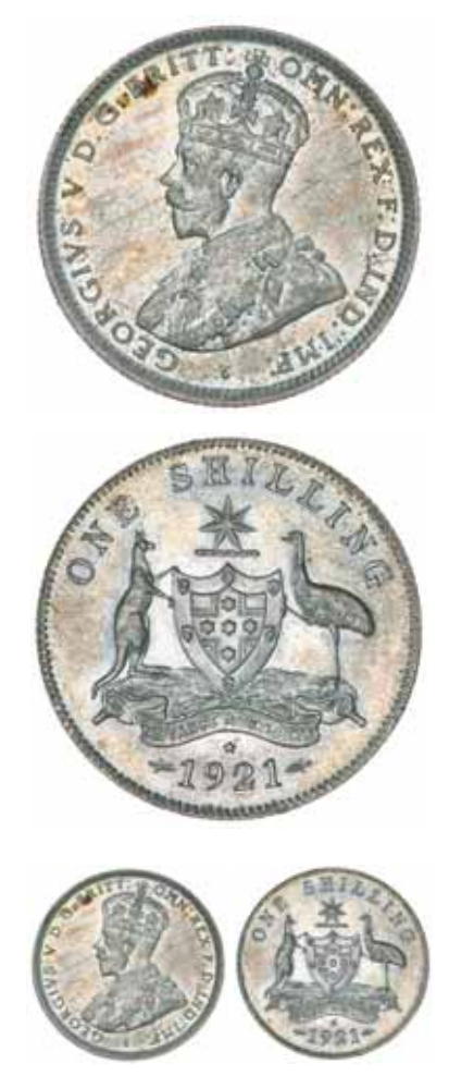
1154* George V, 1921 star. Subdued original mint bloom, light brown toning, uncirculated or better and very rare in this condition.