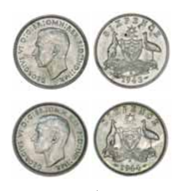
1191* George VI - Elizabeth II , 1942D to 1951PL, 1954 to 1963. The 1959 and 1960 toned, nearly uncirculated, others all choice to gem uncirculated. (21) $2,000

This set would almost parallel the Fenton Collection (lots 3132 - 3154).