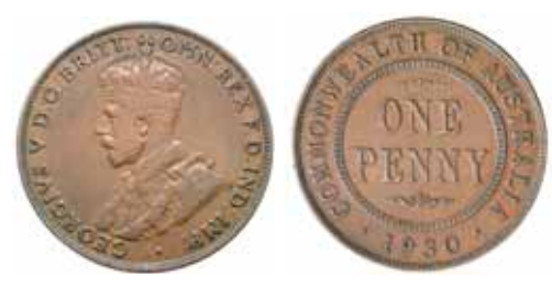
1284^{\ast} George V, 1930 Indian die. Even brown patina, fine/good fine and rare.