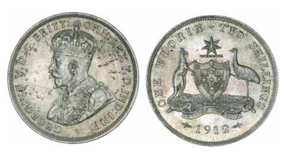
lot 1118 next page