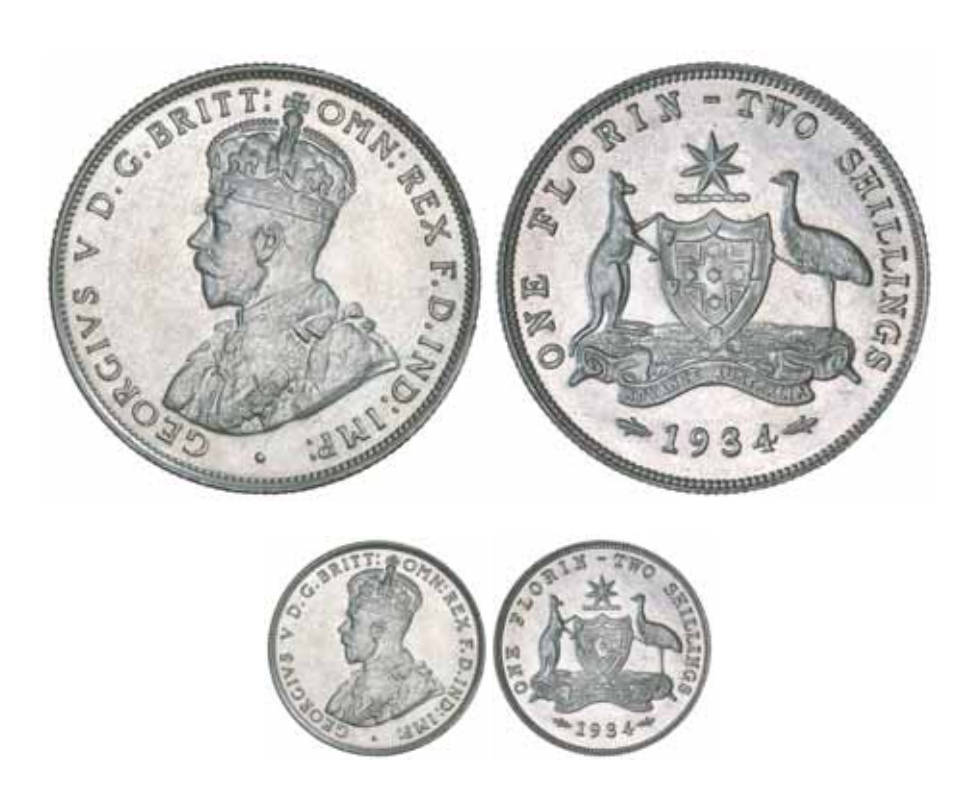
1140^{\ast} George V, 1934. Full original mint bloom, choice uncirculated and rare in this condition.