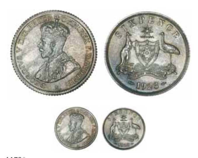
1179* George V , 1923. Attractively toned, unmarked, choice or gem uncirculated and very rare in this condition, one of the finest known, superior to the Fenton coin (lot 3118).