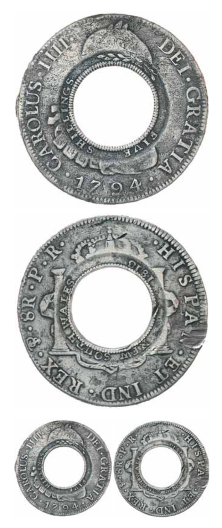
New South Wales, five shillings or holey dollar, 1813, struck on a Bolivia, Charles IIII eight reales, 1794PR Potosi Mint (Mira-Noble 1794/9, dies B/4: II/5). Spade mark, water and soil affected, otherwise good fine and rare. $50,000