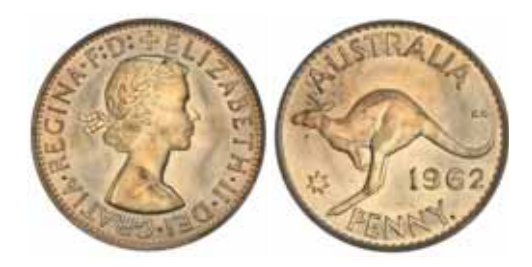
1113* Elizabeth II , Perth Mint proof penny, 1962. FDC .

Elizabeth II , Perth Mint proof set, 1962. Full mint red, FDC. (2)