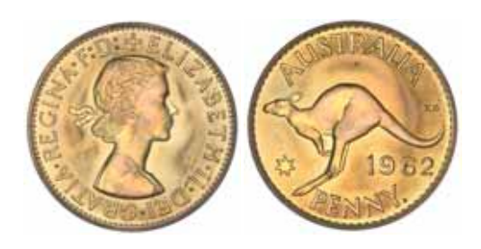
1114* Elizabeth II , Perth Mint proof penny, 1962. Full mint red, FDC.