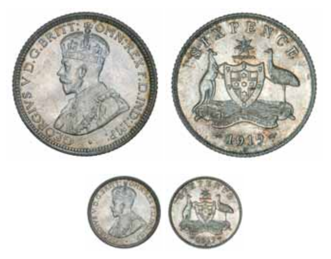
1175* George V , 1919M. Attractive minimal toning, full original mint bloom, choice uncirculated, one of the finest known, superior to the Fenton coin (lot 3114).