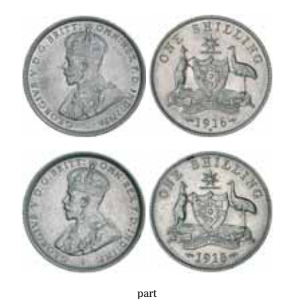
George V, 1916M. Die axis at 45 degrees, extremely fine. $50