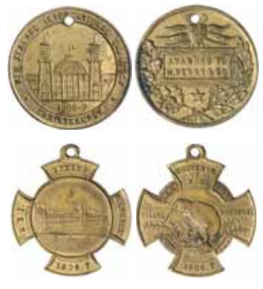
lot 479 part