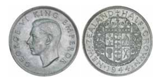
George VI, halfcrown, 1940 (Centennial); 1944. Nearly uncirculated, the second very scare in this condition. (2)