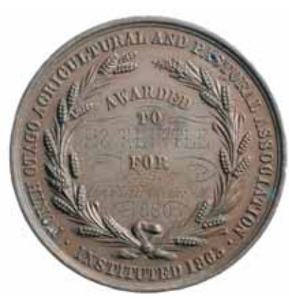
lot 481 reverse