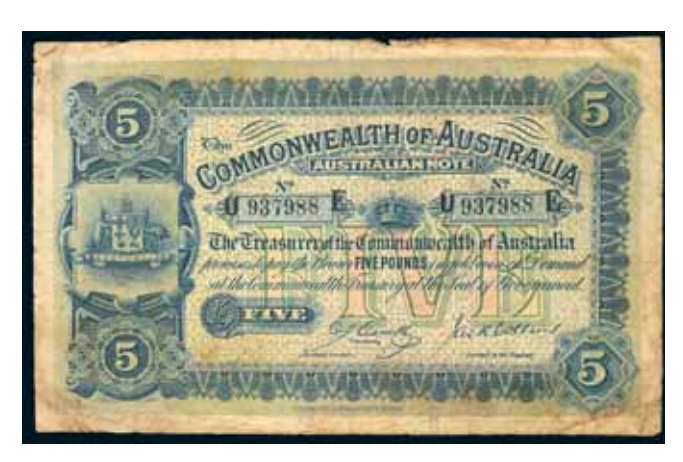
Lot 4252 front