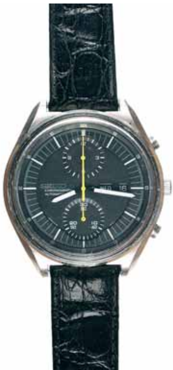
3265* Seiko , a good Seiko Vintage mens steel chronograph wristwatch. Case reference: 6138-3002. Case serial number 772583. Working condition. Case, movement and dial signed. Overall condition very good but case back slightly dented.