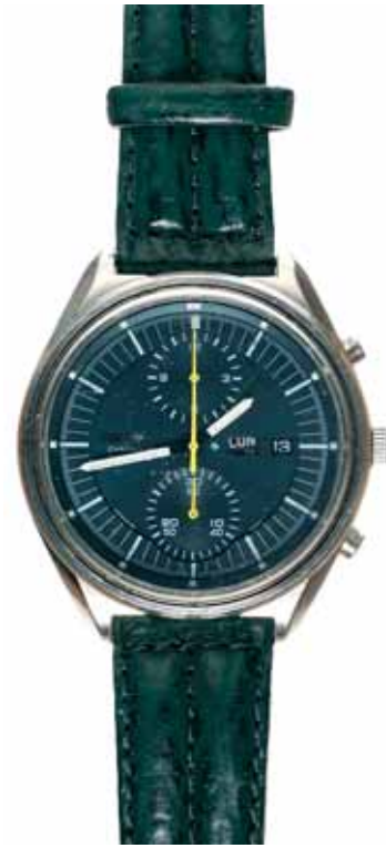
3266* Seiko , a good Seiko Vintage mens steel chronograph wristwatch. Case reference: 6138-3002. Case serial number 535441. Working condition. Case, movement and dial signed. Overall condition very good.