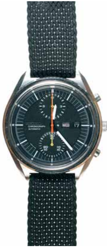
3264* Seiko , a good Seiko Vintage mens steel chronograph wristwatch. Case reference: 6138-3002. Case serial number 762454. Working condition. Case, movement and dial signed. Overall condition excellent but case back scratched.