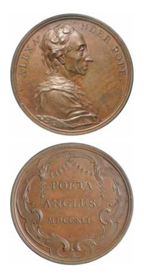
Alexander Pope, 1741, in bronze (54mm) by J.A.Dassier, obverse, draped bust right, reverse 'Poeta/Anglus/MDCCXLI' within ornamental border (Eimer 564, MIii 565/198). Extremely fine. $100