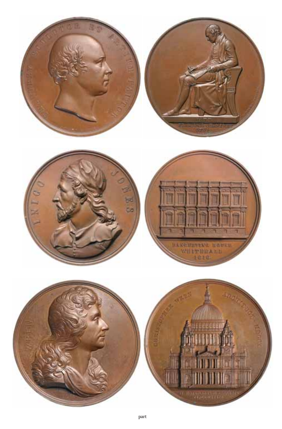
Art Union of London, 21 of the 30 medals in the series, mostly by the Wyons, in bronze (55 mm), Eimer pp311, numbers; Bacon, 1573, Baily, 1691, Banks, 1523, Barry, 1558, Chambers, 1516, Chantry, 1381, EHY162, Flaxman, 1479, Gainsborough, 1529, Hogarth, 1427, Jones, 1437, Lawrence, 1539, Leslie, 1608, Maclise, 1659, Mulready, 1657, Reynolds, 1399, Stothard, 1672, Turner, 1655, Westmacott, 1600, Wilkie, 1549, Wren, 1411; housed in Leuchtturm cabinet. Good extremely fine - uncirculated. (21)