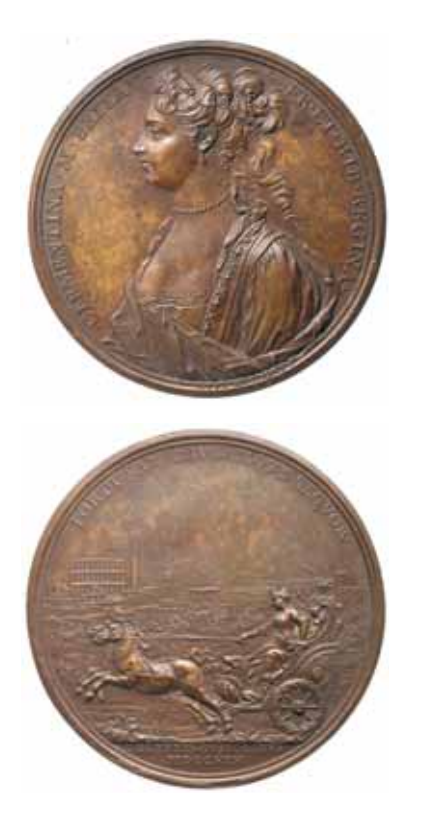
Princess Clementina , Escape from Innsbruck, 1719, in bronze (48mm), by O.Hamerani (MI 444/49; Eimer 454). Good extremely fine.