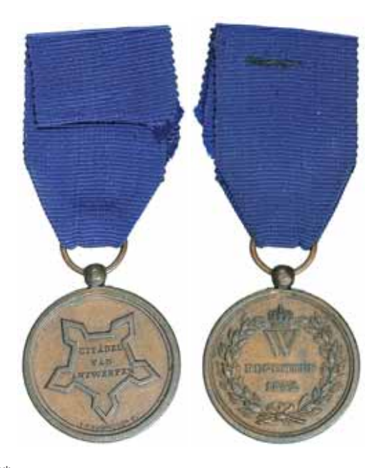
5278^{\ast} Netherlands, Siege of Antwerp Medal 1832. Very fine. $100