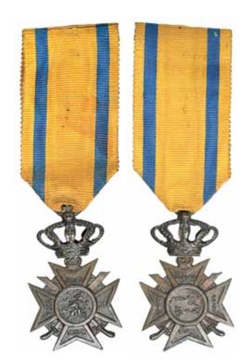
5282* Netherlands, Cross for Bravery and Loyalty 1898, issued to islanders serving with Dutch East Indies Army, with Javanese inscription on reverse and hence very rare. Extremely fine. $900