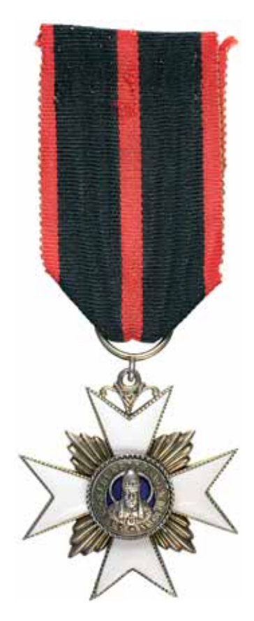
5329* Vatican, Papal Order of St Sylvester, Knight. Good very fine.