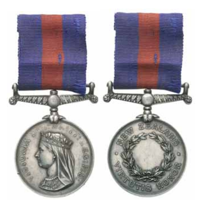
5124* New Zealand Medal 1869 , undated reverse. 3156 Pte. G.Byford. 40th Foot. Engraved. Small edge nick on obverse, otherwise very fine.