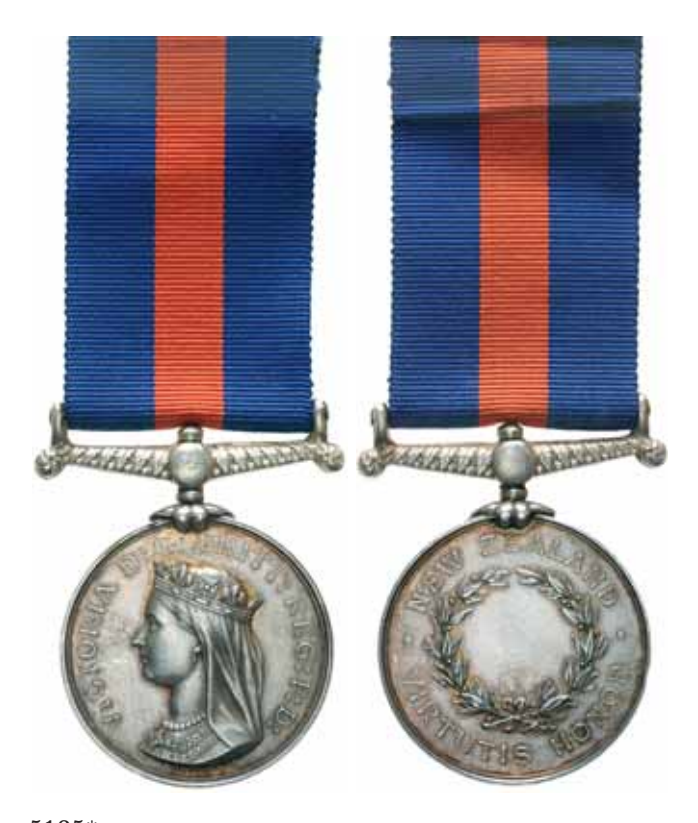
5125* New Zealand Medal 1869, undated reverse. T.Fraser 1st Waikato Regt. Engraved. Very fine.