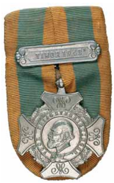
5284* Netherlands, Mobilization Cross 1914-18; Mobilization Cross 1939; Expedition Cross - clasp - Timor 1942. Good very fine. (3)