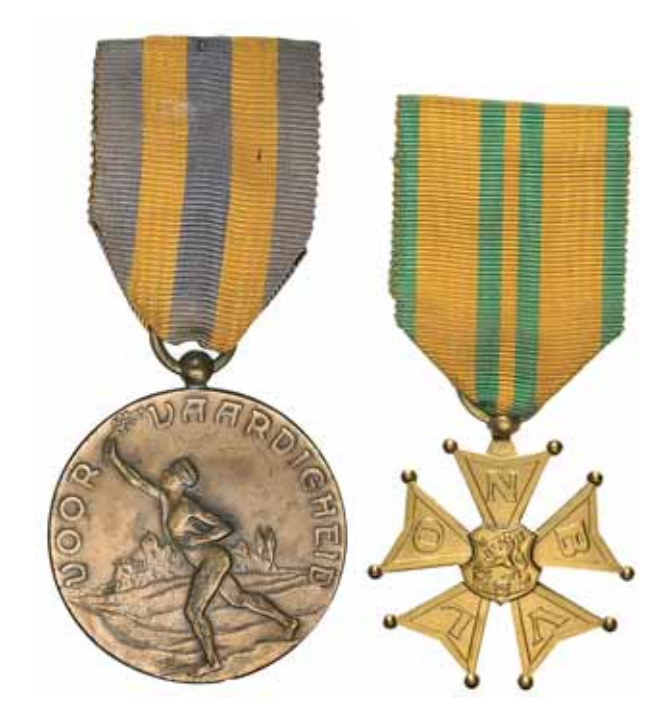
5285* Netherlands, Skills Medal of the Royal Dutch-Indian Army 1919, in bronze for first successful participation; Vierdaagse Cross (Nijmegen Marches Cross) pre 1959, in gilt bronze for first or second successful march. Good very fine; extremely fine. (2)