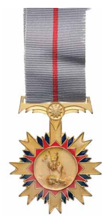
5321^{\ast} South West Africa Police, Star for Distinguished Merit, in gilt and enamel. Uncirculated.