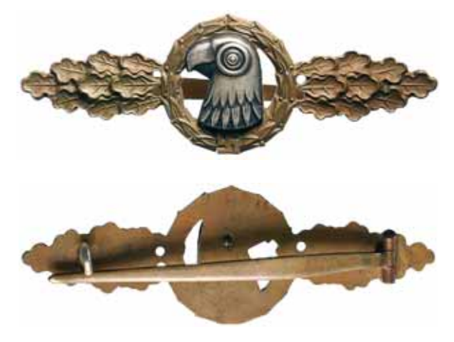
5265* Germany, Third Reich, Squadron Clasp for Reconnaissance Pilots, Bronze grade. Extremely fine .