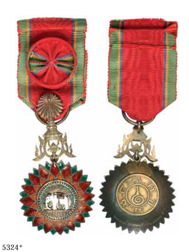
Thailand, Order of the White Elephant, Commander (?) breast badge. Nearly extremely fine.