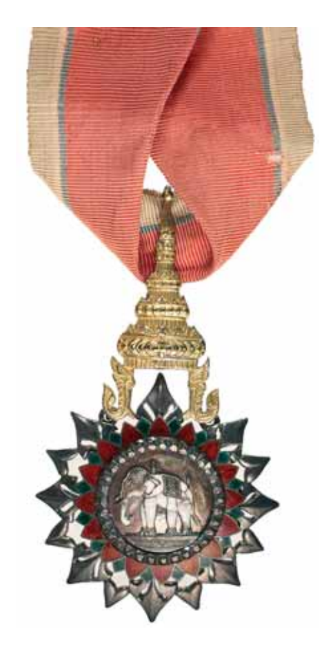
5323* Thailand, Order of the White Elephant, Commander neck badge. In case of issue, ribbon very faded and torn, medal toned extremely fine.