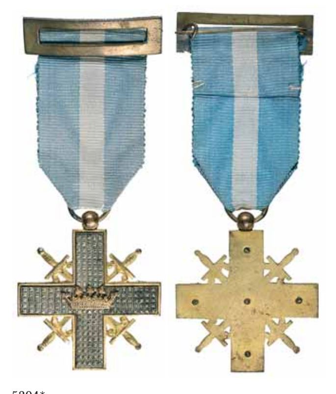
5304* Spain, War Cross 1936-39. Nearly extremely fine.