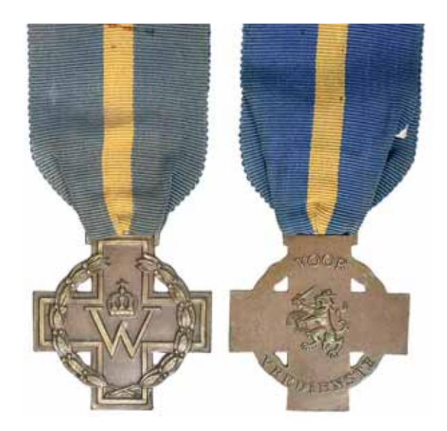
5287* Netherlands, Cross of Merit 1941. Good very fine.