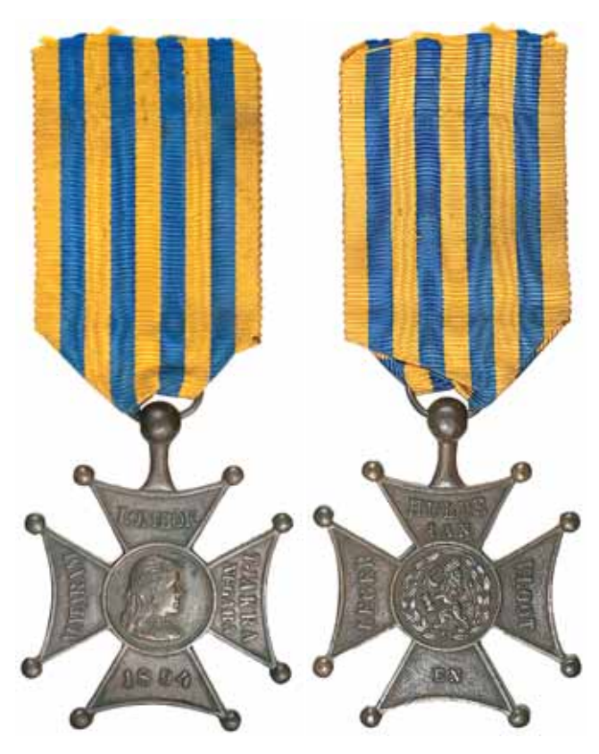
5281^{*} Netherlands, Lombok Cross 1894. Toned good very fine. $100