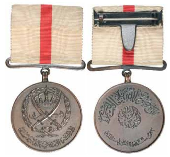
5272* Jordan, Victory Medal 14 October 1950. Extremely fine. $100