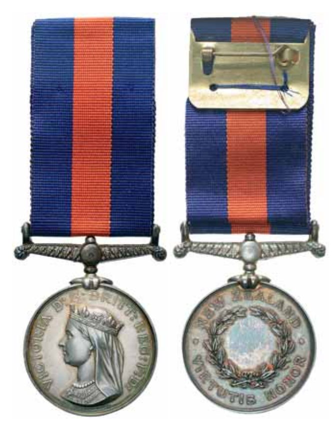
5123* New Zealand Medal 1869 , (undated reverse). K.Brennan 4th Waikato Mila. Engraved. Toned, fine. $800

Ex Noble Numismatics Sale 65 (lot 1058) and Spink Noble Sale 43 (lot 1239)