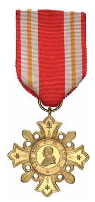
5330* Vatican, Pro Ecclesia et Pontiface Cross (Cross of Honour) 1st Class, instituted 1888. Extremely fine .

Awarded to members of the church, clergy and civilians, as recognition of outstanding service to the Pope or the Catholic Church.