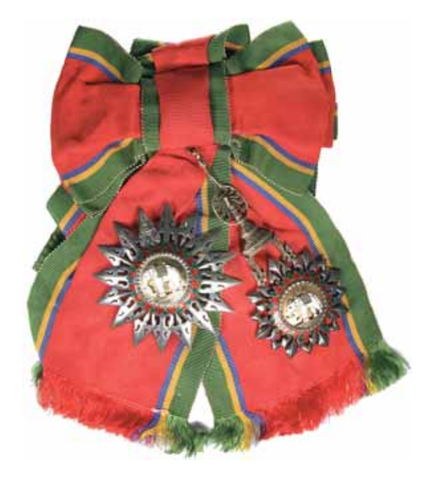
5322* Thailand, Order of the White Elephant, Knight Commander sash with badge and with breast star. Nearly extremely fine. (2)