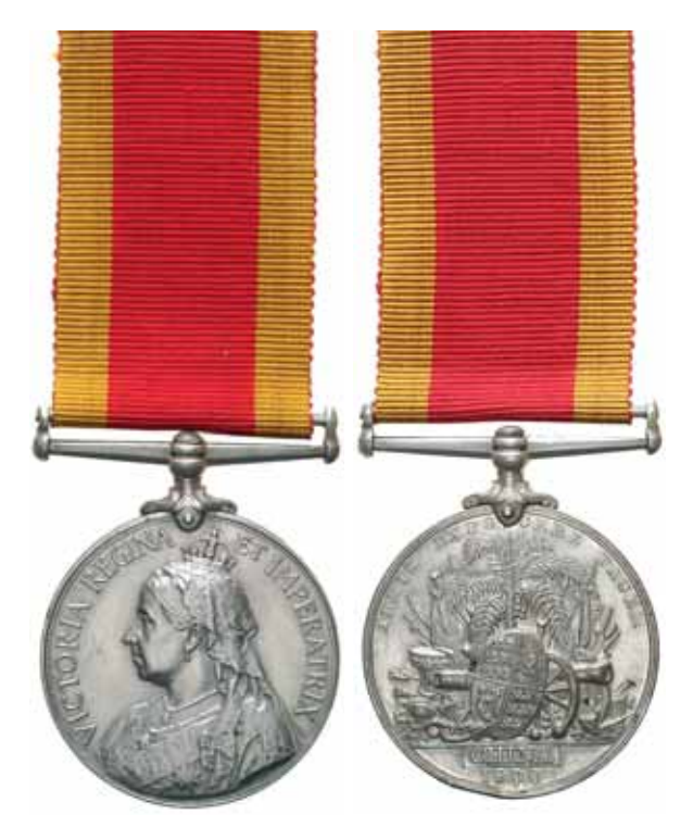
5149* China War Medal 1900. C.E.Holmes Boy., Victoria. Nav. Cont. Impressed. Mounted on black felt backing board, minor edge bump, otherwise extremely fine.