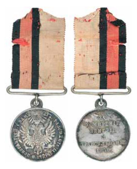
5312* Russia , Medal for Pacification of Hungary and Transylvania 1849. Ribbon faded, medal toned, very fine.