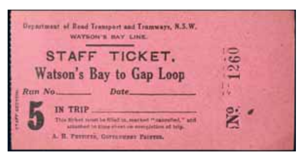
lot 2208 part