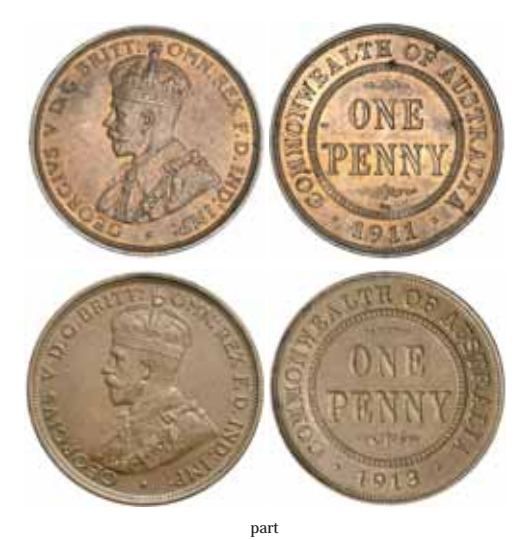
George V , 1911, 1912H and 1913. Nearly uncirculated; extremely fine; good extremely fine. (3)