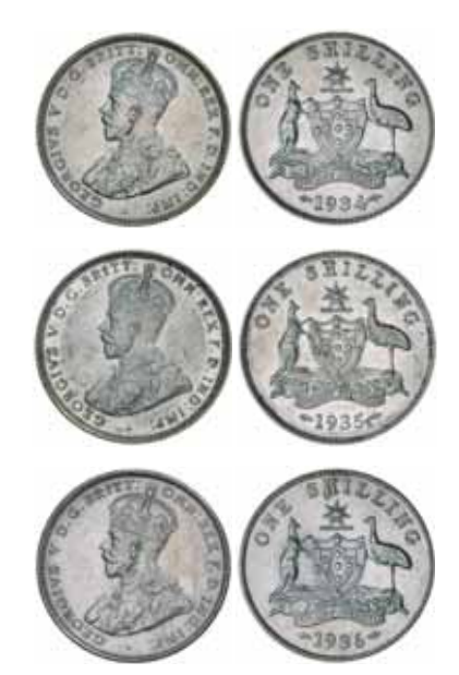
1075* George V, 1934, 1935 and 1936. Cleaned, otherwise good extremely fine - nearly uncirculated. (3) $200