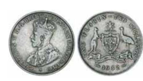
George V, 1932. Six pearls, nearly fine.