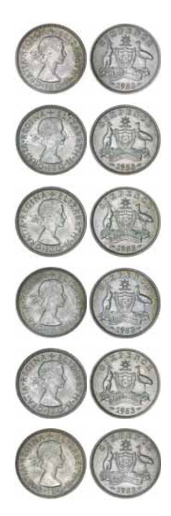
1091* Elizabeth II, 1953. Lightly toned, good extremely fine - nearly uncirculated. (6)