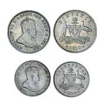
1080* Edward VII , 1910; also threepence, 1910. Toned, good extremely fine; nearly uncirculated. (2) $150