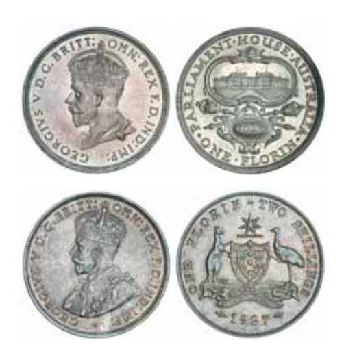
995* George V , 1927 Canberra. Extremely fine; toned uncirculated. (2)