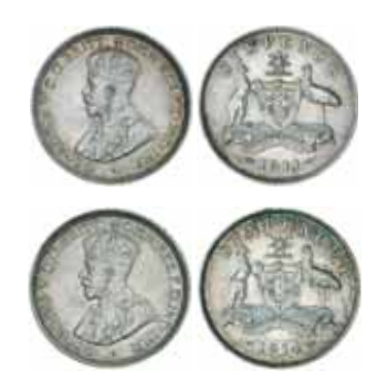
1082* George V , 1911. Good extremely fine. (2)

Ex S.J.Green Collection, Australian Coin Auctions Sale 310 (lot 1542), (lot 1560), (lot 1562), Pacific Rim 9 (lot 156) for last two.