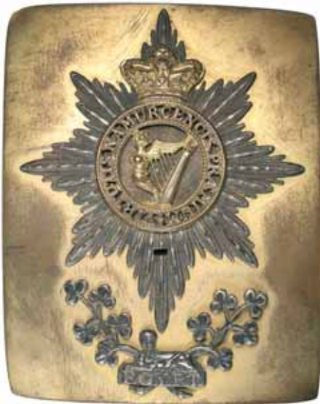
5095* Great Britain , 18th (Royal Irish) Regiment of Foot cross belt plate in brass (QVC). Good fine.