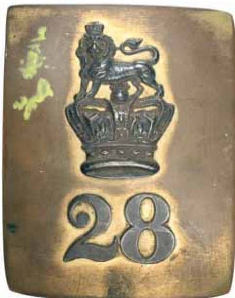
5096* Great Britain , 28th Regiment of Foot cross belt plate in brass (QVC). A few paint stains that are removable, good fine.