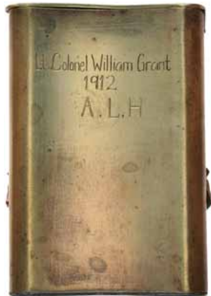
5098* Australian trench art cigarette case , made of brass (75x53mm), lift up top lid, with polished Rising Sun hat badge (KC) fitted to one side and on the other side is inscribed, 'Lt.Colonel William Grant/1912/A.L.H'. Polished, otherwise fine.