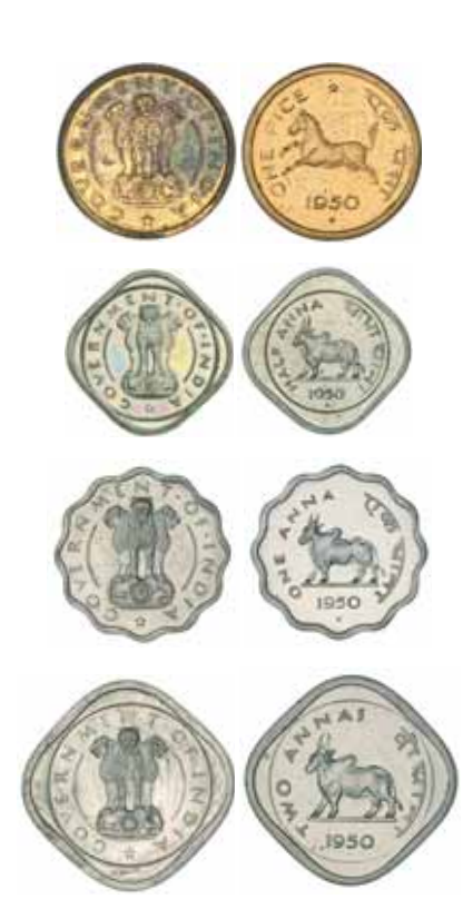
lot 3204 part

All slabbed by PCGS as AU58, AU55, MS62, MS62, AU58 respectively for Bombay and AU58 for Lahore mint.