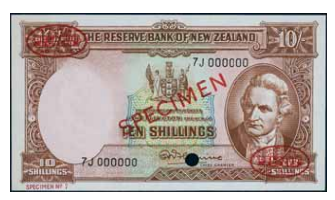
lot 3352 part