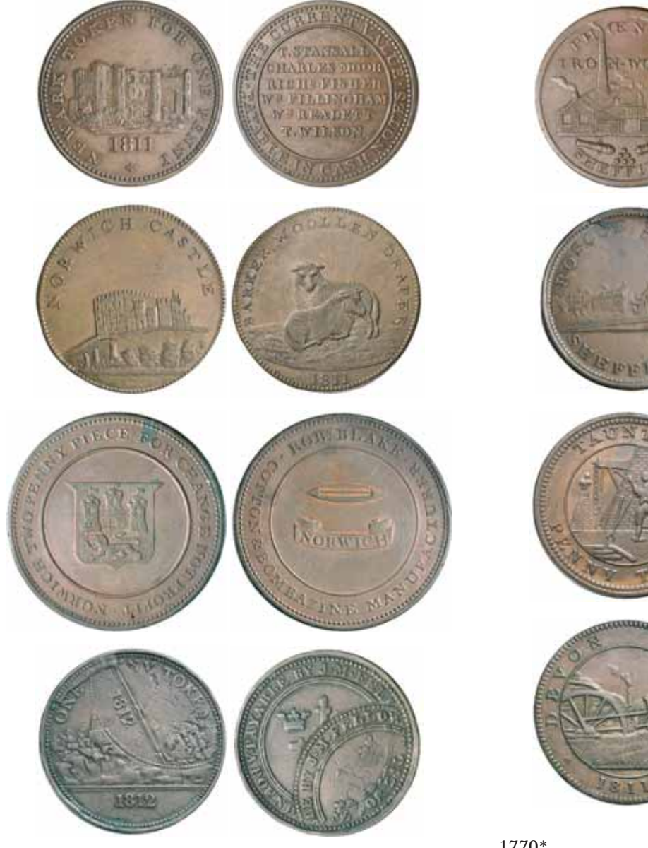
part 1769* Lye, (W.855); Malton (farthing W.865, 865a); Newark (W.880, 881); Newcastle (W.885, farthings, W.888, 889); Newcastle - under - Lyme (W.900); Norwich (W.905; two pence W.910 (ex W.J.Noble Collection Sale 74, lot 2191), halfpennies (W.914, 923, 929); Nottingham (W.940, 941, 941 mis-strike, 944); Redditch (W.960); Rugeley (W.966). Fine - extremely fine. (20)