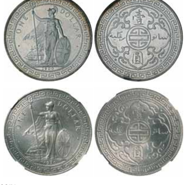
1925* British Trade Dollars, 1900B and 1930B (KM.T5). Uncirculated. (2) $300

British North Borneo , twenty five cents, 1929H (KM.6). Nearly uncirculated with original colour.