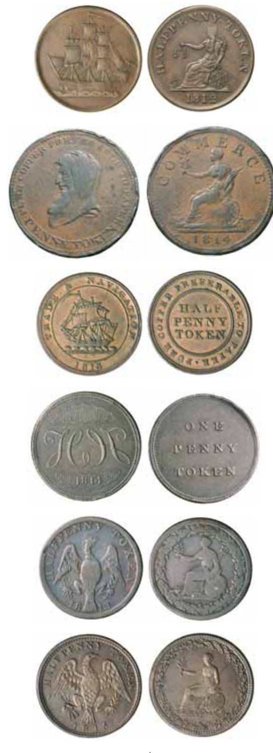
Non Local, Canada related, halfpennies W.1625, 1627; 1635 (Channel Islands), 1641, 1641 overstruck, 1648, halfpennies 1655, 1665, 1667, 1670, 1686, 1700 (penny), 1711, 1712, 1713, 1715. Very good - good very fine. (16)

Non local, Canada related (W.1393, halfpennies 1418, 1437, 1497a, 1501; 1505 (Cossack/Wellington) 1507, 1507 counterstamped Shepherd/Sheffield; halfpennies 1515, 1517, 1520-2, 1521, 1526, 1544, 1565, 1572, 1590, 1595, 1595 not overstruck, 1600, 1605 (farthing), 1616). Fine - extremely fine. (22) $400