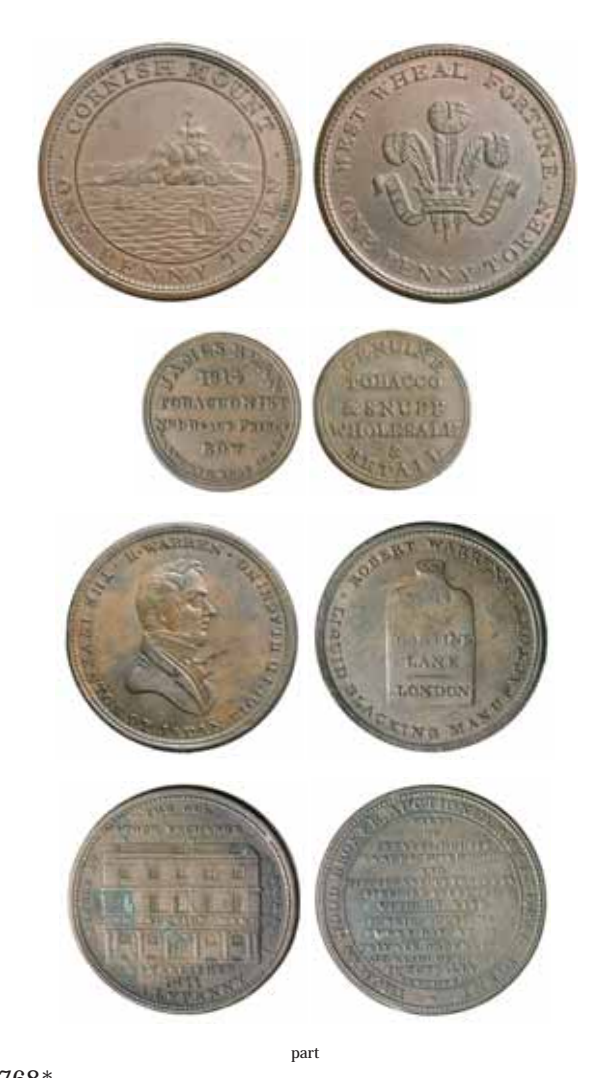
1768* Burslem , (W.638); Chatteris, farthings (W.660 upset and normal); Cheadle (W.667); Cheltenham (W.673); Dolcoath Mine (W.680); West Wheal Fortune Mine (W.696, 697); Redruth (W.701, also replica); Dudley (W.725, 728, 729, 736); Gates head (farthing W.742); Halesowen (W.748); Keighley (W.800, 805, 807); Leeds (farthing W.816); London (farthing W.827); halfpennies (W.837, 840, 845, 845a). Fine - extremely fine. (25)