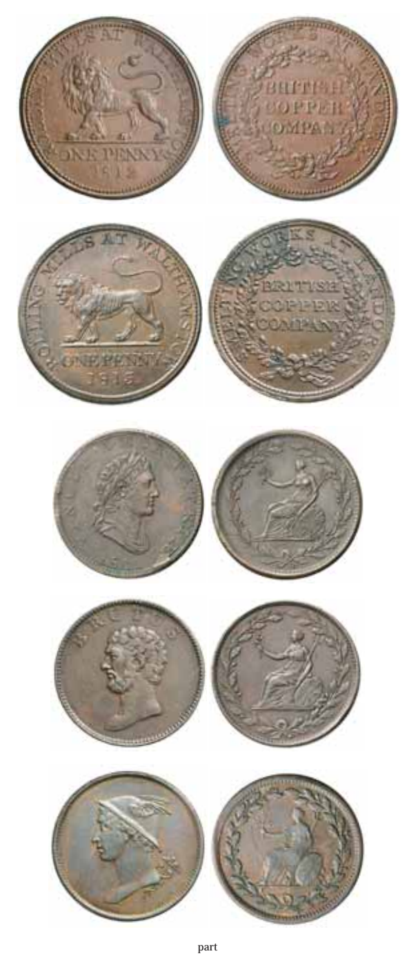
1767* British Copper Company , (W.560, 562, 563, 582, 586; halfpennies 591, 592 (2), 593, 599, 601, 605, 610, 612, 615, 618, 620a, 621, 622, 624, 630. Nearly extremely fine . (21)