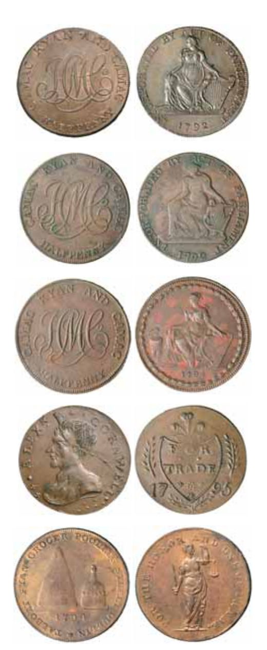
lot 1760 part