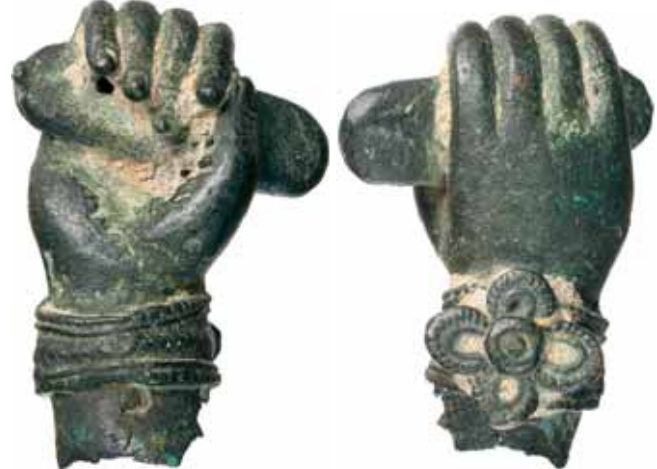
lot 1966 part