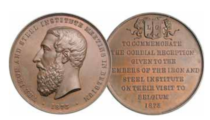
lot 1808 part