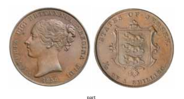
1787* Jersey, Queen Victoria, one thirteenth of a shilling, 1851, 1858 and 1861 (S.7001). Extremely fine or better. (3)