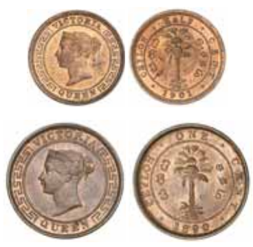
lot 1952 part

Ceylon, George IV, one rix dollar, 1821 (KM.84). Blue grey and iridescent toned, good very fine/extremely fine.