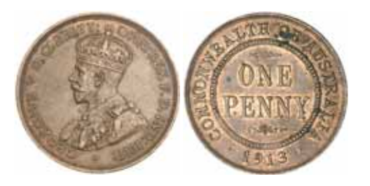
George V , 1912H. Brown and red, nearly uncirculated. $200