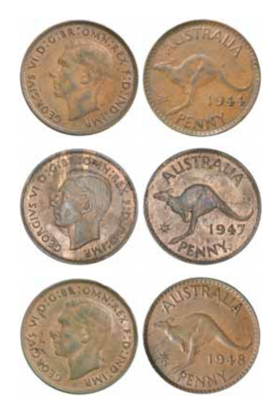
455* George VI, 1944, 1947Y and 1948Y. Considerable mint red on the second, extremely fine - nearly uncirculated. (3) $220

456 George VI, 1946. Fine - very fine. (7)