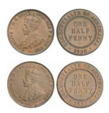
470* George V , 1930 and 1931. Toned, good extremely fine; extremely fine. (2)