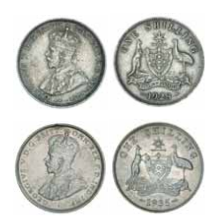
411* George V, 1928 and 1935. Toned very fine; good very fine. (2)