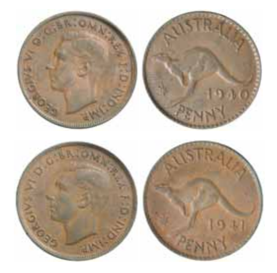
454* George VI, 1940 K dot G and 1941 K dot G. Dull toned, traces of red on the second, good extremely fine and rare. (2)