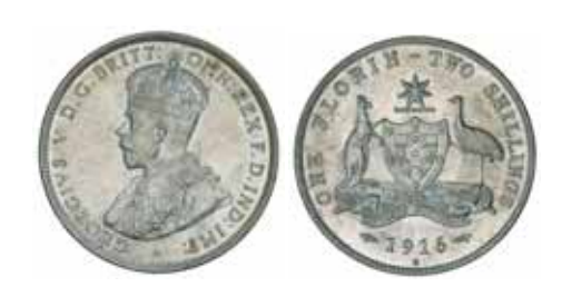
351* George V, 1916M. Uncirculated.