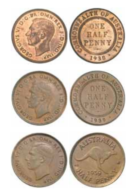
471* George VI, 1938, 1939 and 1939 kangaroo reverse. First mostly red uncirculated, others good extremely fine with traces of red. (3)