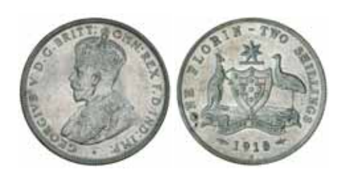
355* George V, 1918M. Minor contact marks, some original mint bloom, nearly uncirculated.