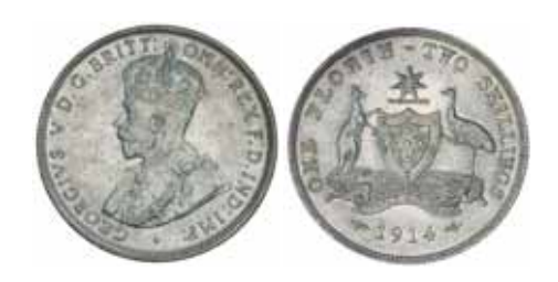
George V, 1914. Lightly toned, full subdued original mint bloom, uncirculated.