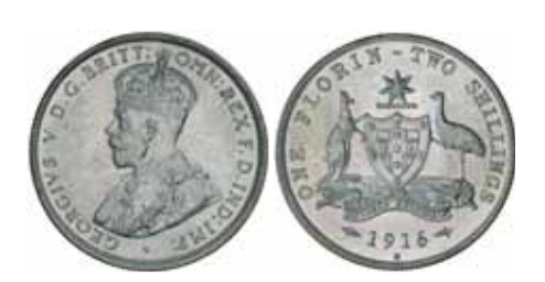
352* George V, 1916M. Considerable original mint bloom uncirculated/choice uncirculated.