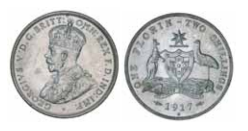
354* George V, 1917M. Full original mint bloom, nearly choice uncirculated.