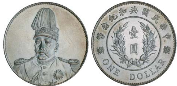
4534* China, Republic, general issue, silver dollar, not dated (1914), (26.89 g), obv. Yuan Shih-kai facing with plumed cap, and military uniform, rev. one dollar, founding of the Republic, (KM.Y.322, Kann 644). Brilliant and uncirculated and very rare in this condition.

Li Yuanj Hung was born in Huangpi, Hubei, October 19, 1864 and died at Tianjin, June 3, 1928. He was a Chinese general and politician during the Q'ing dynasty and the Republican era and was three times president of the Republic of China from 1912-1916 and 1922-1923.