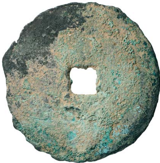
lot 4457 reverse

This extraordinary piece was part of a hoard found in 1972 found in Shensi Province China coming from the period of the Han Dynasty. In this hoard were found two lead ingots which are saucer shaped and on the concave side a circular inscription in barbarous Greek letters. This side also had stamped twice a punch containing Chinese letters. Others had also been found in several finds elsewhere in China including a find of thirteen ingots of similar weight to the above example. Another hoard was found in 1976 during building work at Lingtai county in Kansu province. Some 274 ingots were found including the above example. The idea of Greek inscriptions on coins suggest a source from North West India and Bactria. The abundance of examples found suggests a widely recognised object at that time.