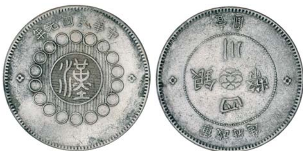
4576* China, Republic, Szechuen Province, silver dollar, undated (1912), 39.5mm, (25.52 g), obv. Chinese characters, 'Chung Hua Min Kuo Nien' rev. flower in centre, (KM.Y.456, Kann 775). Lightly toned, very fine.