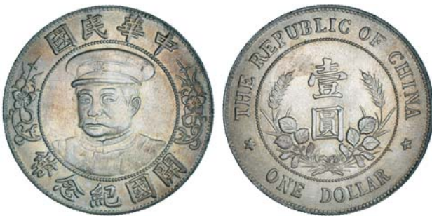
4531* China, Republic, general issue, silver dollar, not dated (c.1912), (26.63 g), obv. Li Yuan Hung facing with military cap, and military uniform, rev. ONE DOLLAR, (KM.Y.320, Kann 638a). Lightly toned, nearly uncirculated and very scarce.