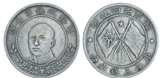
4579* China, Republic, Yunnan Province, silver fifty cents or half dollar, undated (1917), 33mm, (13.13g), obv. General T'ang Chi-yao facing, rev. crossed flags, circle in flag to left, (KM.Y.479.1, Kann 673). Toned, very fine.