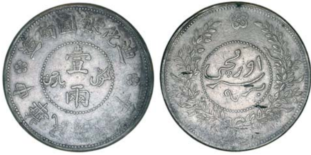
4574* China, Republic, Sinkiang, tael, Year 7 (1918) rosette at top between more ornate branches (KM.Y.45.2). Weakly struck at lower half, otherwise very fine.