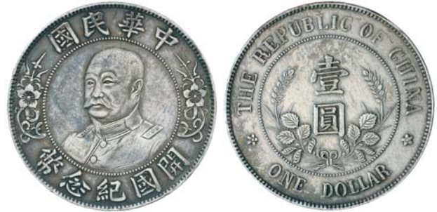
4533* China, Republic, general issue, silver dollar not dated but c.1912, 39.5mm, obv. Li Yuan Hung facing with bare head and military uniform, rev. One Dollar and Chinese characters for one yuan in centre with open wreath, (KM.Y.321, Kann 639 Ma 45). A little rubbed, otherwise extremely fine and scarce.