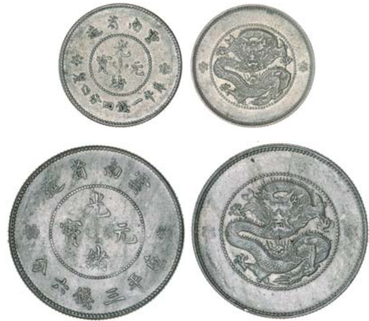
4577* China, Republic, Yunnan Province, silver twenty cents, undated (1911-1915) (KM.Y.256a); fifty cents, undated (1920-1931) (KM.Y.257.2). Extremely fine; good extremely fine. (2)