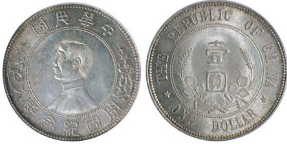
4530* China, Republic, General Issue, silver dollar, not dated (1912), obv. Sun Yat-sen to left, rev. One Dollar, The Republic of China, (KM.Y.319, Kann 603a). Toned, uncirculated. $2,500