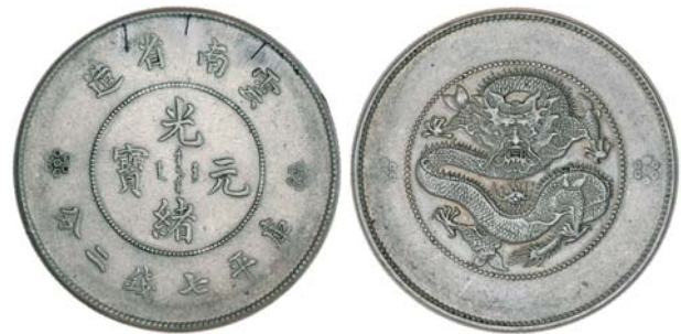
4578* China, Republic, Yunnan Province, silver dollar, undated (1920-22) (KM.Y.258.1). Three marks near rim on reverse, otherwise nearly extremely fine.