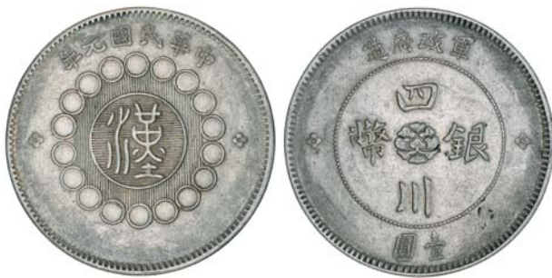
4575* China, Republic, Szechuen Province, silver dollar, undated (1912), 39.5mm, (26.07 g), obv. Chinese characters, 'Chung Hua Min Kuo Nien' rev. flower in centre, (KM.Y.456, Kann 775). Lightly toned, extremely fine.