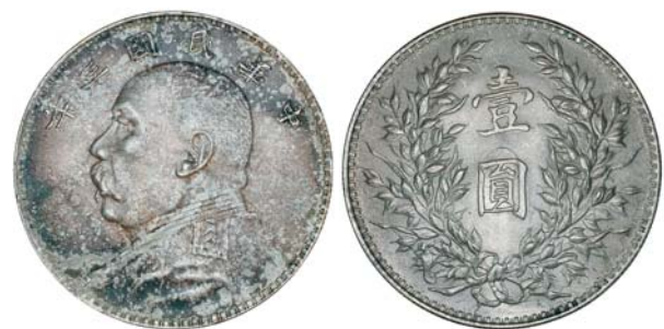
4535* China, Republic, Yuan Shih-kai, silver dollar or yuan, dated year 3 (1914), 39mm, (26.86 g), obv. Yuan Shih-kai bust to left, rev. "one yuan" within wreath of barley, (KM.Y.329, Kann 645). Uncirculated, obverse unevenly toned, reverse brilliant.