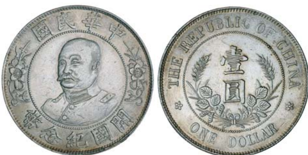
4532* China, Republic, general issue, silver dollar not dated but c.1912, 39.5mm, (27.17 g), obv. Li Yuan Hung facing with bare head and military uniform, rev. One Dollar and Chinese characters for one yuan in centre with open wreath, (KM.Y.321, Kann 639). Bright, minor surface marks, otherwise extremely fine and scarce.