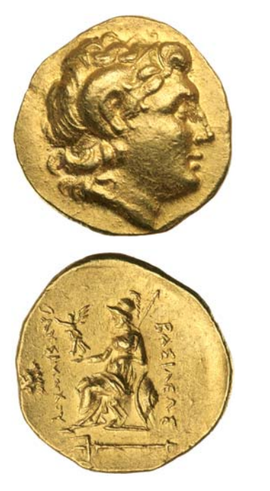
lot 4073 enlarged

Ex I.S. Wright, Sydney, Status Auction Sale 235, October 30, 2006 (lot 6080) and Terry Naughton Collection.