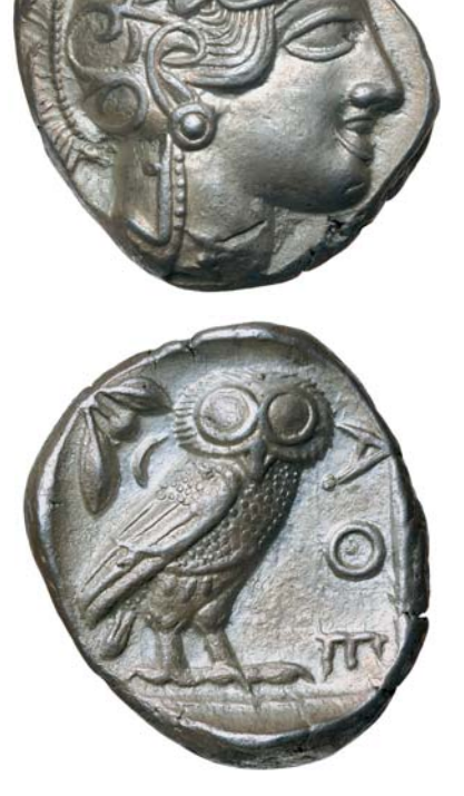
lot 4121 enlarged