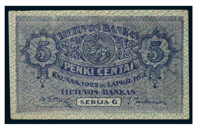
lot 3478 part