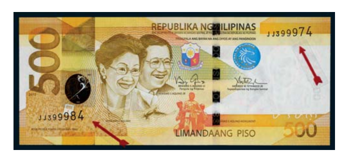
lot 3550 part