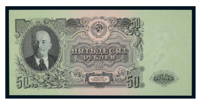
lot 3557 part