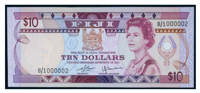
lot 3388 part