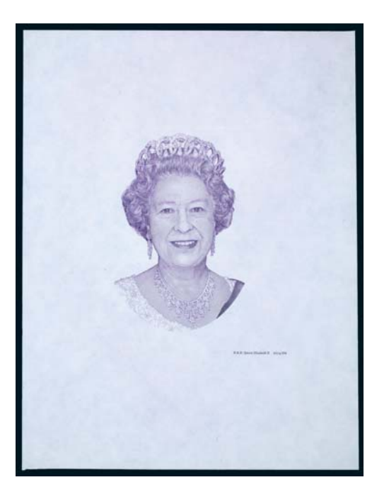
lot 3389 part