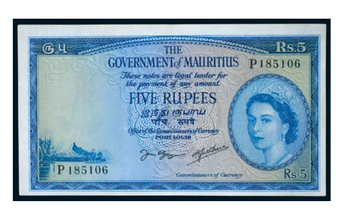
lot 3527 part