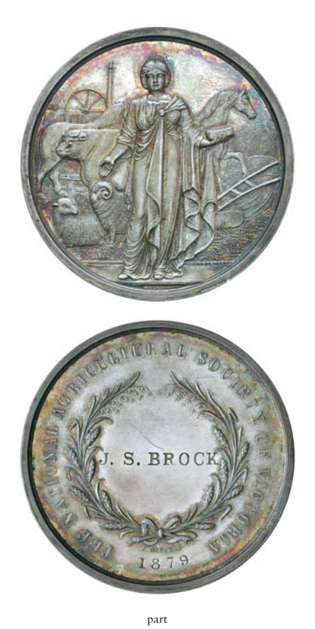
National Agricultural Society of Victoria, 1879, in silver (51mm) by J.Hogarth, inscribed on reverse 'J.S.Brock' and around edge 'First Prize Brittany Bull'; together with Great Britain, Queen Victoria, Jubilee head coinage, double florin, 1887, in a swivel mount by G.L.& Co, pin backed. Medal toned, nearly extremely fine, coin very fine. (2) $200