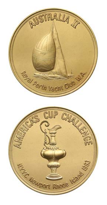
America's Cup Challenge, Australia II, 1983, struck in gold (9ct, 30.0g, 42mm), edge numbered 119 (C.1983/40). In case of issue, matt finish, uncirculated and very rare, unlisted in gold.