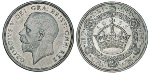
1832* George V, fourth coinage, wreath crown, 1933 (S.4036). Nearly very fine. $250