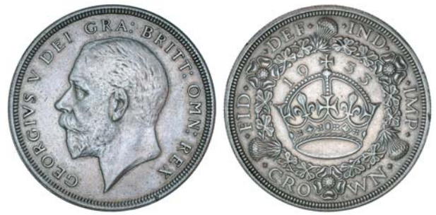
1831* George V, fourth coinage, wreath crown, 1933 (S.4036). Lightly toned, reverse rim nick, nearly extremely fine. $320