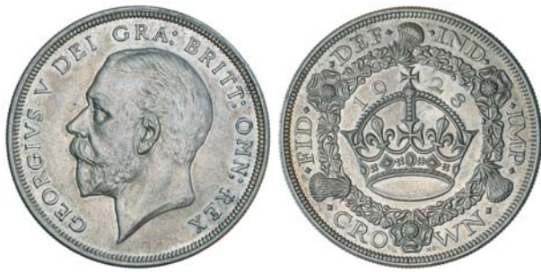
1828* George V, fourth coinage, wreath crown, 1928 (S.4036). Very fine. $250