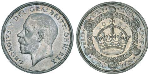
1830* George V, fourth coinage, wreath crown, 1931 (S.4036). Very fine. $300