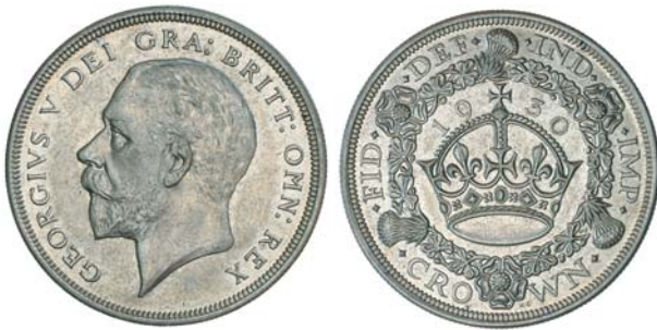
1829* George V, fourth coinage, wreath crown, 1930 (S.4036). Nearly very fine. $200