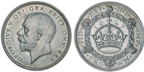
1827* George V, fourth coinage, proof, wreath crown, 1927 (S.4036). Extremely fine/good extremely fine. $300