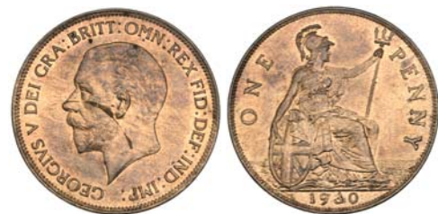
1836* George V, penny, 1930, (S.4055). Brilliant, about full mint red, usual minor surface handling scratches, otherwise uncirculated and very scarce. $150