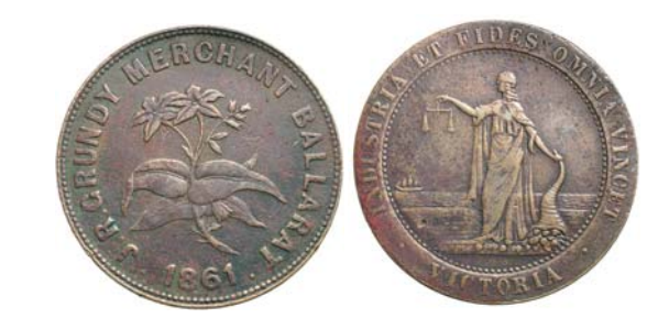
935* Grundy, J.R., Ballarat penny, 1861 (A.157). Fine.

Ex Noble Numismatics Sale 102 (lot 705) Ranald Hill Collection and Brian Bolton Collection.