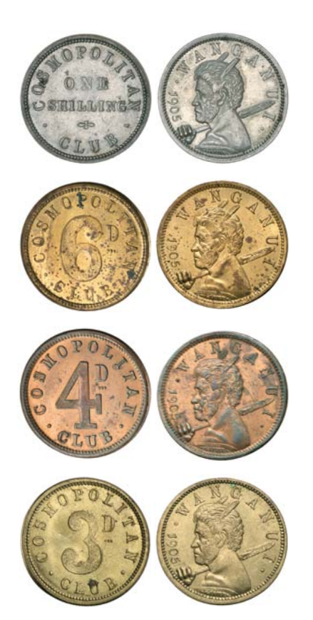
Cosmoplitan Club , Wanganui, 1905, set of tokens (24.5mm) for one shilling (cupro-nickel), 6D (light bronze), 4D (dark bronze) and 3D (brass), no makers (G.120-123; TMR.p500-507). Good extremely fine, the sixpence a little spotty. (4) $80