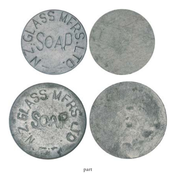
N.Z. Glass Mfrs, soap tokens, uniface, struck in aluminium (29mm) (2) and (33mm), no makers (G.50; TMR.p235-236). One of the 29mms holed and poor, the other two good very fine and illustrated. (3)