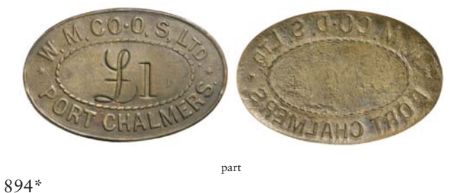
W.M.CO-O.S. Ltd, Port Chalmers, £1, uniface, struck in brass (38x25mm), no maker (G.111; TMR.p485) bracteate style. Very fine and rare, one illustrated. (2) $300

United Farmers' Co-Operative Association, discount tokens for 1/- struck in brass (28mm), 2/- struck in brass (29mm), 2/6 struck in brass (32mm), 5/- struck in brass (32mm), 10/struck in white metal (23.5mm), 20/- struck in white metal (31mm) and 40/- struck in white metal (32mm), no makers (G.104-110; TMR.p462-470). Very good - very fine. (7) $100