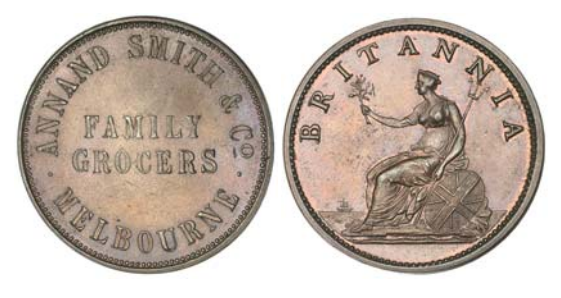
Annand Smith & Co., Melbourne penny, undated (1849) (A.18). Old scratch on obverse, light brown with traces of mint red, uncirculated and rare as such, one of the finest known.