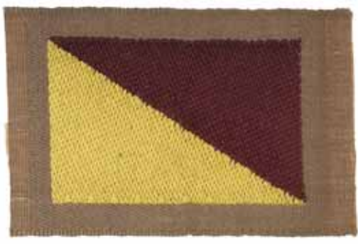
5241* Australia, WWI, 8th Australian Mobile Veterinary Section, pair of original opposing woven cloth colour patches. Condition as issued, rare.