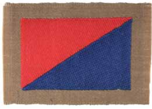
5240* Australia , WWI, 1st Australian Division Artillery, pair of original opposing woven cloth colour patches. Condition as issued, rare.