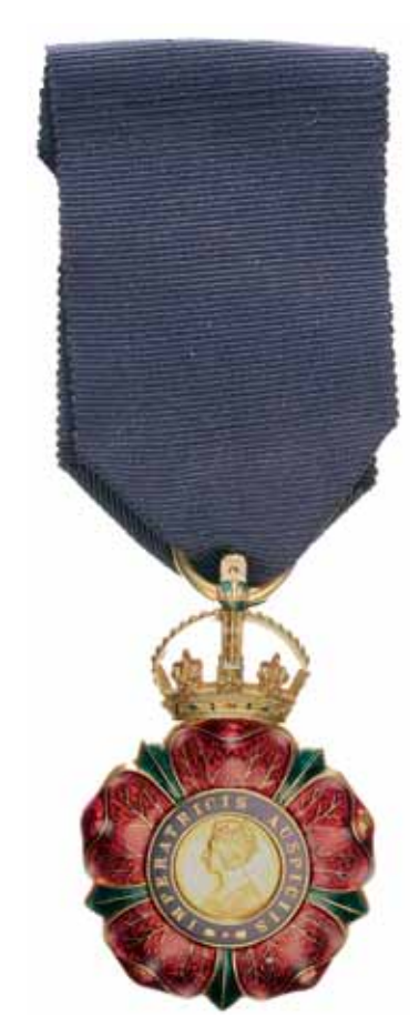
5118* The Most Eminent Order of the Indian Empire , Companion (CIE), breast badge. In Garrard & Co case, extremely fine. $1,200