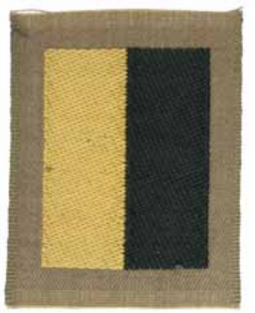
5238* Australia , WWI, 29th Battalion, pair of original opposing woven cloth colour patches. Condition as issued, rare.