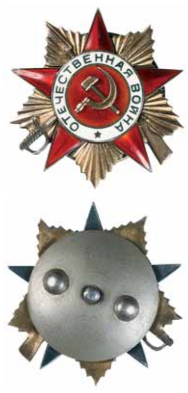
5211* Russia, USSR, Order of the Patriotic War First Class, numbered on reverse, 61249. Good very fine and an earlier issue.