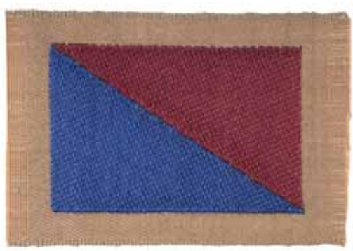
5242* Australia, WWI, 9th Australian Mobile Veterinary Section, pair of original opposing woven cloth colour patches. Condition as issued, rare.