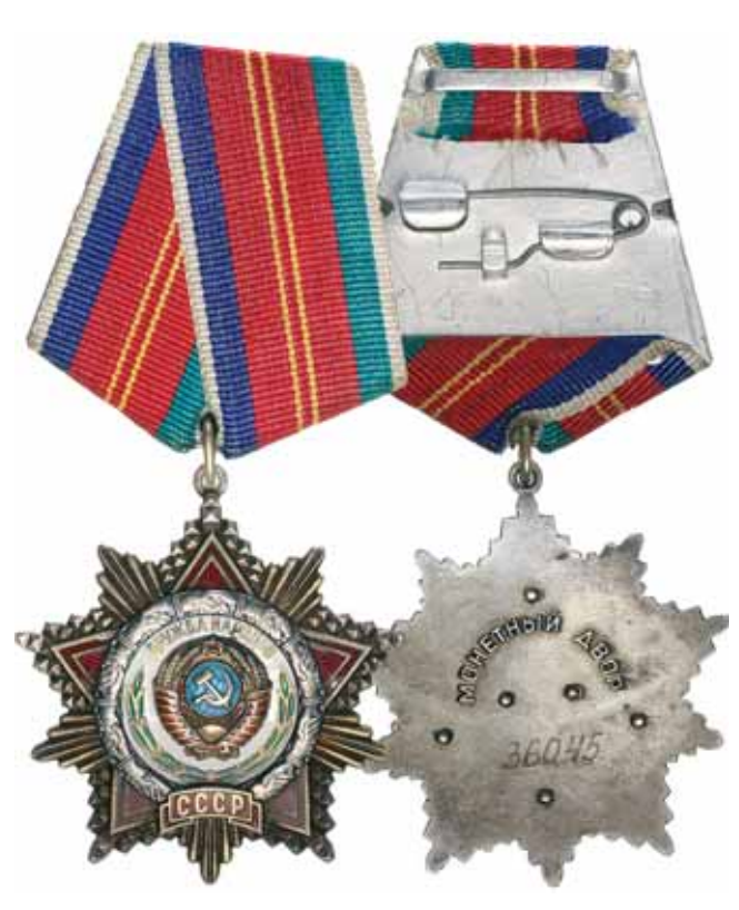
Russia, USSR, Order of Friendship of Peoples, numbered on reverse, 36045. Good very fine.

Russia, USSR, Order of Suvorov Third Class, numbered on reverse, 1547. A well made reproduction, good very fine.