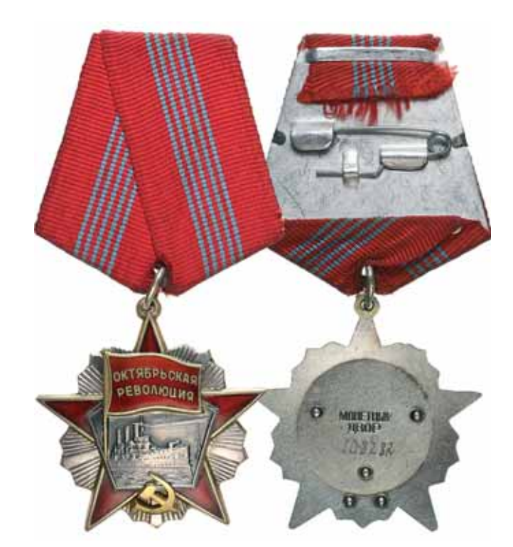
5214* Russia, USSR, Order of the October Revolution, numbered on reverse, 108282. Extremely fine. $250