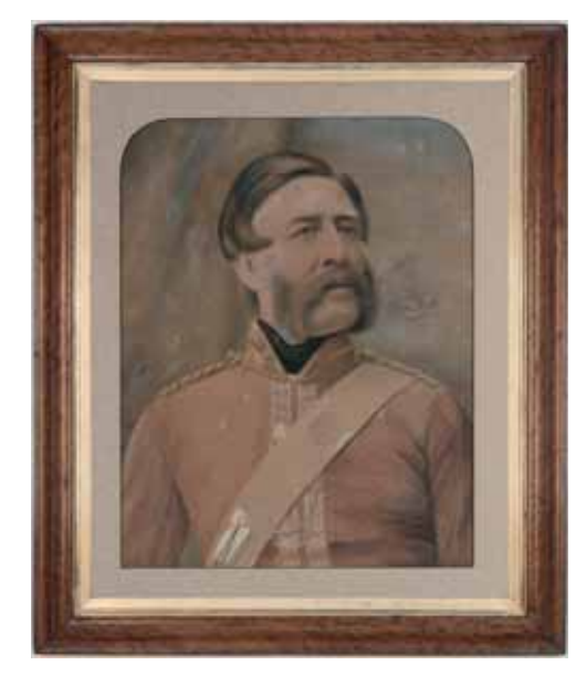
Henry Halloran c1860-65 (Portrait unattributed)