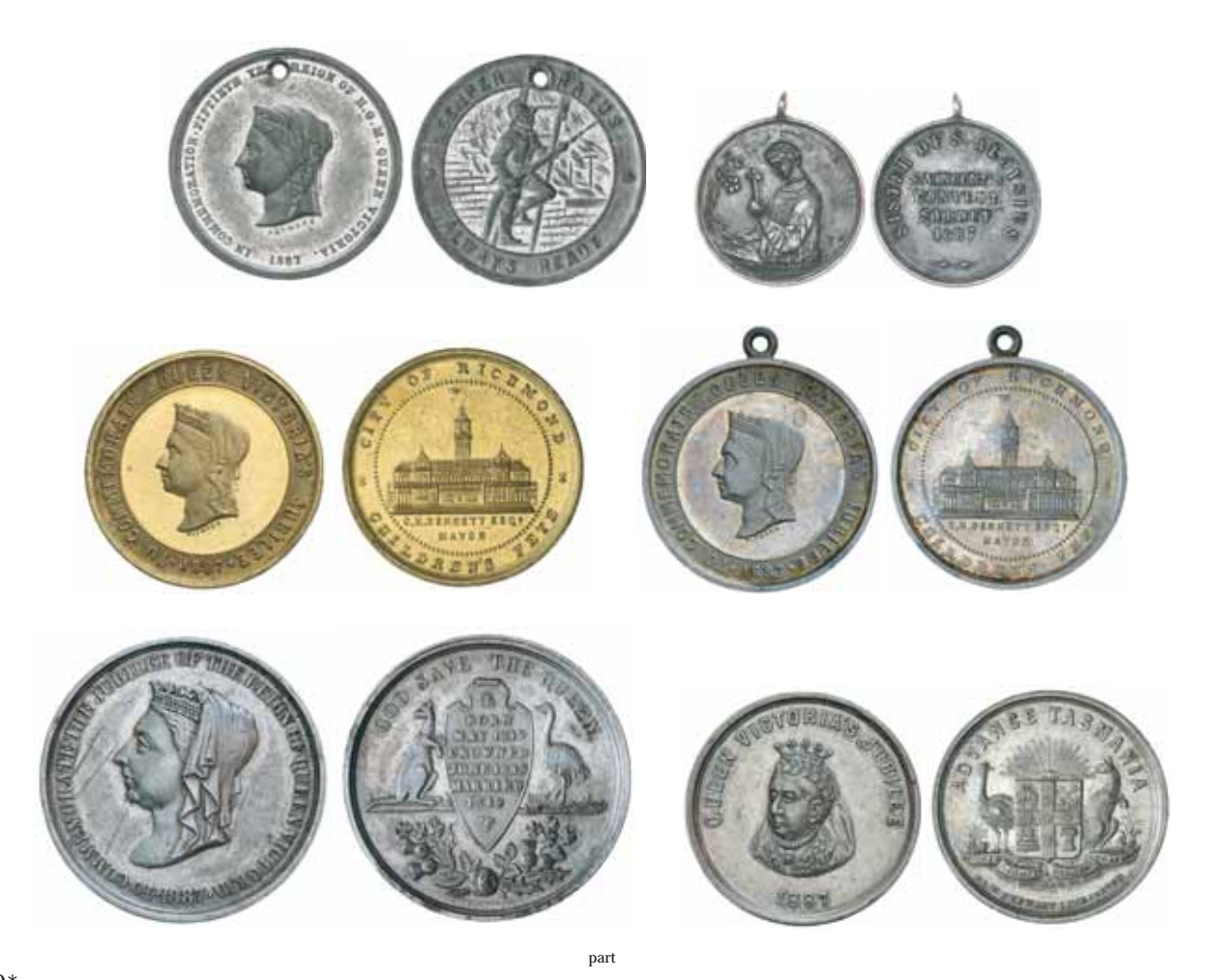
Medalets , as per Carlisle, 1886-7/1 (white metal); 1887/1 (two bronze, one 90 degree upset), 1a, 2 (bronze), 3 (gilt), 7a, 9, 10 (gilt), 12 (gilt), 13, 14 (silvered), 15, 18, 19 (brass, silvered and gilt), 20 (copper, gilt and silver), 22 (white metal, gilt and silver), 22a, 23, 23a, 24 (2 varieties), 24a, 26 (white metal and silver), 27 (silver). Very good - extremely fine . (32)