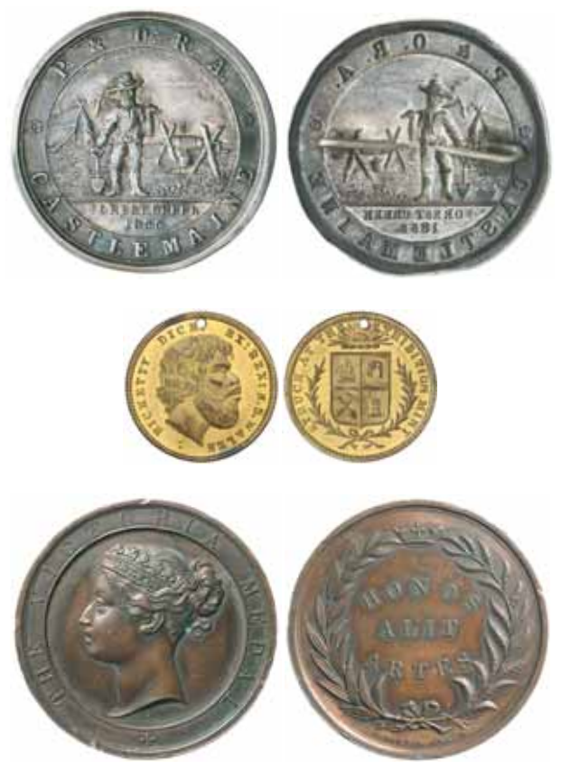
lot 3594 part

Medalets , as per Carlisle, the undated issues, A/1 (3, bronze, gilt and silver), A/3, A/6 (bronze), A/7 (silver), A/9 (gilt and bronze), A/10 (aluminium, gilt and silvered), A/14 (2), A/15 (silvered with pin), A/17, A/19, A/23, A/25, 6, 7; B/1, B/2 (gilt, brass and bronze), B/6 (nickel plated and brass); C/1 (silver), C/4 (bronze), C/5 (4, bronze (2 varieties), gilt and bronze with plain reverse), C/6, C/8 (brass and silvered), C/11, C/14, C/15; D/3 (gilt), D/4 (silvered); E/4, E/6 (bronze and silver), E/8, E/9, E/10 (gilt and silver), E/12; F/1 (silver), F/2 (3 varieties); G/1 (3, brass, gilt with ribbon on bar and silver), G/2 (bronze), G/5 (oxidisated silver), G/6, G/7, G/8, G/9, G/10, G/11, G/13 (bronze). The E/8 and G/6 rare, very good - uncirculated . (65) $900