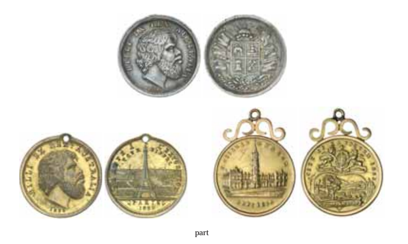
Medalets , as per Carlisle, 1888-9/1, 2 (gilt), 3, 5 (silver), 6 (holed and unholed), 7 (gilt), 8 (gilt); 1889/1a (silver), 1b, 3 (3, one with original ribbon); 1890/1 (white metal), 2 (gilt and gold ), 3 (aluminium and bronze (4)), 4 (gilt (3) and silver), 6, 7 (bronze, brass (2) and gilt), 7a. The gold issue very rare, very good - uncirculated . (31)