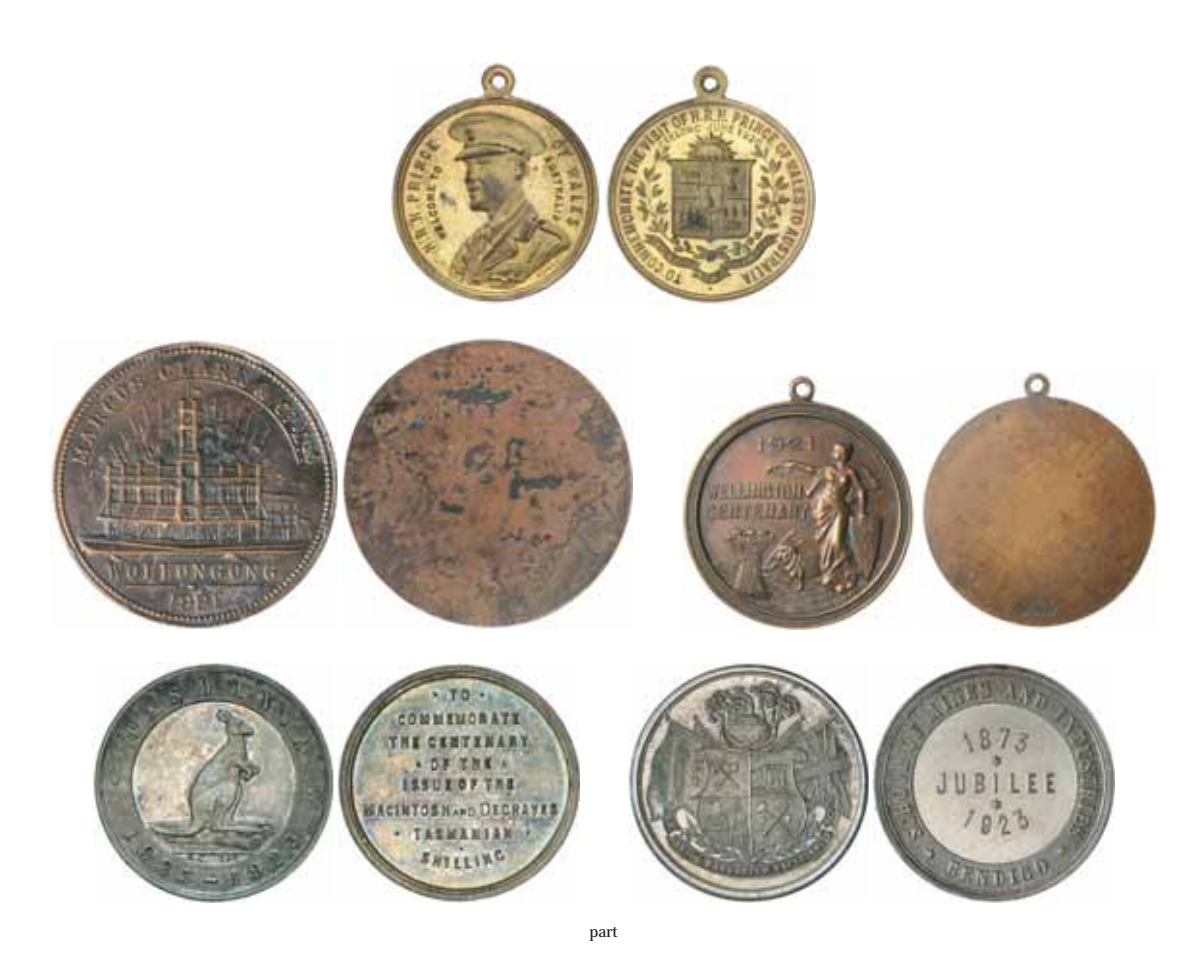
Medalets , as per Carlisle, 1920/2 (bronze), 3 (bronze, gilt and silvered), 4 (3, gilt and silvered (2)), 4a (gilt), 5 (6, bronze (2), gilt (2 varieties) and silvered (2)), 6 (gilt), 7 (silvered), 8 (2, silvered), 9 (brass and gilt), 10 (bronze), 11 (6, bronze and gilt (5 die varieties)), 12; 1921/1, 2 (2 varieties), 3 (brass and bronze), 4, 5 (2, gilt enamel and bronze), 6 (bronze); 1922/2 (gilt), 3 (gilt), 3a (3, bronze (2) and gilt), 3b (gilt), 3c (gilt), 3d (2, gilt), 3e, 5; 1923/1 (5, aluminium and white metal (4)), 2, 4, 5 (silvered and silver). The Macintosh and Degraves Centenary by Chitty rare, very good - uncirculated . (57)