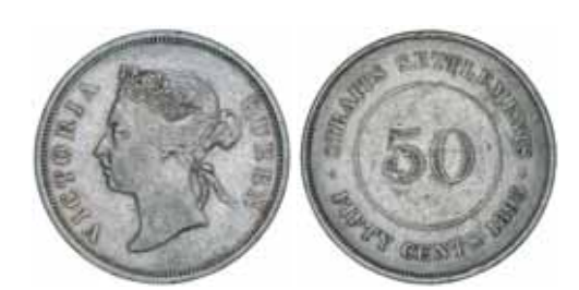
1778* Straits Settlements, Queen Victoria, fifty cents, 1893 (KM.13). Very fine.