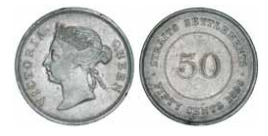
1780* Straits Settlements, Queeen Victoria, fifty cents, 1896 (KM.13). Nearly extremely fine. $250