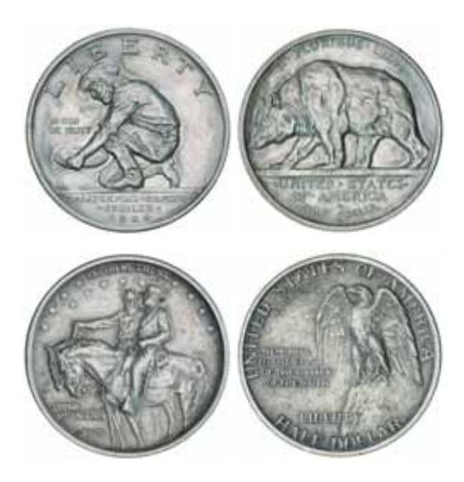
1841* USA, comemmorative half dollars, Californian Jubilee, 1925S; Stone Mountain, 1925. Nearly uncirculated; extremely fine. (2)

Ex Terry Naughton Collection, first ex Noble Numismatics Sale 87A, lot 3176, second ex Status Sale 250, 17/10/08, lot 9617.