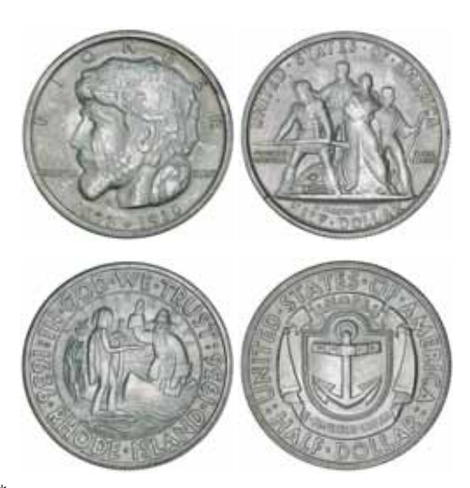
USA, commemorative half dollars, Elgin Illinois Centennial, 1936; Providence, Rhode Island Tercentenary, 1936. Uncirculated. (2) $300

Ex Terry Naughton Collection, from Status Sale 260, 23/10/09, lot 8082.