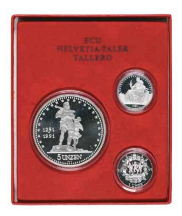
Switzerland, piedfort 999 fine silver set of three, includes five unzen (ounces) and one unze (2), 1991 700th Anniversary of Confederation. In case of issue, FDC. (set of 3)