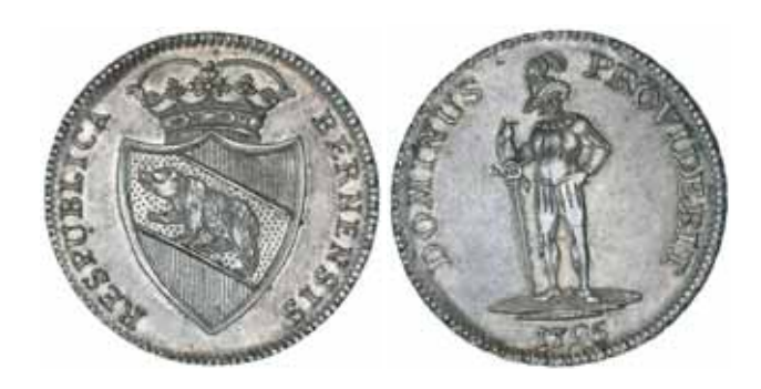
1809* Switzerland , Swiss Cantons, Bern, silver thaler, 1795 (KM.150). Toned, good very fine or better.

Ex Noble Numismatics Auction Sale 102 (lot 3816).