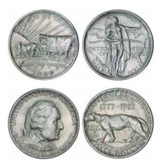
1842* USA, commemorative half dollars, Oregon Trail, 1926S; Vermont, Sesquicentennial, 1927. Nearly uncirculated. (2) $400

Ex Terry Naughton Collection, from Status Sale 250, 17/10/08, lot 9612.