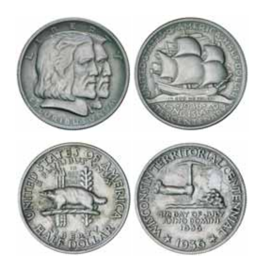
1850 USA , commemorative half dollars, Long Island Tercentenary, 1936; Wisconsin Territorial Centenary, 1936. Uncirculated; nearly uncirculated. (2)