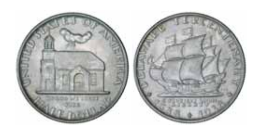
1848* USA, commemorative half dollar, Delaware Tercentenary, 1936. Uncirculated and scarce.

Ex Terry Naughton Collection, from Status Sale 250, 17/10/08, lot 9636.