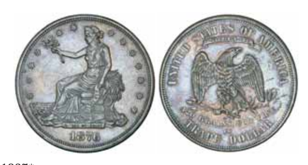
1827* USA, trade dollar, 1876CC. Extremely fine.