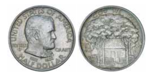
1840* USA, commemorative half dollar, Ulysses S.Grant, 1922, Grant Memorial. Lightly toned, uncirculated.

Ex Terry Naughton Collection, from Status Sale 271, 22/10/10, lot 8348.