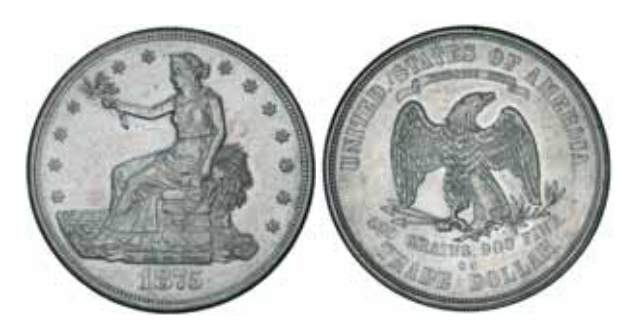
1826* USA , trade dollar, 1875CC. Extremely fine .