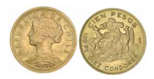
1934* Chile, one hundred pesos, 1970 (KM.175). Uncirculated. $900