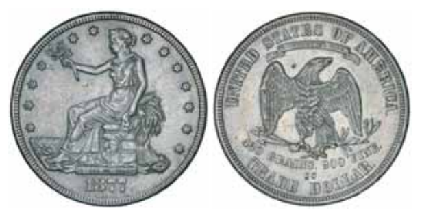
1829* USA , trade dollar, 1877CC. Extremely fine .

1830 USA, Morgan dollars, 1881O (2), 1885 (2), 1921; Peace dollars, 1922 (3), 1922S. Very fine - uncirculated. (9) $200