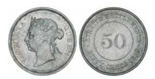
1782* Straits Settlements, Queen Victoria, fifty cents, 1899 (KM.13). A few scratches, otherwise nearly extremely fine. $250