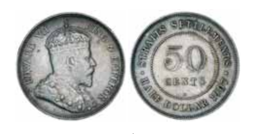
1791* Straits Settlements, Edward VII, fifty cents, 1907H (KM.24). Nearly extremely fine - extremely fine. (2)