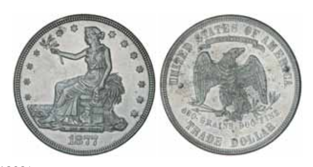
1828* USA , trade dollar, 1877. A few spots on reverse, otherwise uncirculated.