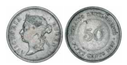
1781* Straits Settlements, Queen Victoria, fifty cents, 1897H (KM.13). Very fine.