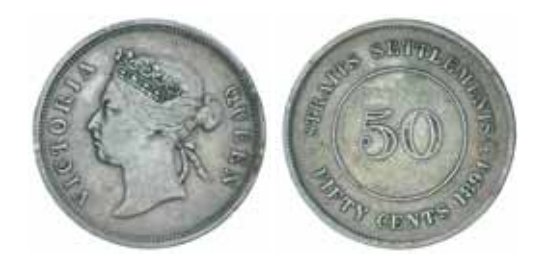
1779* Straits Settlements, Queen Victoria, fifty cents, 1894 (KM.13). Good fine .