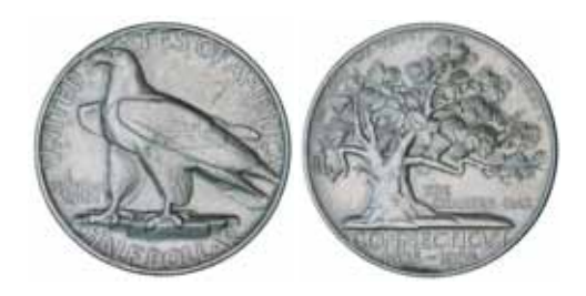
1844* USA, commemorative half dollar, Connecticut Tercentenary, 1935. Uncirculated.

Ex Terry Naughton Collection, first from Noble Numismatics Sale 87A (lot 3183), second from Status Sale 271, 22/10/10, lot 8373.