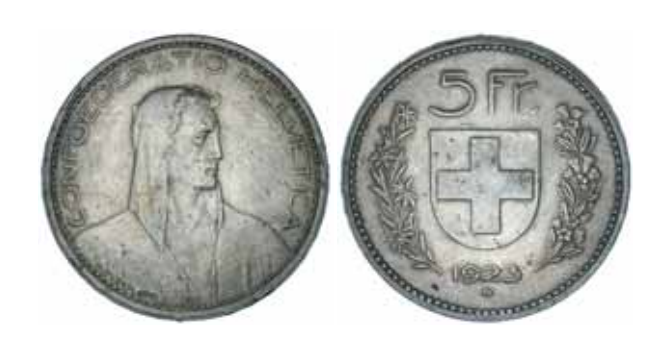
1811* Switzerland , five francs, 1923B (KM.37). Extremely fine. $100

Ex Spink Australia Sale 15 (lot 2667, the Alan Whiting Collection).