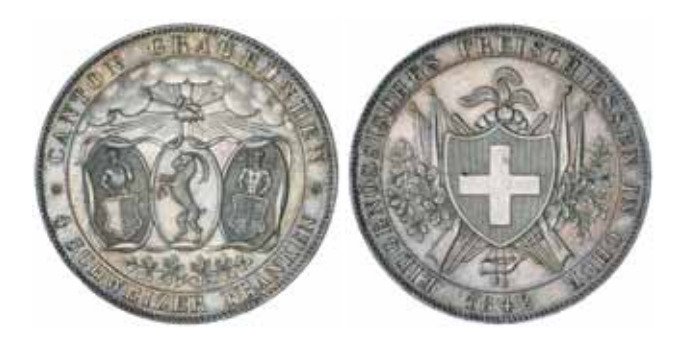
1810* Switzerland, shooting thaler, Graubunden, four franks, 1842 (KM.17). Toned, nearly uncirculated and scarce. $1,500

Ex Noble Numismatics Auction Sale 102 (lot 3816).