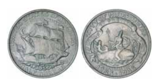
1845* USA , commemorative half dollar, 1935, City of Hudson, N.Y., Sesquicentenary. Uncirculated and rare . $950

Ex Terry Naughton Collection, from Status Sale 301, 24/10/13, lot 7827.