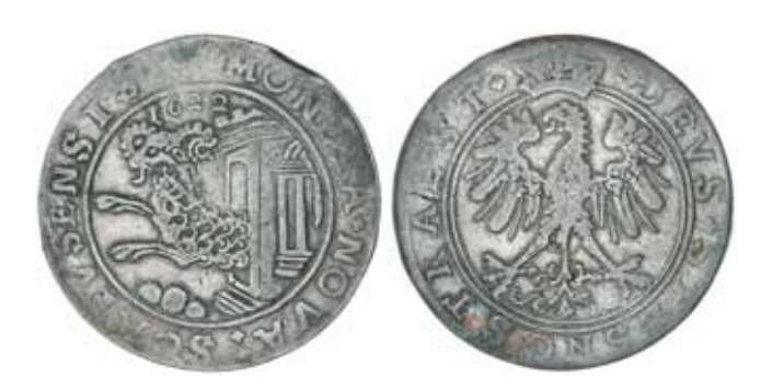
1808* Switzerland, Schaffhausen, thaler, 1622 (KM.25). Fine. $200