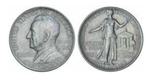
1851* USA, commemorative half dollar, Lynchburg, Virginia Sesquicentenary, 1936. Uncirculated .

Ex Terry Naughton Collection, from Status Sale 271, 22/10/10, lots 8394, 8401