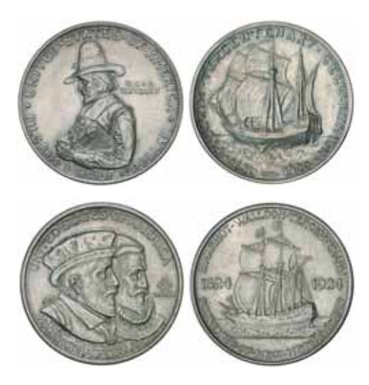
1838* USA , commemorative half dollars, Pilgrim Tercentenary, 1920, Mayflower; Huguenot-Walloon Tercentenary, 1924, Nieuw Nederland. Nearly uncirculated. (2)

Ex Terry Naughton Collection, from Status Sale 260, 23/10/09, lot 8062.