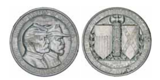
1847* USA , commemorative half dollar, Battle of Gettysburg, 75th Anniversary, 1936. Slight adhesion on edge, uncirculated and scarce.

Ex Terry Naughton Collection, from Status Sale 301, 24/10/13, lot 7832.