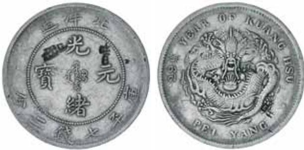
3989* China , Empire, Chihli Province, silver dollar, Pei Yang type, year 29 (1903), (KM.Y.73.1, Kann 205). With two additional chopmarks on obverse lightly toned, otherwise, good fine.