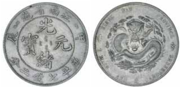
3993* China , Empire, Kiang Nan, silver dollar (1904), 39.5mm, (26.47 g), rev. dragon, (KM.Y.145a.12, Kann 99). Very fine.