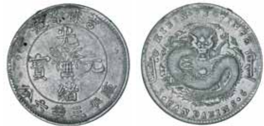
3994* China , Empire, Kirin Province, silver half dollar, (1896-1898), 33mm, (13.04 g), (KM.Y.182, Kann 304). Cleaned, good very fine, scarce.