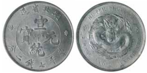
3992* China , Empire, Hupeh Province, Hsuan T'ung, silver dollar; not dated (issued 1909-1911), rev. facing dragon, (KM. Y.131, Kann 45). Nearly uncirculated with mint bloom.