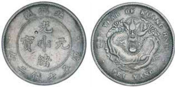
3988* China , Empire, Chihli Province, 25th year of Kuang Hsu silver dollar (1899) (KM.Y.73). Sun chop mark on the obverse, nearly very fine.