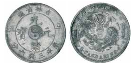
3995* China , Empire, Kirin Province, silver half dollar, (1901), 33mm, (12.70 g), (KM.Y.182a.1, Kann 427). Cleaned, good very fine, scarce.