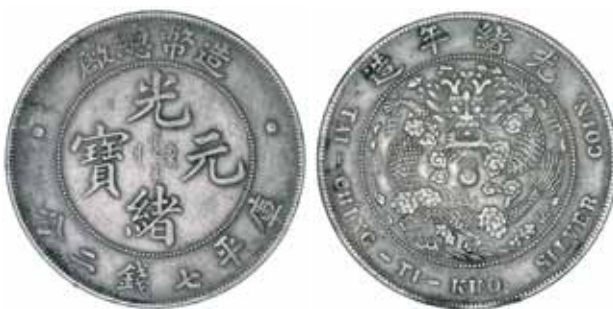
3990* China , Empire, Kuang-hsu, one dollar, undated (1908) (KM. Y.14). Very fine.