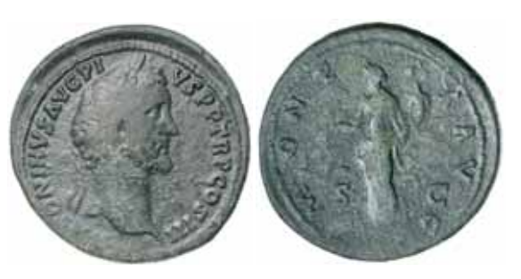
lot 3590 part

Ex Noble Numismatics Sale 74 (lot 4935).