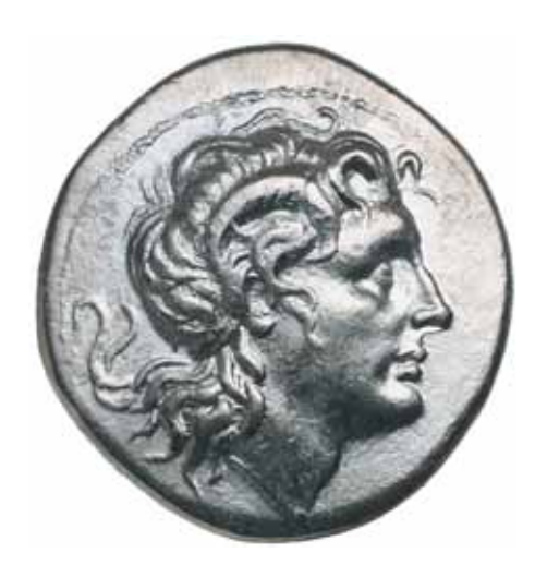
lot 3619 (Enlargement)

Ex Noble Numismatics Sale 107 (lot 3245) for the first coin.