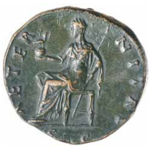
lot 3498 (Enlarged)