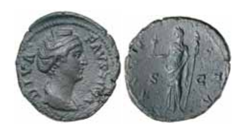
Ex A.K. Collection.