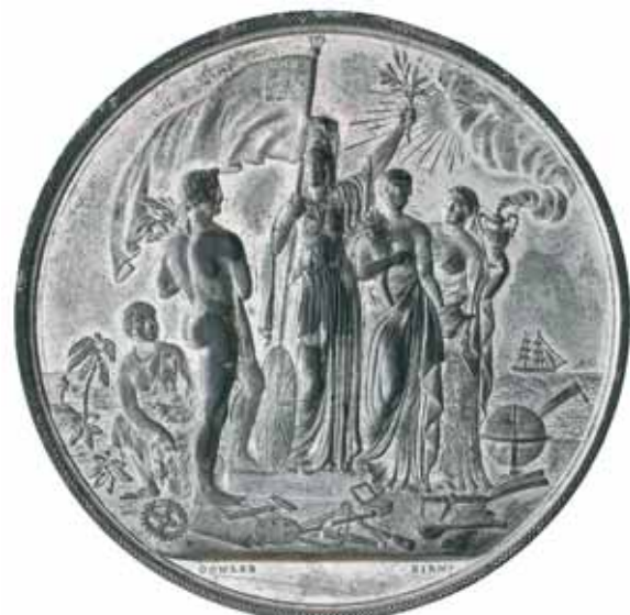
2185* International Exhibition, London, 1862 , in white metal (76mm) by Ottley, obverse, view of exhibition buildings, angel flying above, inscription above and below, reverse, Britannia standing, amid symbols of industry, art, thrift and transportation. Some discolouration in fields, edge knock at 12 o'clock, very fine and rare.