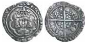
1987* Henry VII , (1485-1509), facing bust, half groat, Canterbury, mm tun (1498-9) (S.2211). Chipped, otherwise nearly very fine.