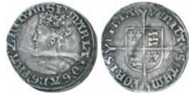
1989* Mary , (1553-1554), groat, mm pomegranate (S.2492). Creased and straightened, otherwise toned, good fine with good portrait.