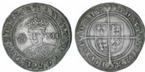
1988* Edward VI , (1547-1553), fine coinage, shilling, mm tun (1551-3) (S.2482). Lightly toned, flan crazed on portrait, otherwise very fine or better.