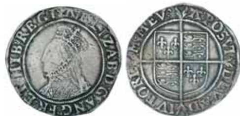
1992* Elizabeth I , (1558-1603), sixth issue, shilling, mm A (1582-4) (S.2577). Fine/good fine.