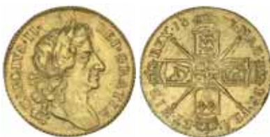
2221* Charles II , fourth bust, guinea, 1677 (S.3344). Peripheral die break top of reverse, horizontal scrape ear to O, otherwise nearly extremely fine and rare.