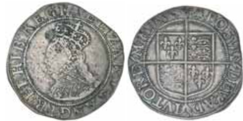
1991* Elizabeth I , (1558-1603), sixth issue, 1582-1600, shilling, mm bell, 1582-3 (S.2577). Toned, nearly fine/good very fine.