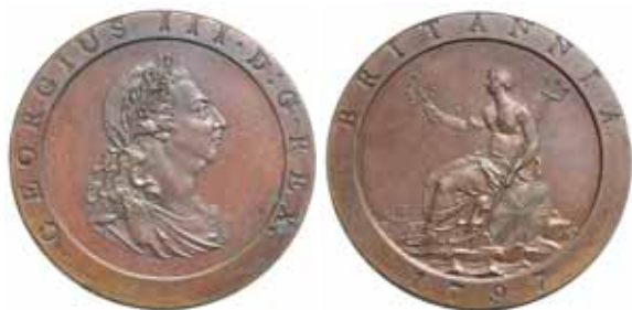
2042* George III , bronzed proof cartwheel penny, 1797 (S.3777; BMC.1188). Nearly FDC and rare.