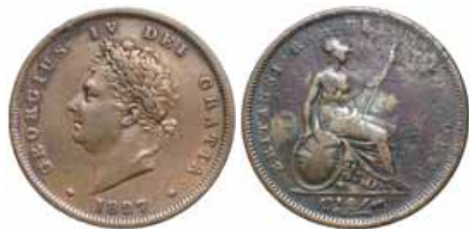
2063* George IV , copper penny, 1827 (S.3823). Some pitting on the reverse, re-toned after cleaning. Obverse brown, good very fine, reverse dark tone, nearly very fine, the date very rare.