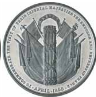
lot 2158 part