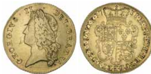
2223* George II , young head, two guineas, 1738 (S.3667B). Mark near King's forehead, otherwise good fine/very fine.