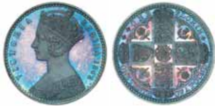
2073* Queen Victoria , pattern Godless florin, 1848, plain edge (S.3890; ESC.2917). Deep iridescence, hairlines in obverse field, otherwise nearly FDC and rare.