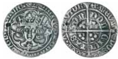
1986* Henry VII , (1485-1509), facing bust, groat, I, rose on breast, London, mm halved sun and rose, 1485-7 (S.2193). Has been mounted or holed and repaired, otherwise good fine.