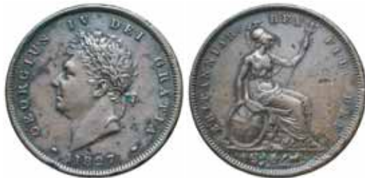
2062* George IV , copper penny, 1827 (S.3823). Dark brown patina, some isolated pitting and rim knock, otherwise relatively unworn, nearly extremely fine and very rare.