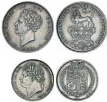
2061* George IV , bare head, shilling, 1826, laureate head sixpence, 1825 (S.3812, 3814). Toned, extremely fine. (2)