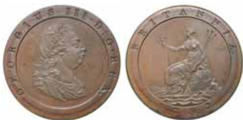
2043* George III , bronzed pattern cartwheel halfpenny, 1797 (BMC.1153). Nearly FDC and rare.