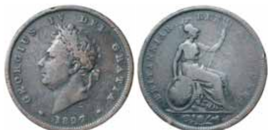
2064* George IV , copper penny, 1827 (S.3823). Dark tone, nearly very fine and rare.