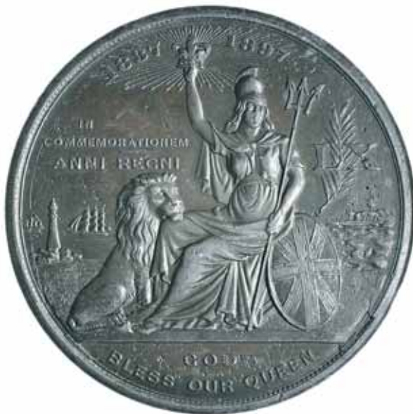
lot 2204 part