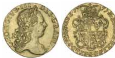
2225* George III , guinea, third bust, 1771 (S.3727). Good very fine.