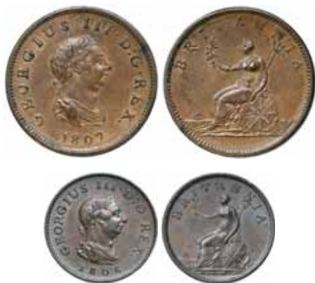
2045* George III , fourth issue, copper halfpenny, 1807, and farthing, 1806 (S.3781, 2). Extremely fine; good extremely fine. (2)

Ex Glendings Sale 24 Feb 1982 (lot 146 part) and Herman Selig Collection, Spink Sale 31 (3 March 1999, lot 1425).