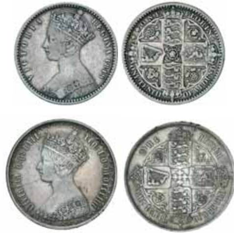
2075* Queen Victoria , Godless florin, 1849, Gothic florin, 1853 (S.3890, 3891). Good fine; scratches on obverse, very fine. (2)