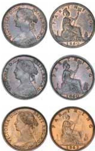
lot 2086 part