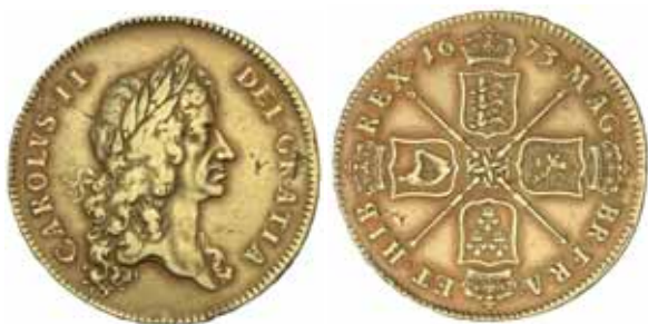
2220* Charles II , five guineas, 1673 (S.3328). Signs of old mounting at 3 and 10 o'clock on the edge, a little rubbed of old tone, nearly very fine and rare.