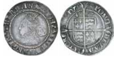
1990* Elizabeth I , (1558-1603), third and fourth issue, sixpence, 1567, mm coronet (S.2562). Nearly very fine.