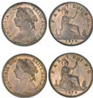
lot 2090 part