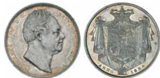
2067* William IV , halfcrown, 1834 (S.3834). Nearly extremely fine.

Most of this small mintage was shipped to Tasmania.