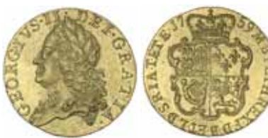
2224* George II , old head guinea, 1759 (S.3680). Nearly uncirculated and rare in this condition.