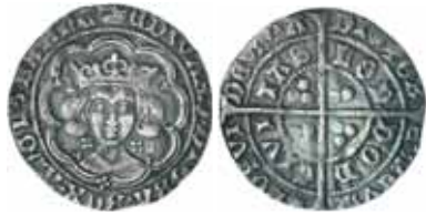
1985* Edward IV , (first reign, 1461-1470), light coinage, groat, London, mm crown/sun, 1467-8 (S.2000). Nearly very fine.