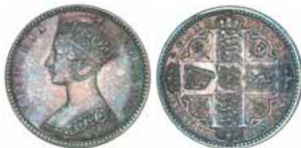
2074* Queen Victoria , Godless florin, 1849 (S.3890). Toned, uncirculated and rare as such.