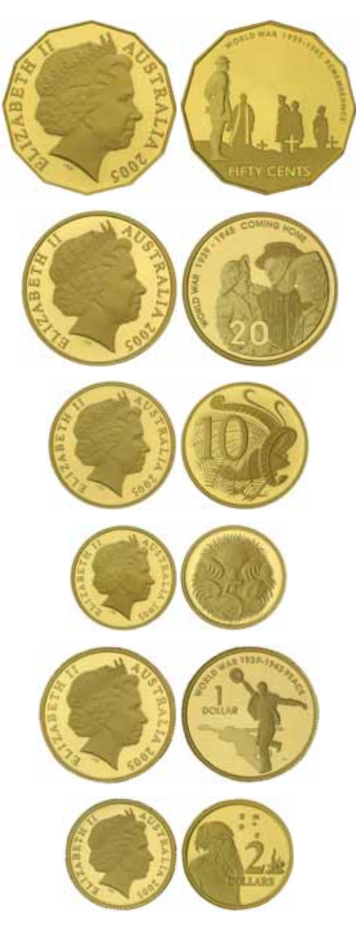
Elizabeth II, proof gold six coin set, 2005. In case of issue with certificate 096, FDC.