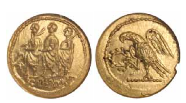
lot 4408 (2x)

Ex Decades Collection and Heritage USA, September Long Beach Sale 419 (lot 51039) with their ticket.