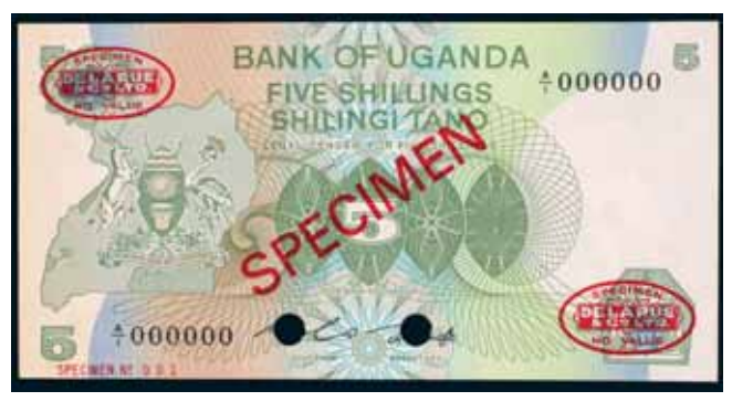
lot 3578 part

Uganda , Bank of Uganda, de la Rue specimens, all undated (1982), five shillings, A/1 000000 (P.15s); ten shillings, A/1 000000 (P.16s); twenty shillings, B/1 000000 (P.17s); fifty shillings, C/1 000000 (P.18as); one hundred shillings, D/1 000000 (P.19as), printed in red at left bottom front edge 'SPECIMEN No 001' on all, 'Specimen DE LA RUE & CO LTD No Value' oval stamp on two diagonal corners front and back on all and SPECIMEN diagonally front and back on all, all these in red, each punch cancelled on two signatures. Remnants of glue marks on right hand edges of backs, otherwise uncirculated. (5)