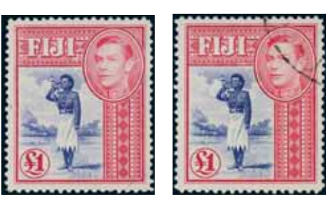
lot 3106 part