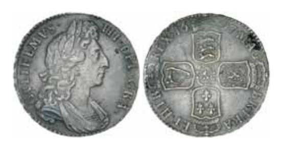
1545* William III, halfcrown, first bust, 1697 nono (S.3487). Dull matte tone, slight adhesion, nearly extremely fine. $500