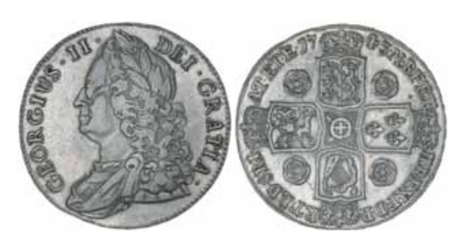
1574* George II , old head, crown, 1743 roses, dvoseptimo (S.3688). Silver grey tone, very fine/good very fine.