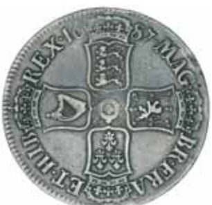
1531* James II , crown, second bust, 1687 tertio (S.3407). Fine/toned good fine. $350

Ex Noble Numismatics Sale 78 (lot 2169).