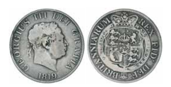
1610* George III , new coinage, halfcrown, small head, 1819/8 overdate (S.3789). Toned, nearly fine and extremely rare. $250

Ex Fulton Collection with A.H.Baldwin envelope.