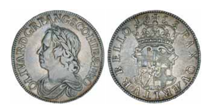
1514* Oliver Cromwell , crown, 1658/7 (S.3226). Has been cleaned, otherwise good surfaces, very fine and rare.

The first two ex IAG (lot 199, 243), and Monetarium, the third from