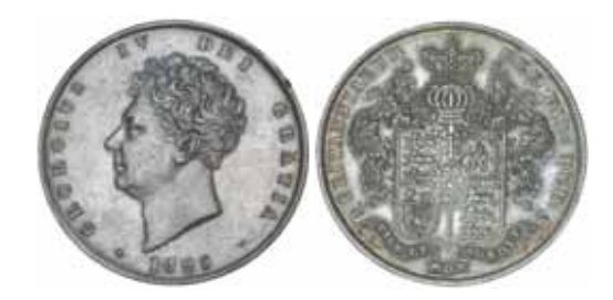
1620* George IV , halfcrown, bare head, 1825 (S.3809). Grey tone with underlying mint bloom, nearly uncirculated.