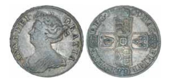
1557* Anne, after the Union, halfcrown, 1709 octavo (S.3064). Toned with underlying mint bloom in places, good very fine/extremely fine.