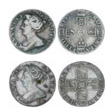
1555* Anne, sixpences, before the Union, 1705 plain (S.3591); after the Union, 1708E* (S.3621). Fine; good very fine. (2) $150