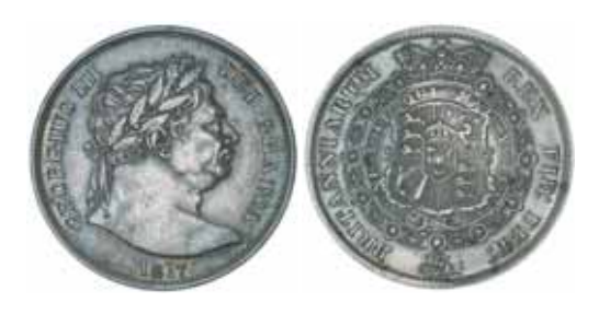
1608* George III , new coinage, halfcrown, large or 'bull' head, 1817 (S.3788). Deeply toned, mint bloom in lettering, extremely fine/good extremely fine.

Ex Fulton Collection with A.H.Baldwin envelope.