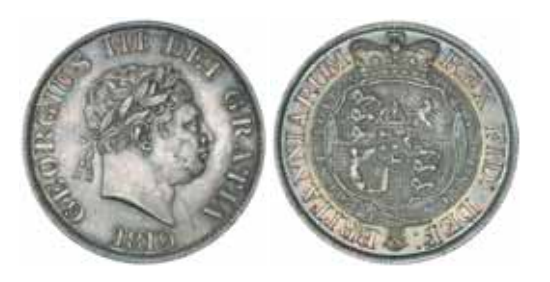
1609* George III, new coinage, halfcrown, small laureate head, 1819 (S.3789). Very attractively toned, uncirculated.