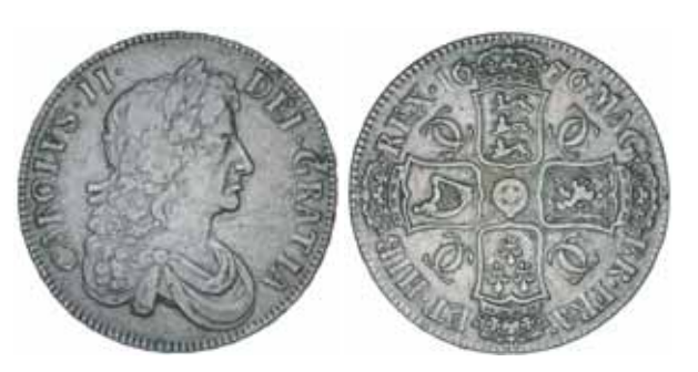
1526* Charles II, crown, third bust, 1676 vicesimo octavo (S.3358). Lightly toned, nearly very fine.