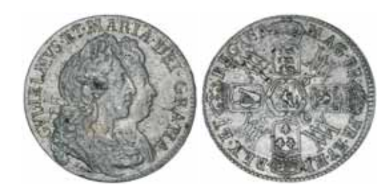
1541* William and Mary , halfcrown, second busts, 1692 quarto (S.3436). Lightly toned, underlying mint bloom, very fine and very scarce.