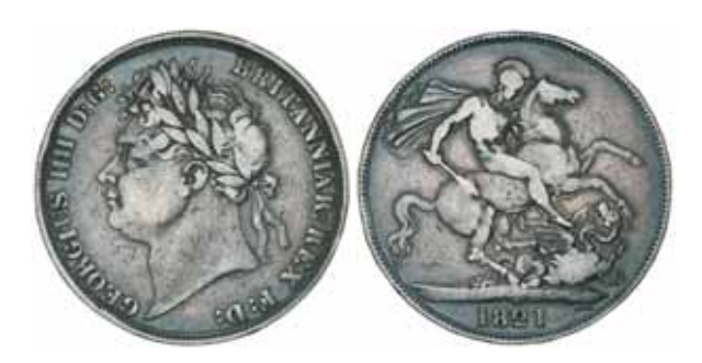
1617* George IV, crown, laureate head, 1821 secundo (S.3805). Minor edge bumps, toned fine.