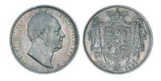
1625* William IV , halfcrown, 1836 (S,3834). Lightly toned, nearly extremely fine. $300

William IV, proof sixpence, 1831, plain edge (S.3836).