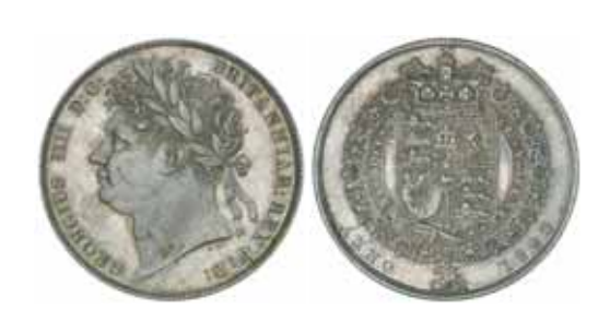
George IV, halfcrown, laureate head, shield in Garter, 1823 (S.3808). Golden brown toned, nearly uncirculated.

Ex Fulton Collection with A.H.Baldwin envelope.