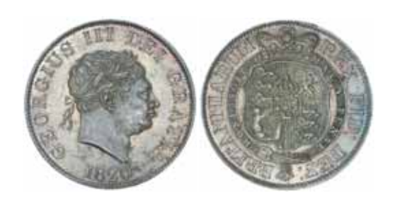
George III , new coinage, halfcrown, small head, 1820 (S.3789). Peripheral die break on lower obverse, underlying dark iridescent mirror-like mint bloom, nearly uncirculated and rare thus.

Unpriced in Spink and noted as extremely rare.