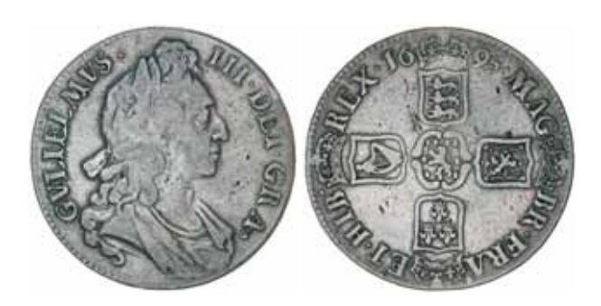
1544* William III, crown, first bust, 1695 octavo (S.3470). Fine. $120