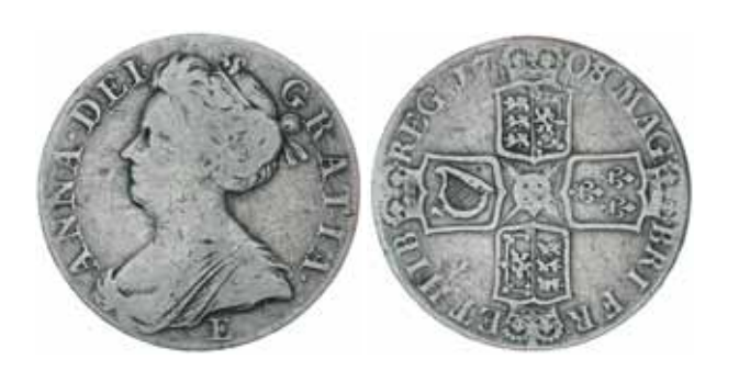
1556* Anne , after the Union, crown, second bust, 1708/7E septimo (S.3600). Evenly worn, nearly fine. $200