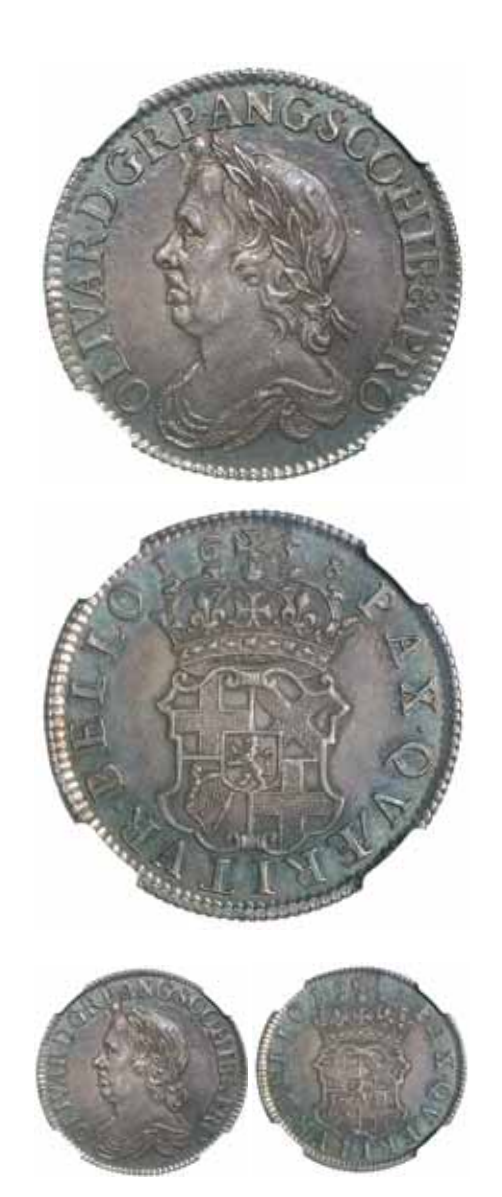
1515* Oliver Cromwell , shilling, 1658 (S.3228). Toned, some brilliance, nearly uncirculated and rare in this condition. $9,000