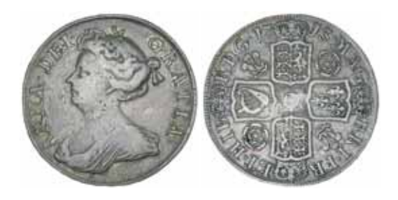
1559* Anne, after the Union, halfcrown, 1713, roses and plumes dvodecimo (S.3607). Toned, good fine. $300