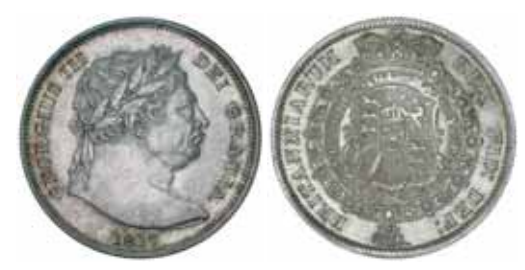
1607* George III , new coinage, halfcrown, large or 'bull' head, 1817 (S.3788), S over I in Pense. Lightly toned, nearly uncirculated and a rare variety.

Ex Fulton Collection with A.H.Baldwin envelope.