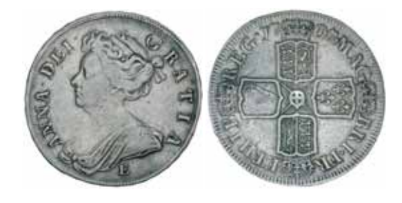
Anne, after the Union, halfcrown, 1707E sexto (S.3605). Nearly fine/fine.