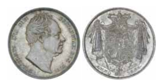
1624* William IV, halfcrown, 1834, WW in script (S.3834). Attractive iridescent tone, uncirculated.