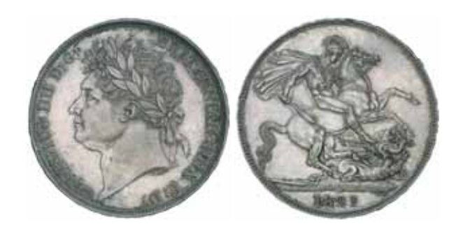
1615* George IV , crown, laureate head, 1821 secundo (S.3805). Well struck, blue grey toned, extremely fine/good extremely fine.