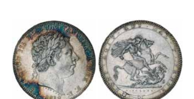
1606* George III , new coinage, crown, 1819 LIX (S.3787). Some toning around obverse edge, much surface scuffing, otherwise nearly extremely fine. $150