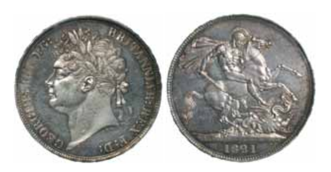
1614* George IV , crown, laureate head, 1821 secundo (S.3805). Minor hairlines in left obverse field, proof-like uncirculated and rare thus.

Ex Fulton Collection with Seaby ticket, 1951.