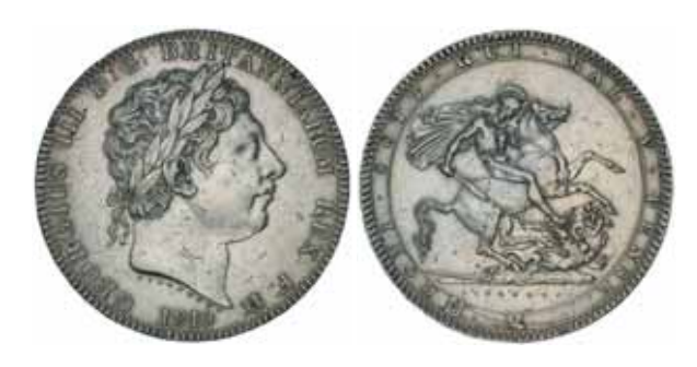
1605* George III , new coinage, crown, 1819 LIX (S.3787). Surface marked and somewhat polished, otherwise good very fine.