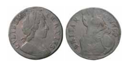
1550* William III , second issue, halfpenny, 1699, unbarred A's in BRITANNIA (S.3555). Thin flan, usual weak areas, otherwise nearly very fine and very rare.