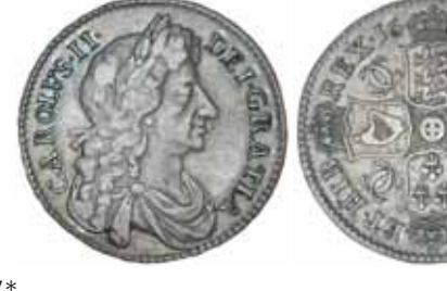
1527* Charles II, halfcrown, fourth bust, 1676 retrograde 1, vicesimo octavo (S.3367). Toned, very fine.