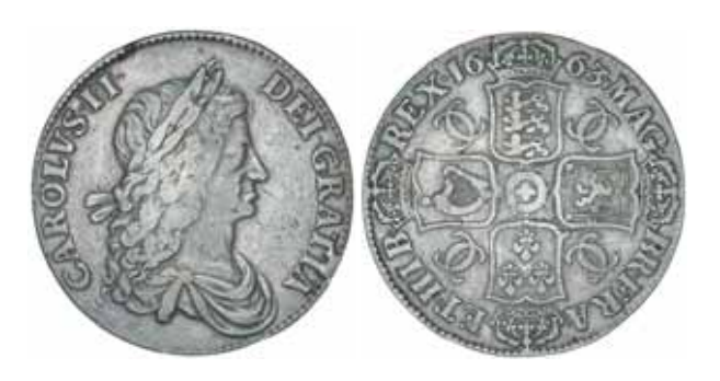
1523* Charles II , crown, first bust, 1663 (S.3354). Light grey tone, good fine.