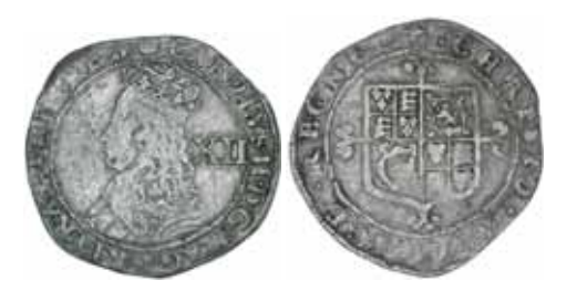
1519* Charles II , hammered coinage, 1660-2, third issue, shilling, mm crown (S.3322). Light grey tone, good fine.