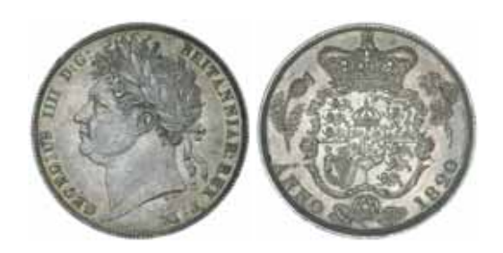
1618* George IV , halfcrown, laureate head, 1820 (S.3807). Nicely toned, nearly extremely fine.