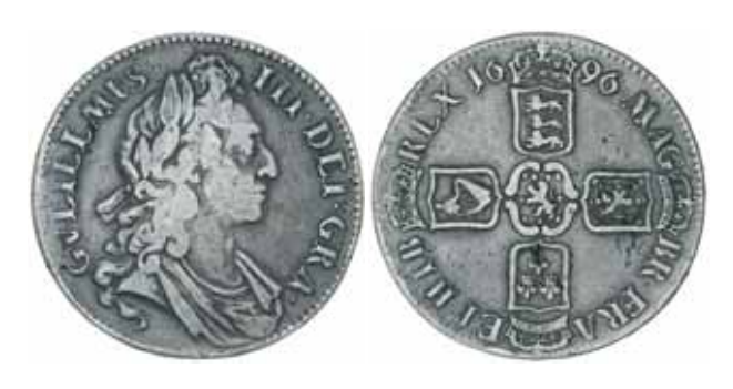
1543* William III, crown, first bust, 1696 octavo (S.3470). Toned fine/good fine. $200