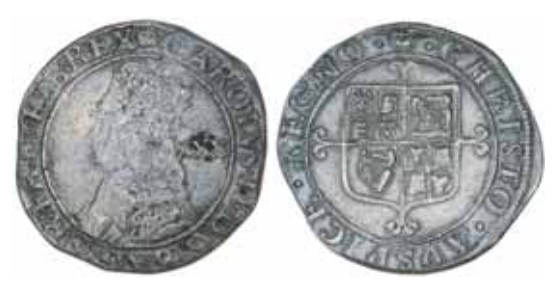
1517* Charles II , hammered coinage, 1660-2, third issue, halfcrown, mm crown (S.3321). Portrait flat, toned and a full coin, fine/very fine, scarce in this condition.