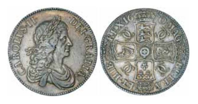
1525* Charles II, crown, second bust, 1670 vicesimo secvndo (S.3357). Very fine. $800

Charles II, shilling, second bust, 1681/0 overdate (S.3375).