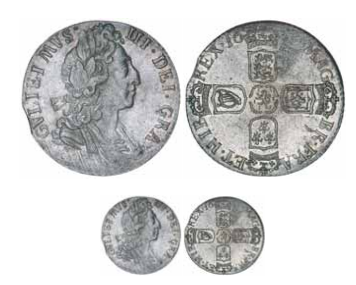
1549* William III , sixpence, third bust, 1697 GVLIEIMVS (S.3538). Minor planchet clip, last two date figures not struck up, otherwise full mint bloom, uncirculated.