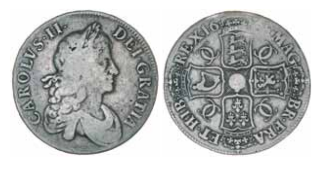
1524* Charles II, crown, second bust, 1668 vicesimo (S.3357). Weak on date, otherwise very good/fine. $150