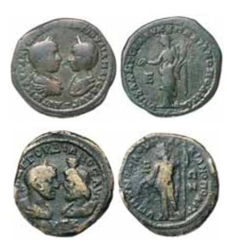
lot 2666 part

With collector's packets and descriptions.