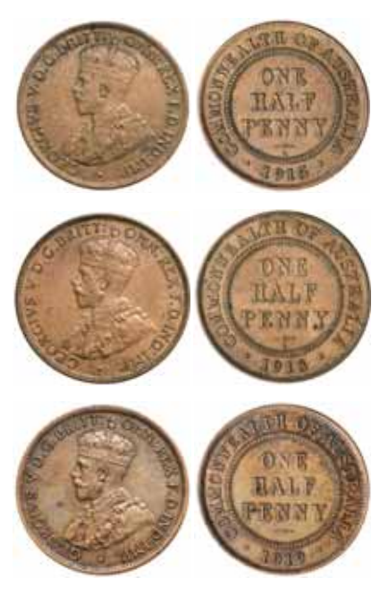
519* George V, 1911, 1913, 1915H, 1916I, 1917I, 1918I and 1919. Nearly extremely fine - good extremely fine. (7) $450