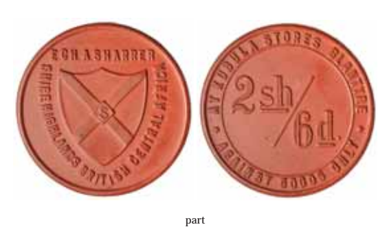
Ex M.M.Andrews Collection.