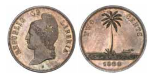
2399* Liberia, pattern two cents, 1868 (KM.Pn16). Spotted brilliant patina, nearly FDC.

Ex Spink Australia Sale 8 (lot 1744) and M.M.Andrews Collection.