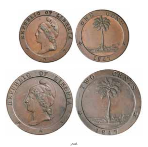
2393* Liberia, one and two cents, 1847 and 1862 (KM.1-4). Brown patina, good very fine - extremely fine. (4) $150