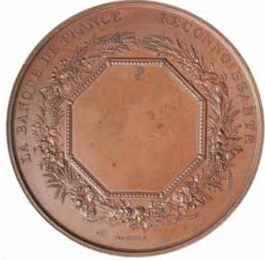
2627* Napoleon , Emperor and King (1809), in bronze (68mm) by

J.P.Droz for the Bank of France (B.915). Chocolate brown patina, good extremely fine.