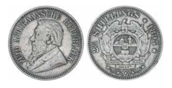
2476* South Africa, ZAR, Paul Kruger, two and a half shillings, 1892-97 (KM.7). Very good - very fine. (6)