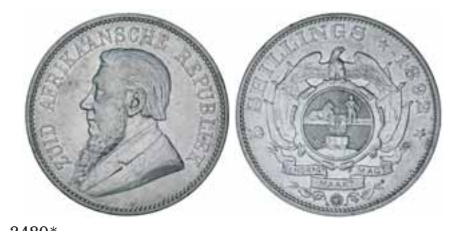
South Africa, ZAR, Paul Kruger, crown or five shillings, 1892, double shaft (KM.8.2). Cleaned, nearly extremely fine.