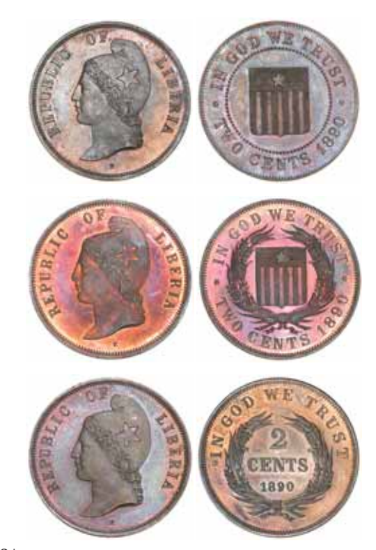
2403* Liberia, pattern two cents, 1890 (KM.Pn51, 52 and 54). Brown and red, nearly FDC. (3)