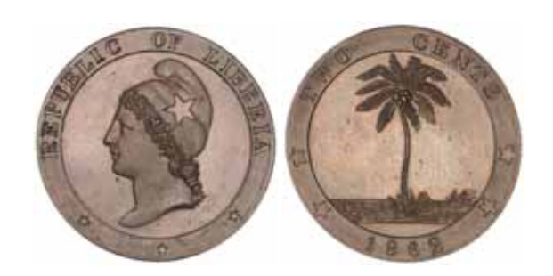
2395* Liberia, bronzed proof two cents, 1862 (KM.4). Attractive medium brown brilliant patina, FDC.