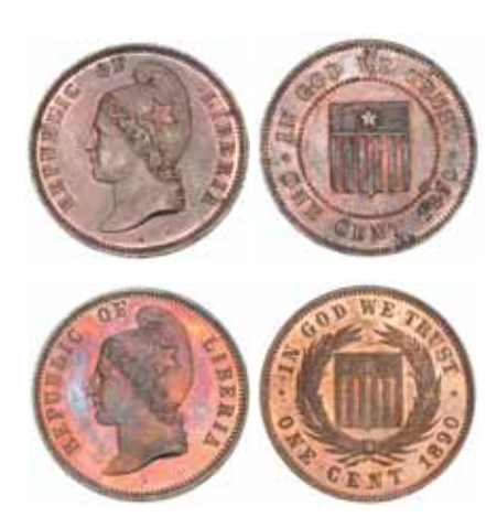
2401* Liberia , pattern one cent, 1890 (KM.Pn47, 48). First toned, second red and brown, nearly FDC. (2)