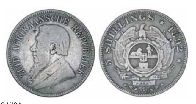
2479* South Africa , ZAR, Paul Kruger, crown or five shillings, 1892, single shaft (KM.8.1). Evenly worn, very good. $100