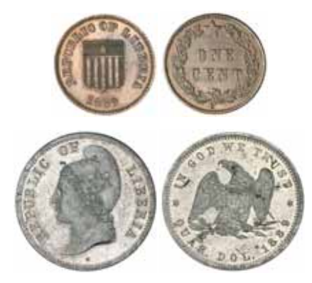
2400* Liberia, pattern one cent, 1889, and pattern twenty five cents in cupro-nickel, 1889 (KM.Pn18, 22). Nearly FDC. (2) $300

Ex Spink Australia Sale 8 (lot 1743) and M.M.Andrews Collection.