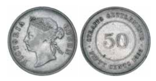
2495* Straits Settlements. Q

In slabs by NNC as AU50; PCGS as MS62; NNC as MS64.