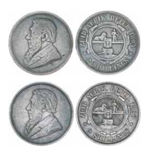
2475* South Africa, ZAR, Paul Kruger, two shillings, 1894 and 1896 (KM.6). Toned, nearly very fine. (2) $100