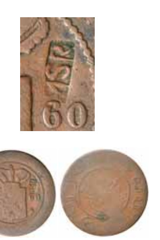
2419* Netherlands East Indies, one cent, 1860 (KM.307.2) countermarked MSR in relief in sunken rectangle on obverse. Evenly worn, very good and rare with a countermark.