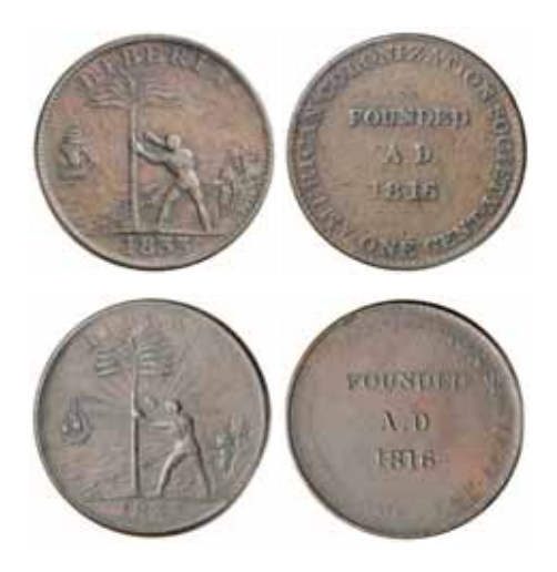
2392* Liberia, token coinage, one cent, 1833 (KM.Tn1, 2). Very fine; nearly extremely fine. (2)