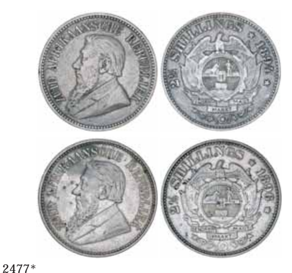
South Africa , ZAR, Paul Kruger, two and a half shillings, 1894 and 1896 (KM.7). Nearly very fine; good very fine. (2)