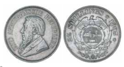
2478* South Africa, ZAR, Paul Kruger, two and a half shillings, 1895 (KM.7). Nearly extremely fine.