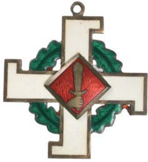
3736* Latvia , Cross of Merit of the Civil Guard, instituted 1919. No ribbon, reverse lacquered, otherwise very fine and scarce. $150