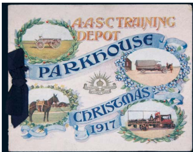
lot 3833 part