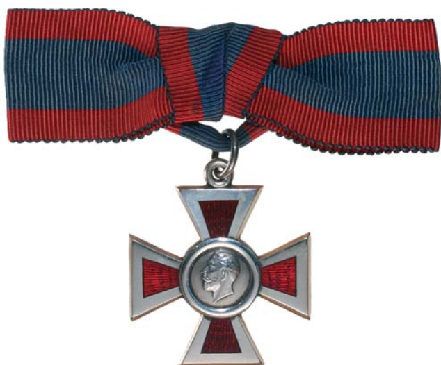
3494* Royal Red Cross , Second Class (ARRC) (GRI) in silver, ladies issue. Extremely fine.