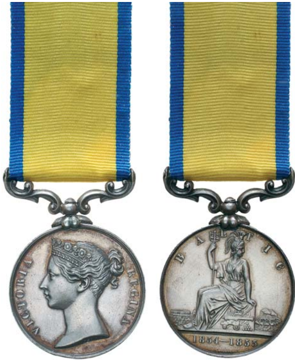
3507* Baltic Medal 1854-55. Unnamed. Hairlines, small edge bump on obverse, otherwise good very fine.