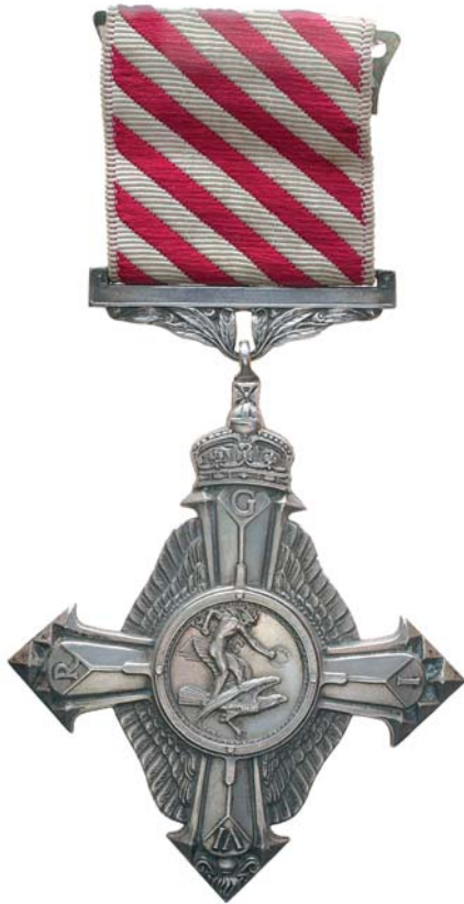
3714* Air Force Cross, (GVIR) (GRI reverse), in case of issue. 1945 on reverse of bottom arm. Engraved. Extremely fine. $2,500

Together with photocopies of various documents including letter of invitation dated 16 September 1975 to Investiture at Government House, New Zealand, addressed to Sqd. Ldr. H.A. Nash MVO, AFC; photo and newspaper clipping relating to investiture; telegrams of congratulations (3).