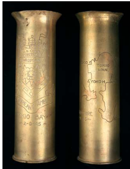
lot 3682 part

Qualified for Italy Star while seconded to Royal Navy hence it was issued through the Admiralty in England and unnamed.