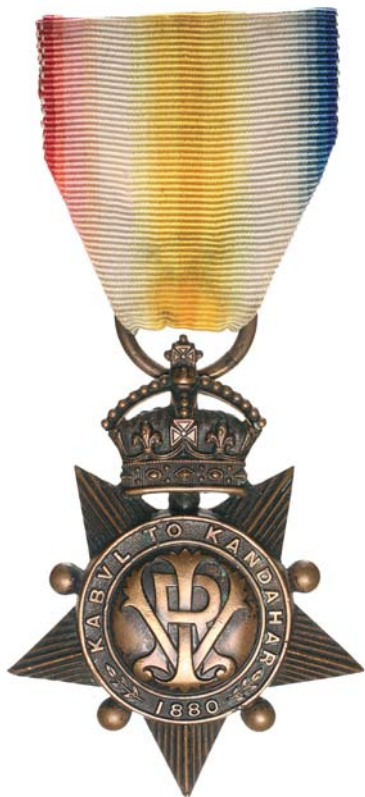
3522* Kabul to Kandahar Star. Unnamed. Good very fine. $120

3524 Singles: Egypt Medal 1882, - clasp - Tel-El-Kebir. 143? Pte R. Bell. 1/Sea. Highrs. Engraved.; Royal Naval Reserve Long Service and Good Conduct Medal (GVR Admiral's uniform). A.B. F. Wilson. Impressed. Two single medals, the first medal with many contact marks and considerable wear to edge naming, very good, the other medal very fine.