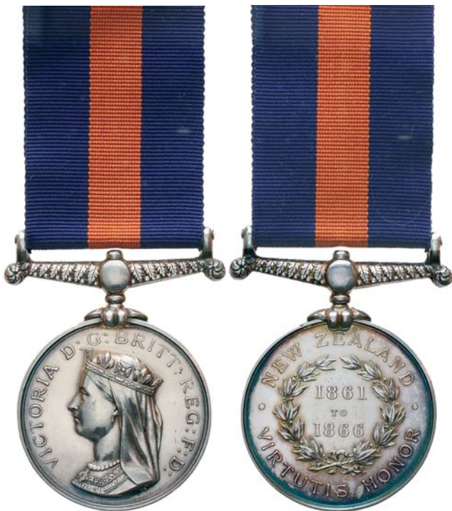
3604* New Zealand Medal 1869 , with 1861 to 1866 reverse. P. Cayle 3rd Waikato Regt. Engraved. Very fine. $800

Together with original matching miniature medal.