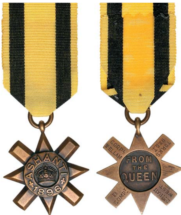
3528* Ashanti Star 1896. Corpl W.Ellam B Compy. 2nd Batt West Yorks Regt. Engraved. Some graffiti scratches on the reverse of one arm of the star, otherwise very fine.