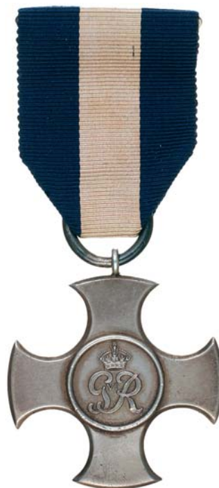
3496* Distinguished Service Cross , (GVIR type 2), with brooch suspender bar, scarce 1949 onwards issue in Garrard & Co case marked 'D.S.Cross', no hallmark (specimen?). Very fine.