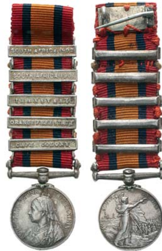
3605* Queen's South Africa Medal 1899 , type 3 reverse, - five clasps -Cape Colony, Orange Free State, Transvaal, South Africa 1901, South Africa 1902. Major P.L.Murray, N.S.Wales M.R. Chisel engraved. Extremely fine. $1,000

Together with original matching miniature medal.