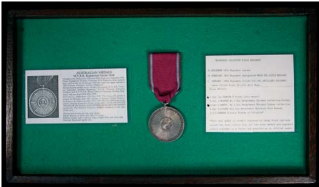
3603* Melbourne Volunteer Rifle Regiment Medal , in silver (44mm) with suspender bar. To Sergt Jas Duncan, B. Troop, V. V. A. R. 24th May 1858. Engraved. Display mounted on board, a small edge bump, otherwise extremely fine and very rare. $6,000