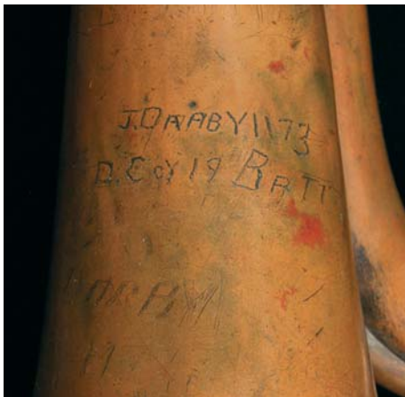
lot 3636 part

From his arrival at Gallipoli until his departure, some of the entries in Bugler Darby's diary include (shown as written without punctuation),