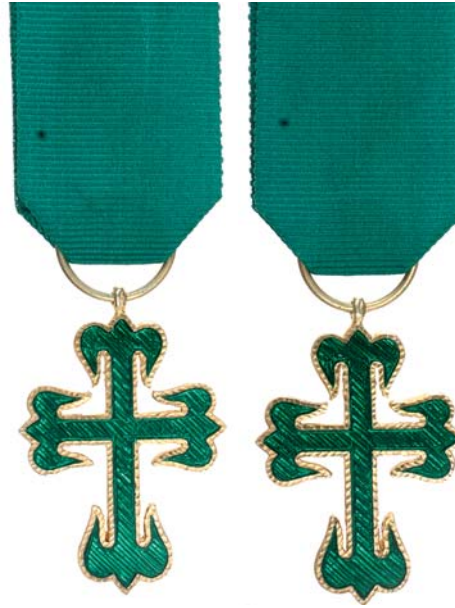
3739* Portugal , Order of Aviz Knight's breast badge (Military), WWI period. Uncirculated.