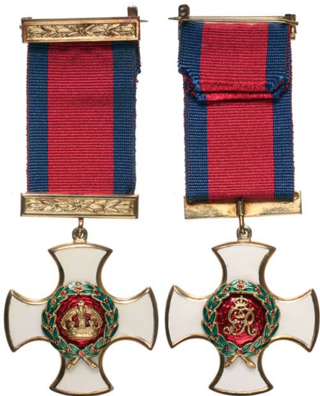
3492* Distinguished Service Order , (GVR). Probably a copy. Good extremely fine.