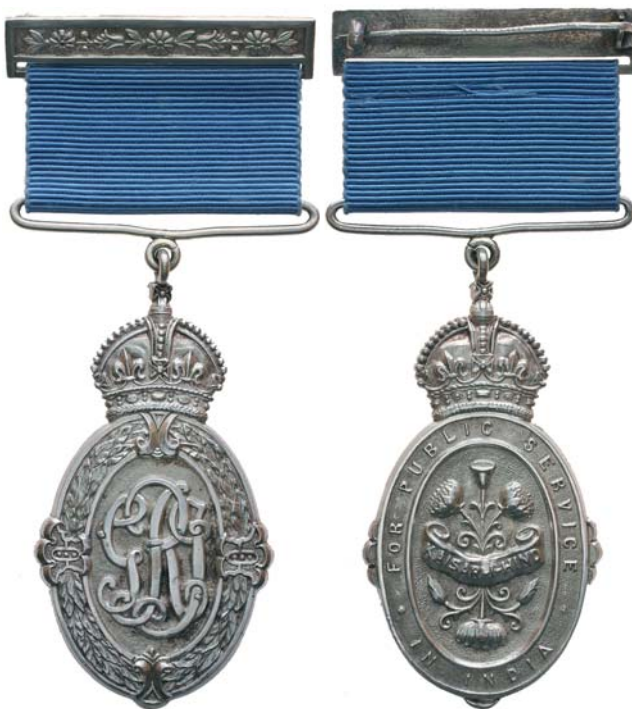
3497* Kaiser-I-Hind Medal , in silver (GVR type 2). Extremely fine.