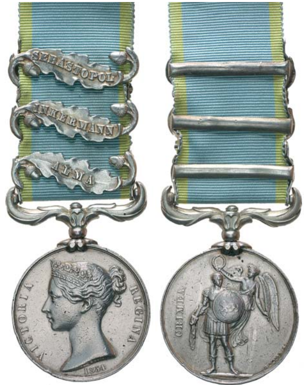
3509* Crimea Medal 1854-56, - three clasps - Alma, Inkermann, Sebastopol. 2517 Nicholas Doolan. 28th . Regt. Impressed but some letters out of alignment and first number too far left of name. Edge nicks and contact marks, otherwise good fine.