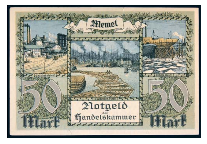
Germany , Memel, notgeld issue, fifty mark, No. 074798, 22 February 1922 (P.7). A 3mm tear in top margin, otherwise nearly uncirculated.