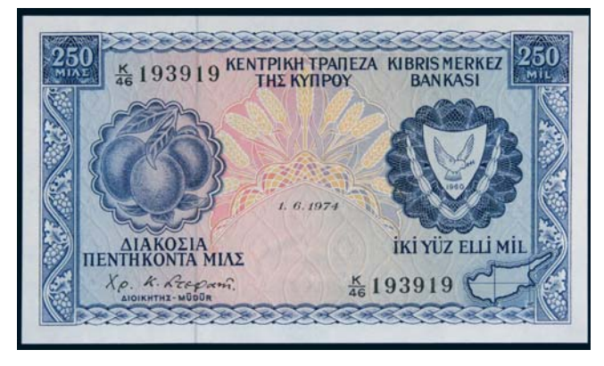
lot 2637 part

Slabbed by PMG as 64 Choice Uncirculated.