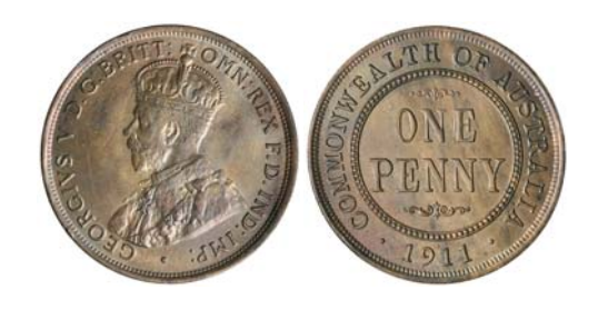
2357* George V, 1911. Brown and red uncirculated.