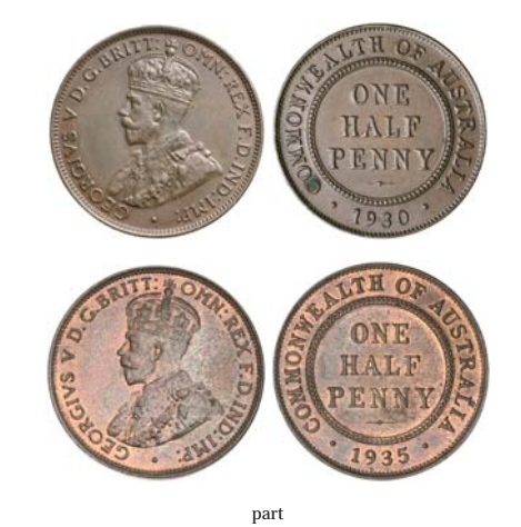
2415* George V, 1911, 1930, 1935 and 1936. Good extremely fine - uncirculated. (4) $200