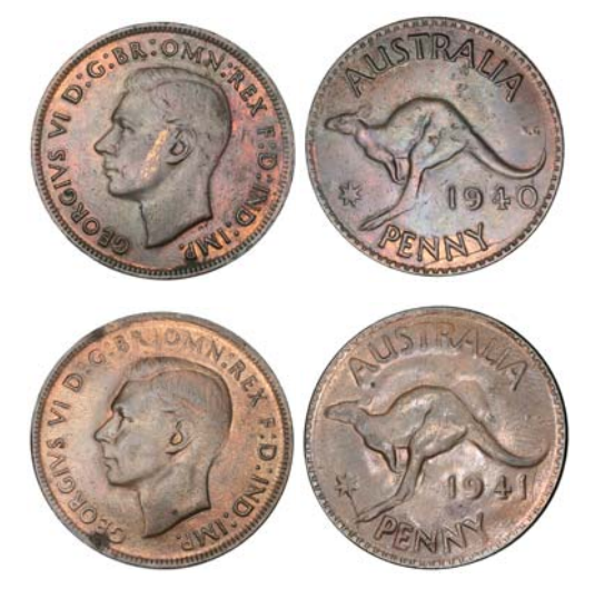
George VI , 1940 K dot G and 1941 K dot G. Usual flat strikes, especially the 1941, some mint bloom, nearly uncirculated. (2) $150

Ex Jon Saxton Collection (first from WA auction April 2001, lot 551).