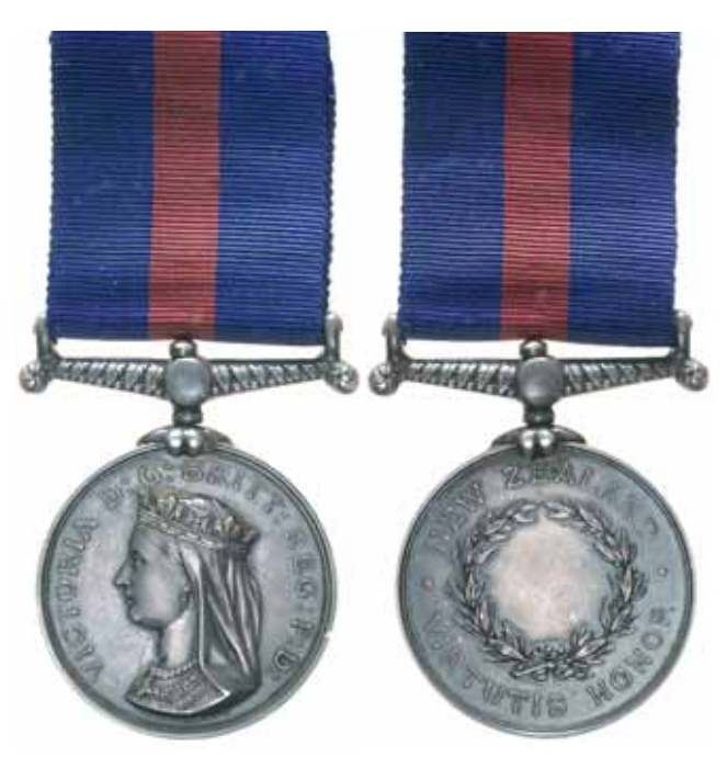
Settled in NZ Served in 1st Waikato Regiment