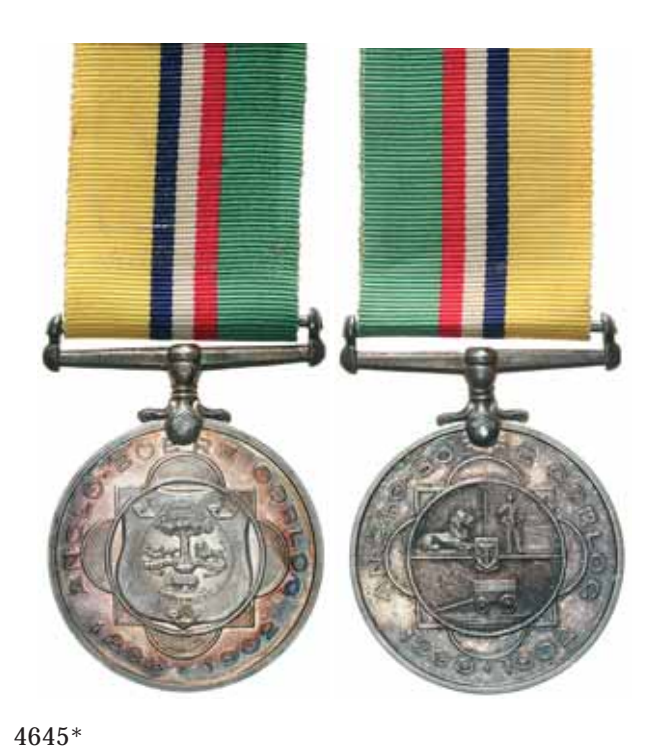
South Africa, Anglo-Boer War Medal 1920. Burger A.J. Oberholzer. Impressed. Toned extremely fine. $120