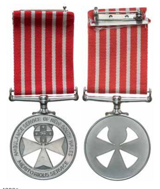
4290* Ambulance Service of New South Wales, Meritorious Service Medal, unnamed. Uncirculated.