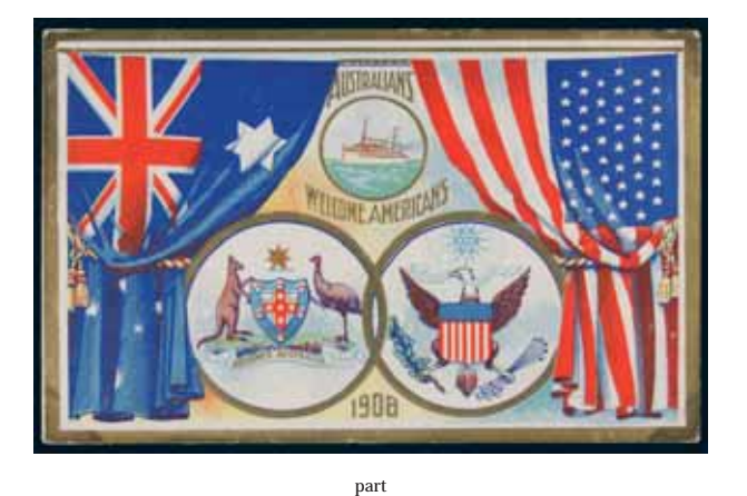
USA, Great White Fleet Visit to Australia, 1908 (53), postcards, also assorted general views of the ships. In an album, good - extremely fine. (112)