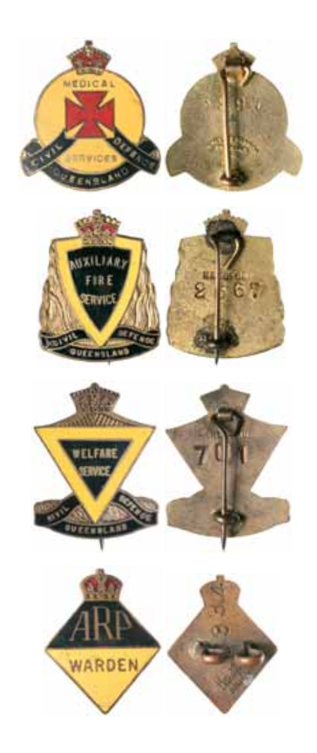
Queensland Civil Defence badges, Medical Services, Auxiliary Fire Service, Welfare Service, Warden, . Extremely fine. (4) $200