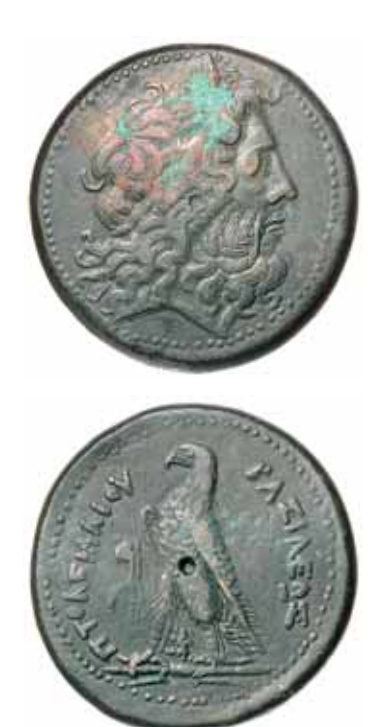
Egypt, Kingdom of, Ptolemy III, (246-221 B.C.), AE 43, copper drachm, (69.77 g), Alexandria mint, obv. diademed head of Zeus Ammon to right, eagle to left, on thunderbolt, closed wings, XP monogram between, (S.7814, Sv.964, SNG Cop. 171-2, Pitchfork 30). Area of green oxidation on the obverse, otherwise very fine or better, scarce as such.